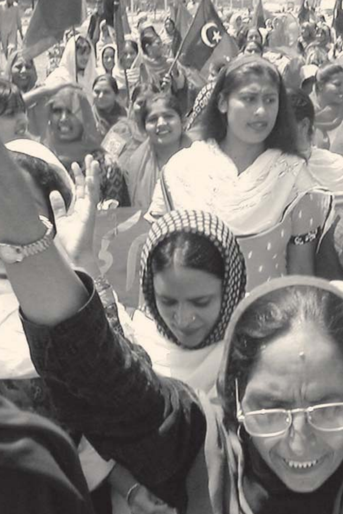
Women activists at a rally in Islamabad, Pakistan on International Labour Day.