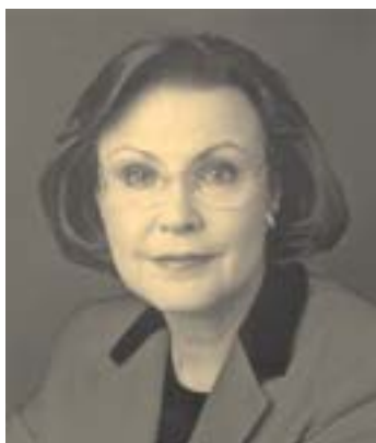
HEIDEMARIE WICZOREK-ZEUL Federal Minister for Economic Cooperation and Development

ing the MDGs. The HIV/AIDS pandemic seriously threatens the attainment of all of the other Goals. If development cooperation is not determinedly aligned to support the achievement of all of the MDGs, efforts at the national level may be in vain. And, as this booklet details in particular, gender inequalities are closely intertwined with every development challenge the MDGs are attempting to address.