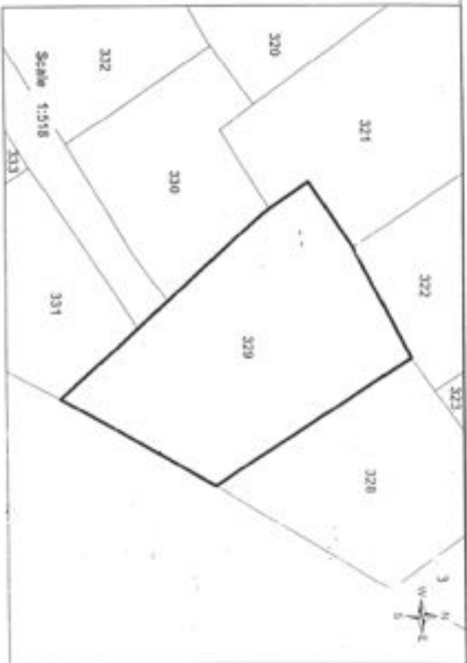
MAP OF PARCEL

Note Parcel Map prepared based on General Boundaries Principle