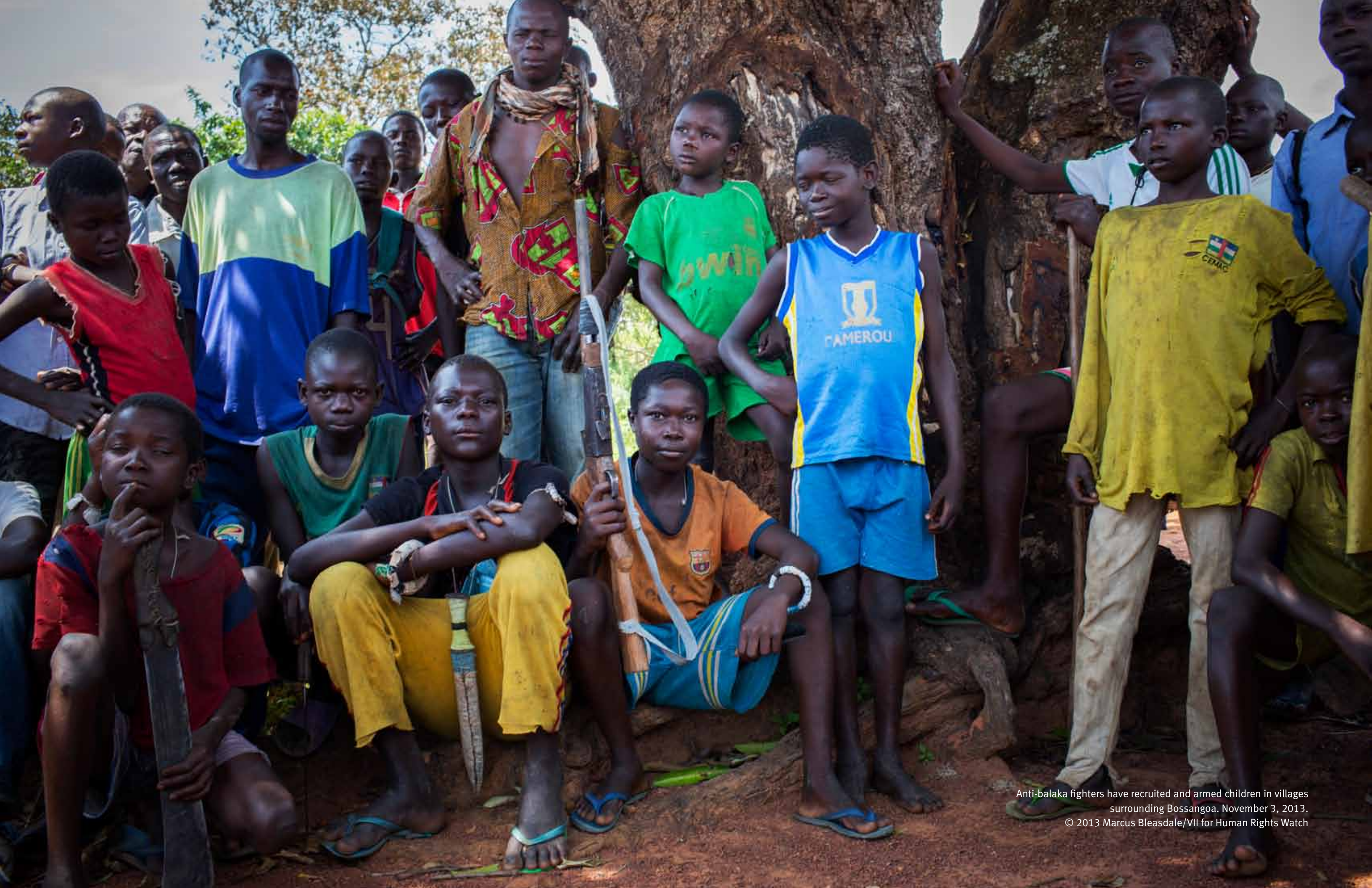
Anti-balaka fighters have recruited and armed children in villages surrounding Bossangoa. November 3, 2013.