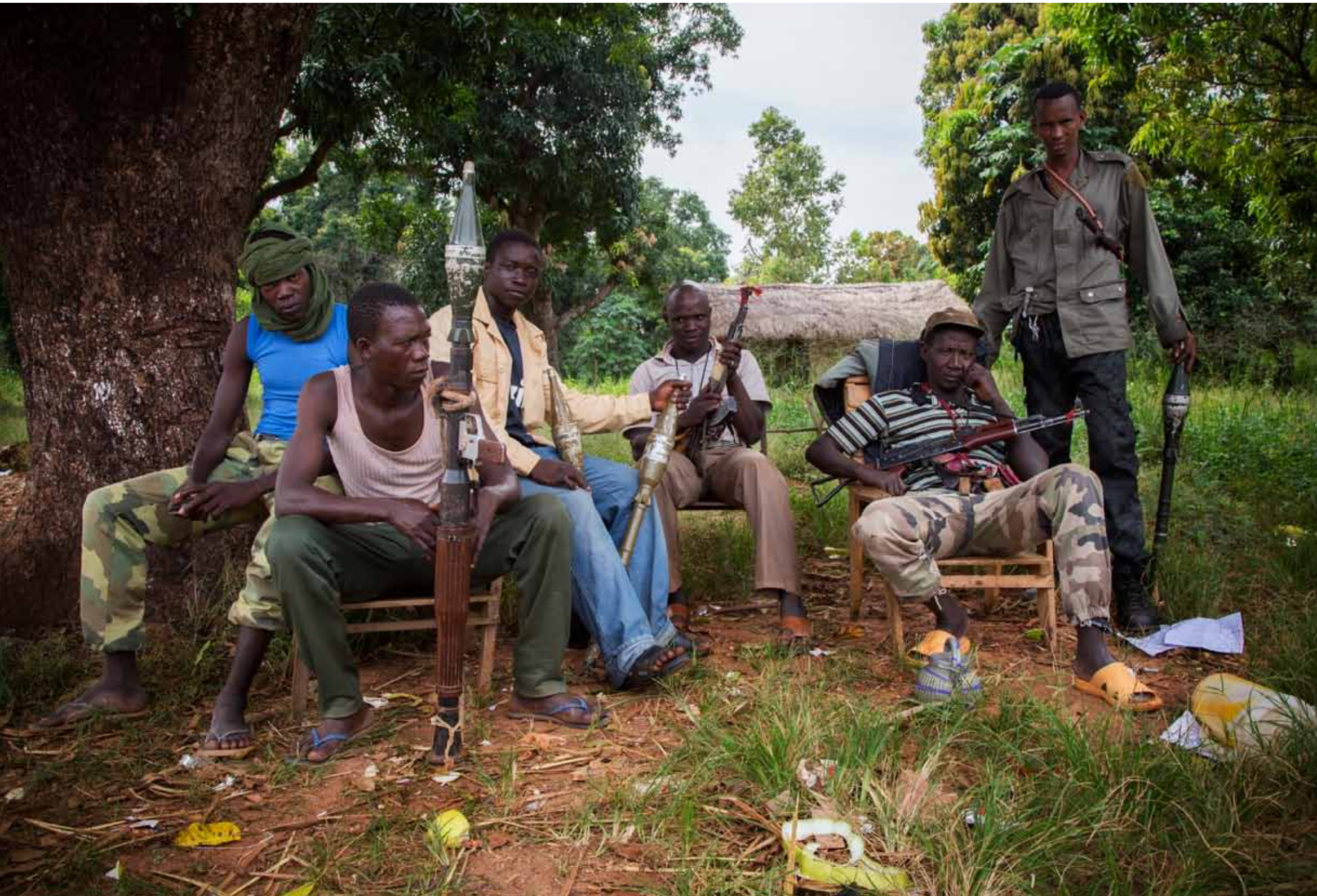
Ex-Seleka fighters at a checkpoint on the road out of Bossangoa. They regularly rob local residents who have to cross the checkpoint to return to town after searching for food in the countryside. November 4, 2013.