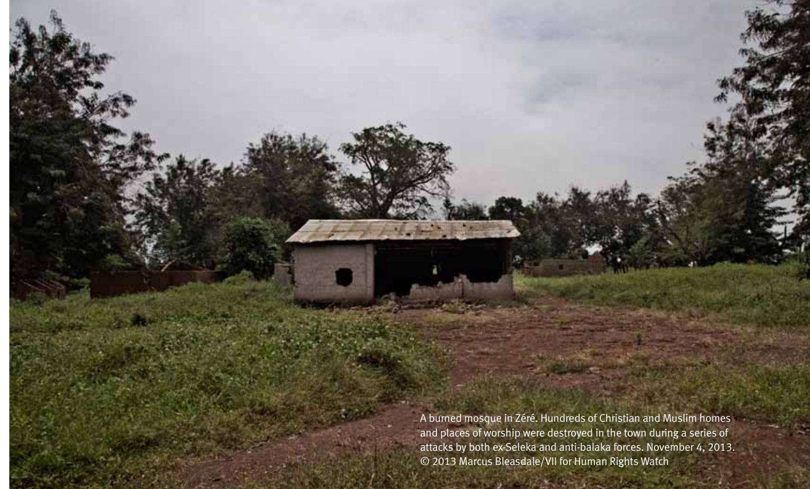
A burned mosque in Zéré. Hundreds of Christian and Muslim homes and places of worship were destroyed in the town during a series of attacks by both ex-Seleka and anti-balaka forces. November 4, 2013.

kilometers south of Bossangoa. According to a Muslim resident who witnessed the attack, 11 Muslim families lived in the area, and there were no ex-Seleka fighters present. The Muslim residents began to hear rumors that the anti-balaka were preparing to attack their community. Muslim residents sent a representative to Bossangoa on September 10 to ask ex-Seleka fighters to come protect them, but the ex-Seleka fighters turned down the request, saying they had no fighters or vehicles to spare. 16