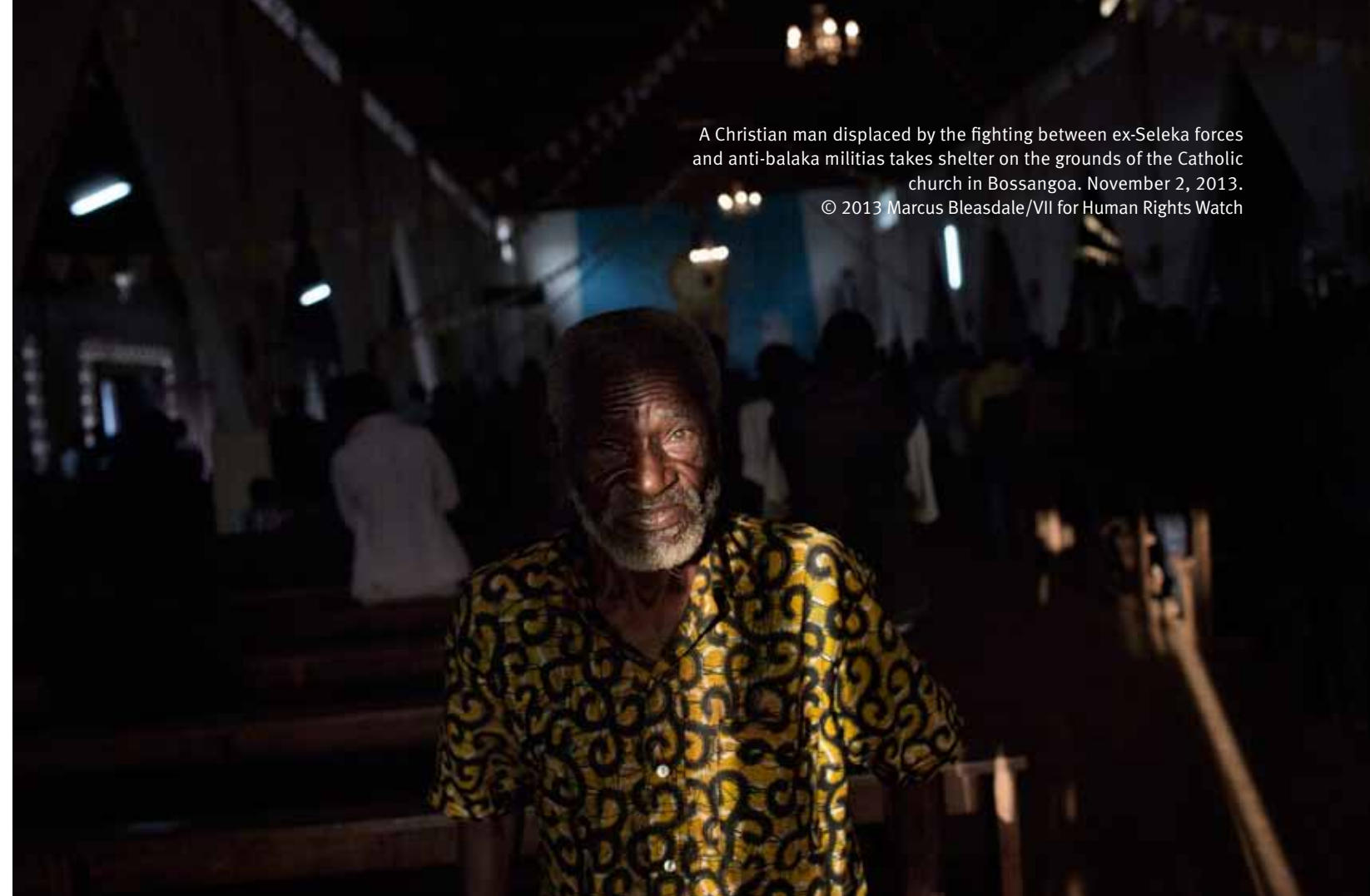
A Christian man displaced by the fighting between ex-Seleka forces and anti-balaka militias takes shelter on the grounds of the Catholic church in Bossangoa. November 2, 2013.

labor, Faranganda was slow in fleeing from the ex-Seleka fighters. They shot her dead just outside her house. 75