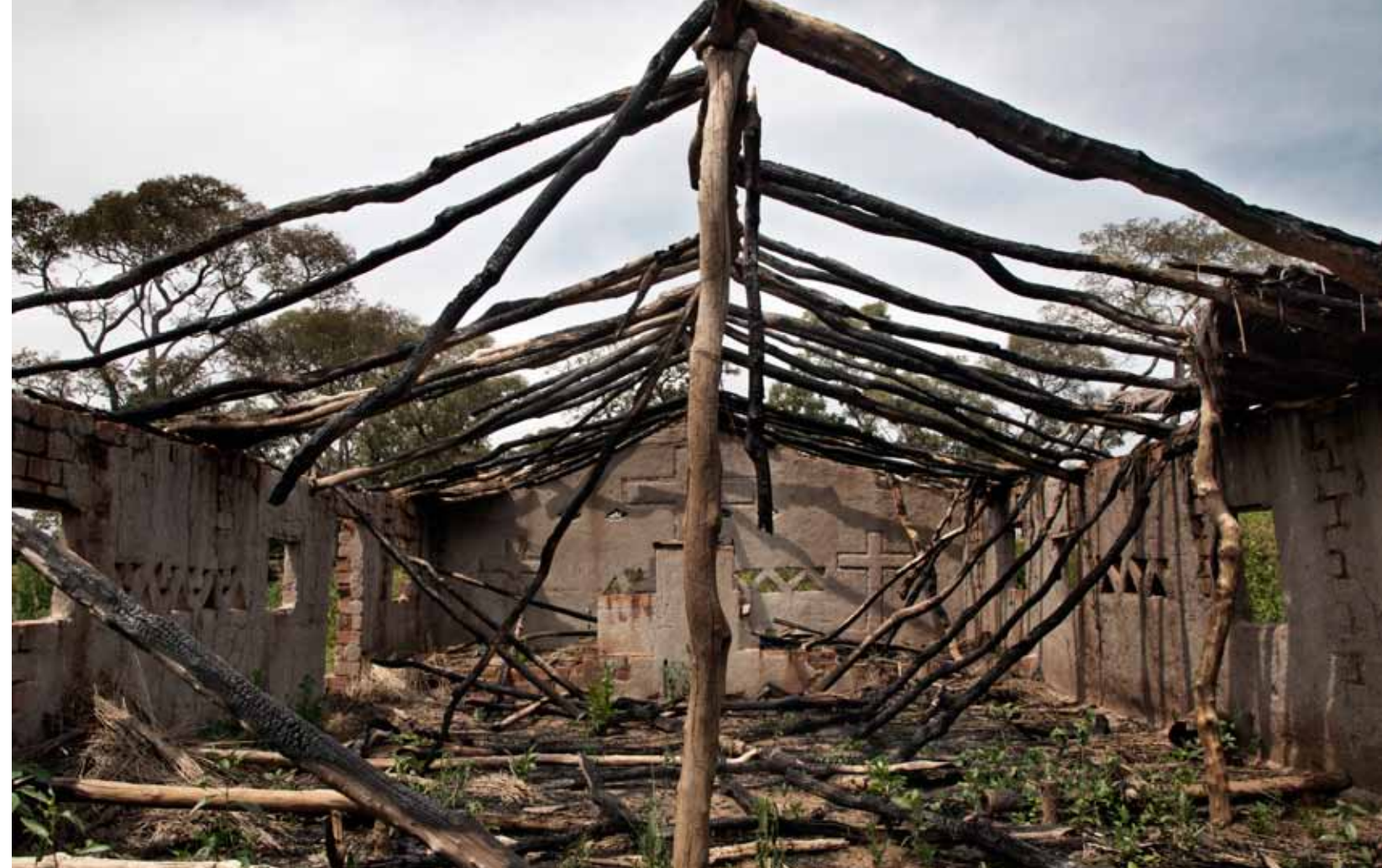
A burned Pentecostal church in Zéré. Hundreds of Christian and Muslim homes and places of worship were destroyed in the town during a series of attacks by both ex-Seleka and anti-balaka forces. November 4, 2013.