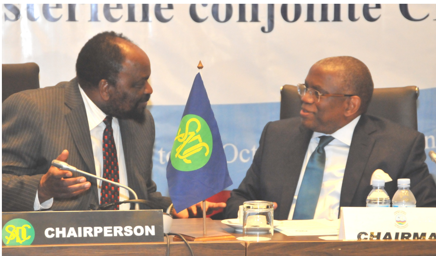
Co-Chairs Hon. Simbarashe S. Mumbengegwi, Minister for Foreign Affairs of the Republic of Zimbabwe and Chairperson of SADC Council of Ministers (L) and H.E George Chikoti, Minister of External Relations of the Republic of Angola and Chairperson of the ICGLR Regional Inter Ministerial Committee

Ministers of Defense and Ministers of Foreign Affairs for the International Conference on the Great Lakes Region (ICGLR) and the Southern African Development Community (SADC) concluded their joint meeting on Monday 20 th October, 2014 and reiterated to the use of