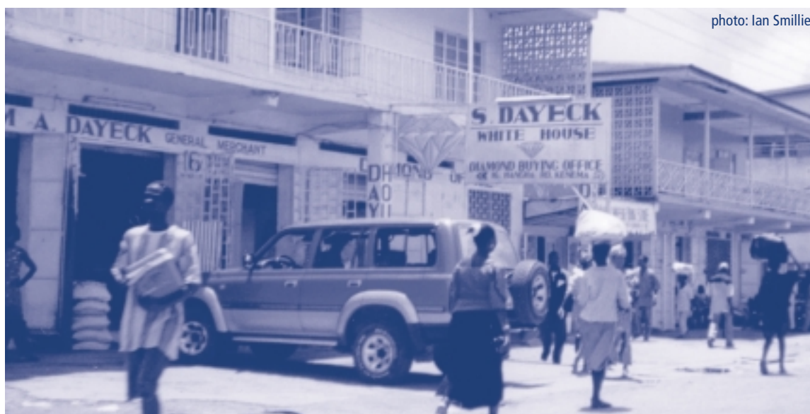
One of Kenema's many diamond dealers.

The Alluvial Diamond Mining Scheme of 1956 was enacted as a result of the great diamond rush of the early 1950s, which created near-chaos in the diamond