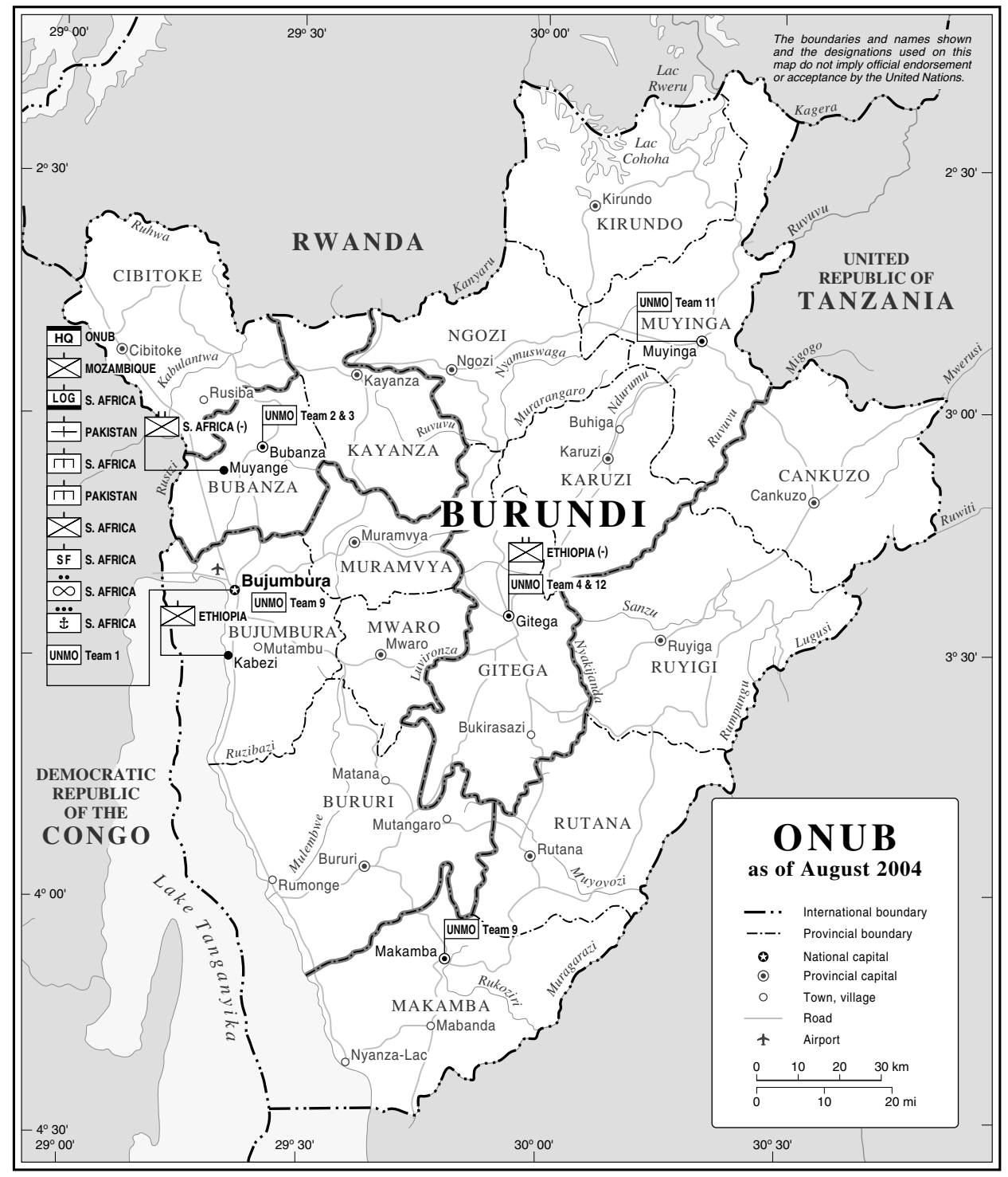
Map No. 4222 UNITED NATIONS August 2004

Department of Peacekeeping Operations Cartographic Section