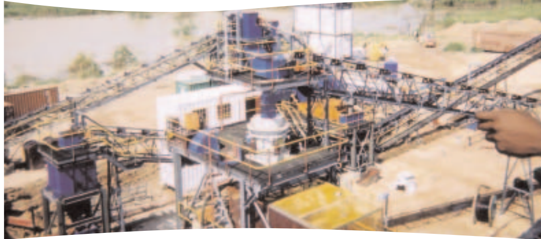
KH Operations in Koidu