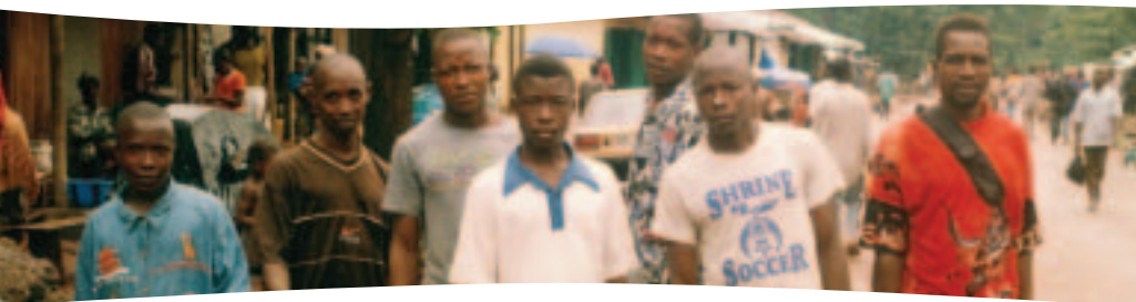
Artisanal Alluvial Diamond Miners

There is, first, the element of “better security prevailing in Sierra Leone,” which has allowed “large numbers of people [to return] to the mining areas, resulting in increased participation in, and intensification of, mining activities.” Second, the new De Beers “Supplier of Choice” marketing strategy has dramatically reduced the number of sightholders the company sells to, forcing more buyers to look for their rough diamonds on the open market, thereby increasing the demand worldwide. Third, the Kimberley Process Certification Scheme (KPCS) “has created a positive impact on the diamond industry, [making] it difficult to trade diamonds outside the scheme.” And fourth, “Liberia, the traditional smuggling route, is still under a UN ban from exporting diamonds,” thus eliminating its “ability to create a negative impact on Sierra Leone’s diamond exports.”