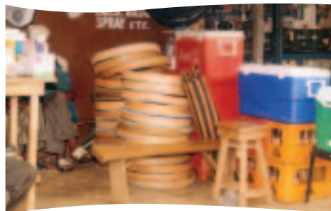
Diamond Sieves and Shovels on Sale

The existence of diamonds in the North was first noted in the mid-1980s when it was rumoured that a resident of Kabatha village had found a diamond. There was a large influx of people from other parts of the country, but nothing substantial was discovered. Since then, theories about the existence of diamond deposits in the Northern region have been based on trial and error. During the decade-long rebel war, however, the Revolutionary United Front (RUF) occupied Kamakwie in Bombali District, and were reported to have engaged in serious diamond mining between 1998 and 2000. Several stories of their finds were reported in the media.