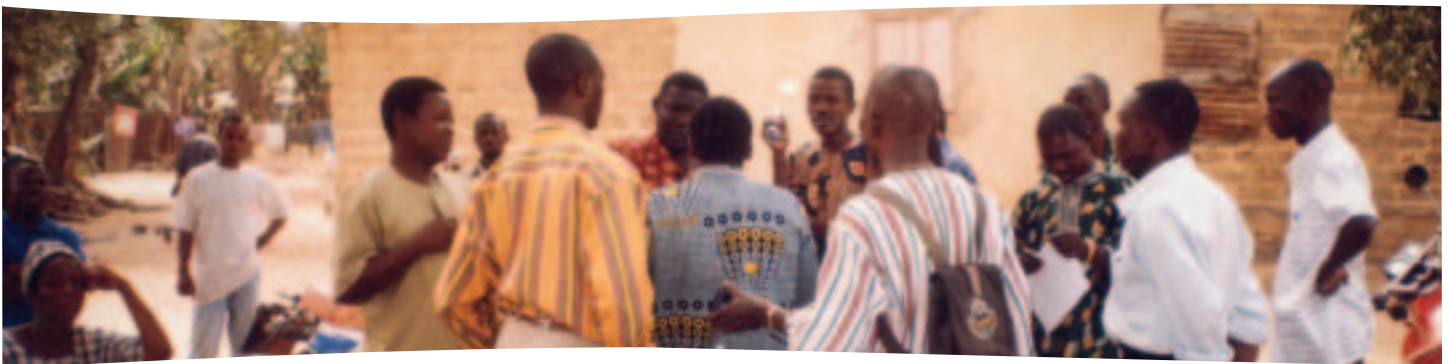
A Meeting of the Campaign For Just Mining

CJM was instrumental in the establishment of the Diamond Area Community Development Fund, which in 2004 was expected to return almost a million dollars from the diamond export tax to the communities where diamonds are mined. Today, a wider National Advocacy Coalition on Extractives (NACE) draws its membership from CJM, from human rights and environmental NGOs, the Anti-Corruption Commission and the Ministries of Mines and Mineral Resources and Local Government. Going beyond diamonds, NACE recognizes that extractive industries are a key to the country's governance, human rights, peace and development.