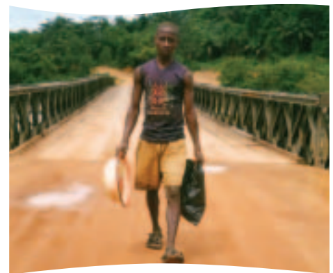
Alluvial Diamond Digger

A 2002 study by World Vision surveyed 500 child miners in Kono District and noted that the children “usually got involved in mining at an early age; initially on a part-time basis, but they eventually became fully engrossed into it, thereby interfering with their education or any other option that promises a better future.” ( See article on child miners on page 8. ) There were, the report noted, “those who were doing well in school but had to abandon their educational pursuit to follow their peers who transiently became rich and admirable.” Eighty three per cent of those surveyed said they were directly involved in mining activities, and 8.6 per cent said they “went to the mining sites to prepare food for the miners but they spent all the day at the mining sites.” Seventy-five per cent of those surveyed said they chose mining all on their own “to get money,” while 15.2 per cent claimed they were engaged in mining because they had no alternative. A further 6.2 per cent claimed they were influenced into joining by their friends, and four per cent said they were sent into mining by their parents.