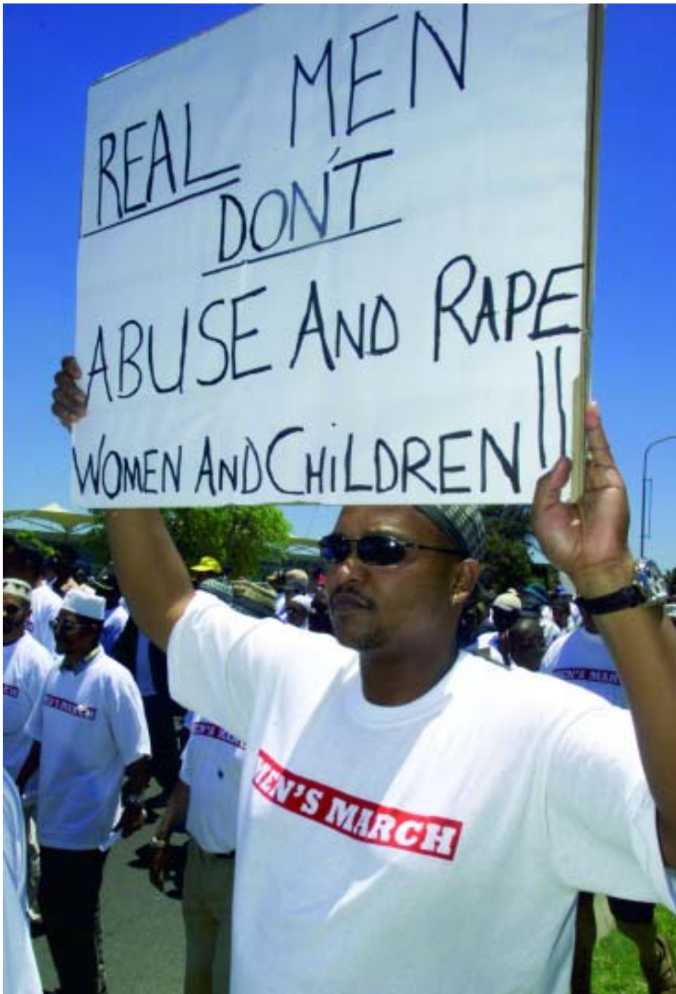
Marchers demonstrating in Cape Town, South Africa, about violence against women and children, November 2001.