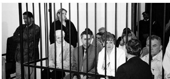
Defendants in the so-called HIV trial during a hearing at the Benghazi Court of Appeal on 16 February 2004.

While Amnesty International recognizes the pressing need to bring to justice anyone responsible for the tragic consequences for these children and their families, it is imperative that the rights of the accused are respected at all stages, from the moment of their arrest. It is only by means of a fair trial that follows due legal process that the truth will emerge about how these children became infected with the HIV virus and those responsible be held fully to account.