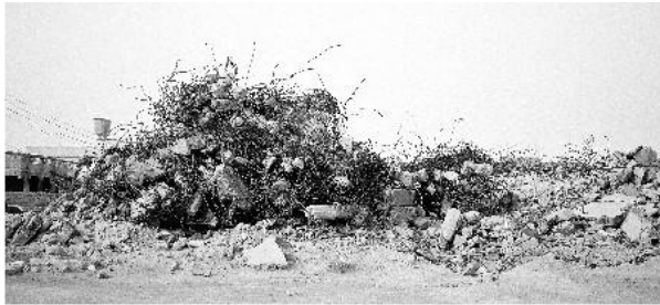
A house in Bani Walid demolished as a result of the policy of collective punishment ©AI, February 2004

While in Bani Walid, Amnesty International delegates met “offenders” and their relatives, who had been subjected to forms of collective punishment. Amnesty International was told that on 15 October 2002 six houses belonging to members of the al-Jadik clan were demolished in Bani Walid. Since 1993 members of the al-Jadik clan have reportedly been intermittently subjected to varying forms of punishment, including temporary suspension of basic services such as telephone and electricity, temporary eviction from their homes, not receiving a salary for prolonged periods, not being allowed to study or to work and being asked to leave the area.