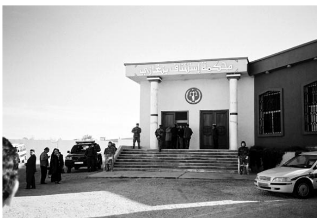
Benghazi Court of Appeal.

Delegates also attended a hearing before the Benghazi Criminal Court in the trial relating to 426 children infected with the HIV virus while in the care of al-Fateh Children's Hospital in Benghazi. Delegates