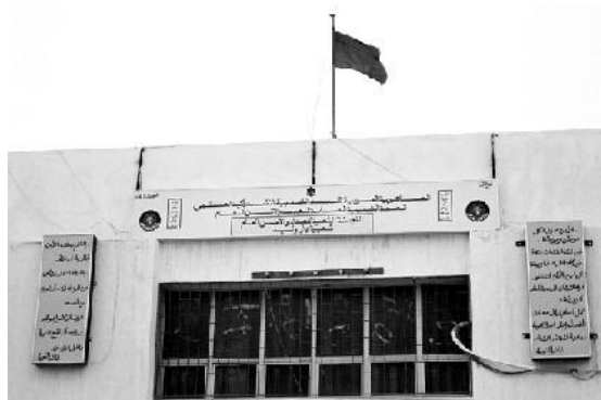
Local branch of the People’s Committee for Justice and Public Security in Bani Walid, where Amnesty International delegates met local officials. The right hand plaque gives a definition of “heresy” ( zandaqa), signed in the name of the Leader of the Revolution. It says, “hostile intelligence work prepared in the framework of a strategy against religion and the nation”.

This “Charter of Honour” establishes the notion of collective responsibility for the actions of others at three main levels: the family; society; and at an official level. Further, the text of the Charter allows for the application of collective punishment to all members of a given group, whether small or large, believed to be linked to the “crime”. As punishment, the Charter prescribes in broad terms deprivation of public services and publicly-funded projects. It appears that this can mean being deprived of the right to participate in the Basic People’s Congress and of the right to benefit from public services, such as electricity, water and telephone, as well as access to food supplies, social benefits or basic administrative services.