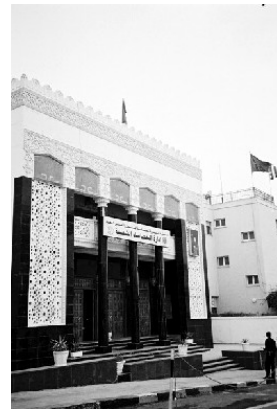
Popular Lawyers' Office in Tripoli.

Once in court the accused is automatically appointed a lawyer, even if he declines the offer. Lawyers are usually appointed during the first hearing of the trial. The court appoints lawyers from the state Popular Lawyers' Office which, as explained to Amnesty International by the Director of its Tripoli Branch and his staff of lawyers, provides legal aid to those in financial need. While Amnesty International welcomes the opportunity offered to defendants in financial need to use court-appointed lawyers before the People's Court, there are many instances where court-appointed lawyers are imposed on defendants seeking to use lawyers of their own choice.