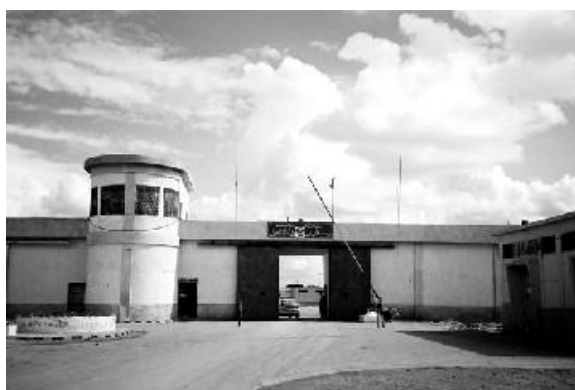
Entrance to al-Kuweifiya Prison in Benghazi.