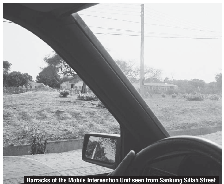
Barracks of the Mobile Intervention Unit seen from Sankung Sillah Street

2. Reporters Without Borders furthermore reiterates its appeal to the African Union to publicly condemn Hydera's murder and to demand a serious investigation from the Gambian authorities, whose capital is the seat of the African Commission on Human and Peoples' Rights (ACHPR).