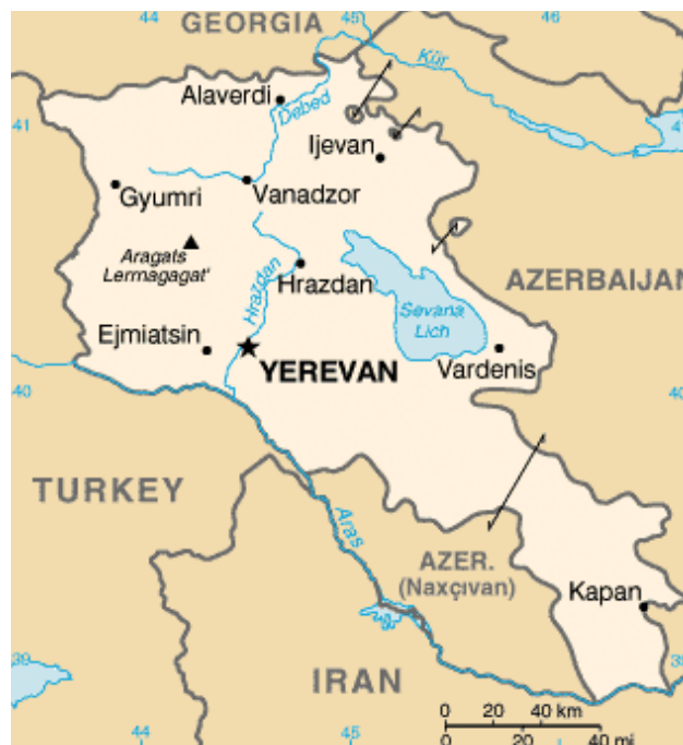
Map of Armenia

In order to attract foreign investment to the diamond sector, the Armenian government scrapped all taxes relating to the import, export and internal transfer of diamonds. No VAT is charged on the movement of diamonds within the country. 125 Additionally, investors of over US$1 million do not pay any tax on their profits in the first year and only 50% of the tax on profit over the next 8 years. 126