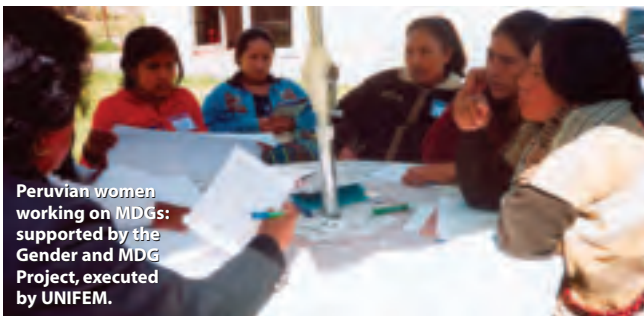
Peruvian women working on MDGs: supported by the Gender and MDG Project, executed by UNIFEM.

Enhancing women's freedom and equality must be a deliberate and consistent part of all that we do. Expanded freedoms for all, women and men, girls and boys, must be our goal – both because it is necessary for development effectiveness and because equality is a core value of the UN Charter, a value we have all pledged to protect as representatives of the UN system.