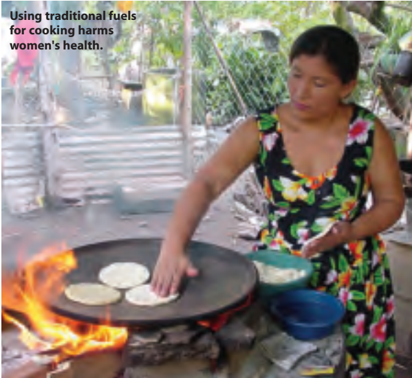
Using traditional fuels for cooking harms women's health.

Some important gender mainstreaming priorities in this area are developing more systematic strategies for bringing the voices and views of women into strategies for sustainable development, making women's expertise as farmers and herbalists as well as the role they play in biodiversity management and conservation more visible, and ensuring that women are involved in participatory resource planning. Strengthening policy and regulatory frameworks to protect and enlarge poor women's access to natural resources is also key, as is addressing larger issues of land tenure, inheritance rights and accountable, transparent local governance.