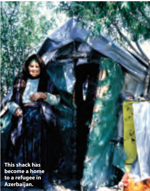
This shack has become a home to a refugee in Azerbaijan.

Violent conflicts and natural disasters can erase decades of development and further entrench poverty and inequality. Through its global network, UNDP seeks out and shares innovative approaches to crisis prevention, early warning and conflict resolution. Post-crisis, UNDP helps bridge the gap between emergency relief and long-term development.