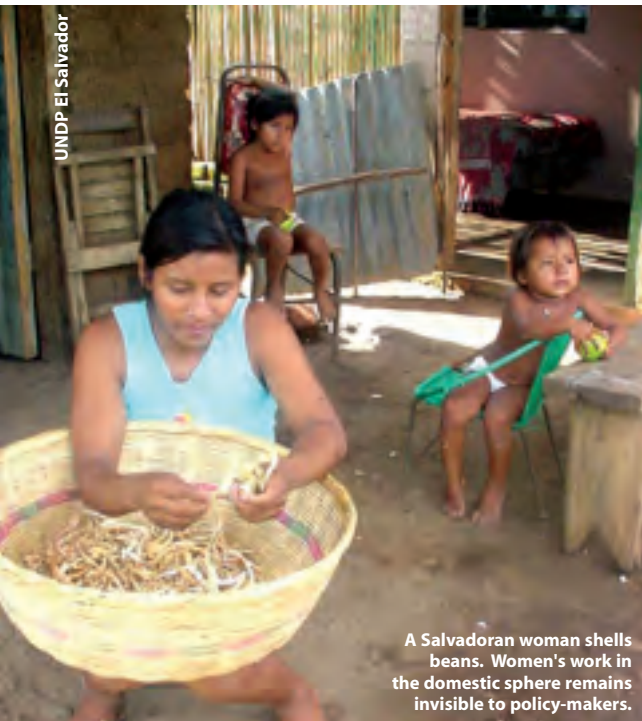
A Salvadoran woman shells beans. Women's work in the domestic sphere remains invisible to policy-makers.

Although globalization has opened up new opportunities for women to enter the labour market, particularly in manufacturing and the service sectors, the trade-off between unpaid domestic work and paid employment is not always profitable. Women often enter at the bottom of the salary scale and occupy precarious jobs with little security and few benefits.