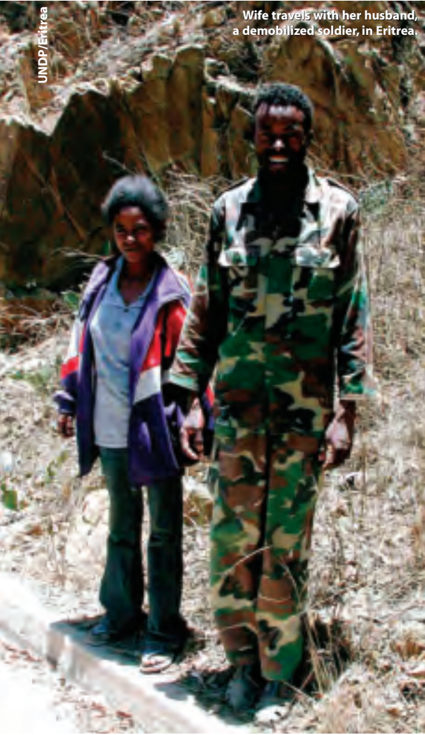
Wife travels with her husband, a demobilized soldier, in Eritrea.