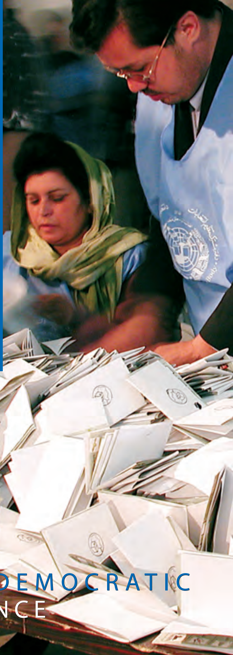
Men and women count voting ballots in Afghanistan.

5 In Yemen , UNDP has supported voter education efforts that are linked to religious instruction in order to counter claims that religion bans women from politics.