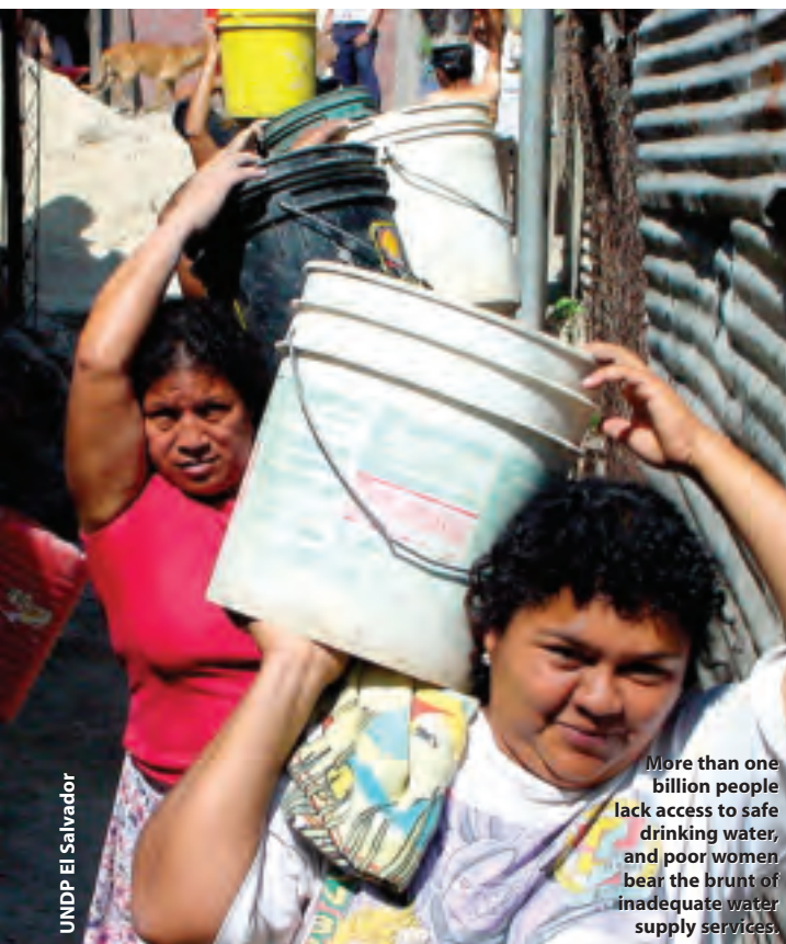
More than one billion people lack access to safe drinking water, and poor women bear the brunt of inadequate water supply services.