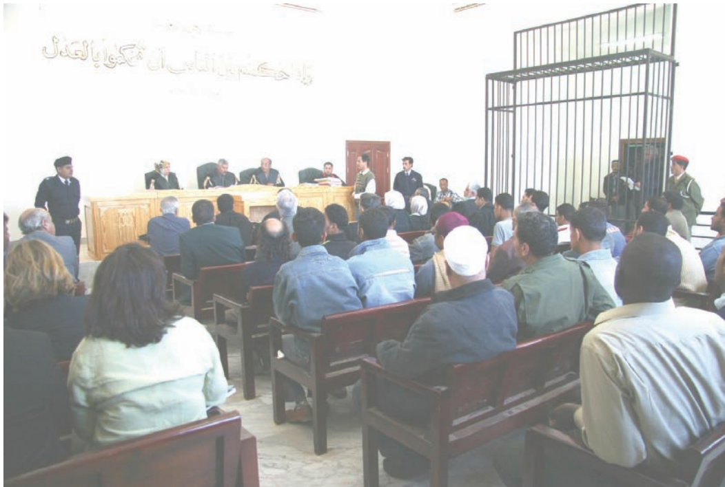
In January 2005, the General People's Congress abolished Libya's extraordinary court, the People's Court, which had heard most political and security cases and was notorious for politically motivated judgments and biased trials. Cases under the court's review at the time of its closure were transferred to regular criminal courts, like this Court of Appeals in Benghazi.

“We couldn’t even see the file in cases before the People’s Court,” one lawyer told Human Rights Watch. “The law didn’t ban us, but it was the procedures of the authorities, which were arbitrary and depended on their mood.” 34