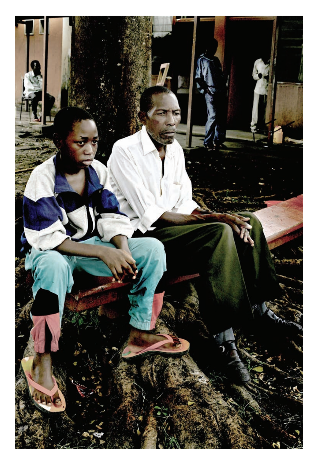
A boy detained at Roi Khaled Hospital. His father, who is a farmer and cannot pay the bill for surgery, is staying with him.