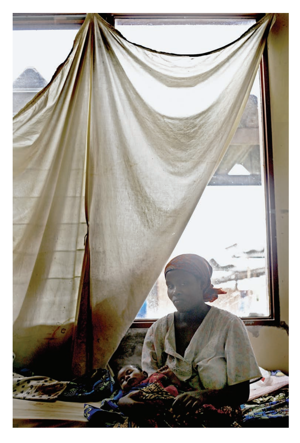
This newborn boy urgently needed surgery after birth. As the mother could not pay for it, she and the baby got detained at Roi Khaled Hospital.