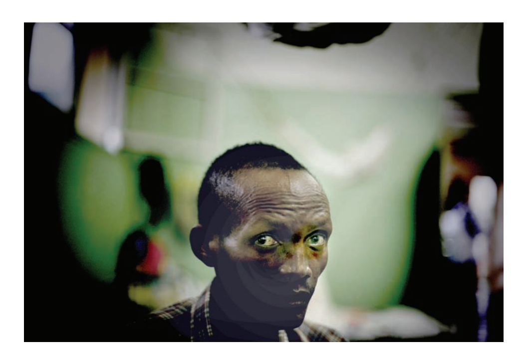
A patient detained at Prince Régent Charles Hospital.

Patients in other hospitals had similar experiences. A patient who was held for three months in Gitega Hospital complained that whenever he would leave his bed to sit in the sunshine, guards or other hospital staff would come and ask him where he was going.<sup>75</sup>