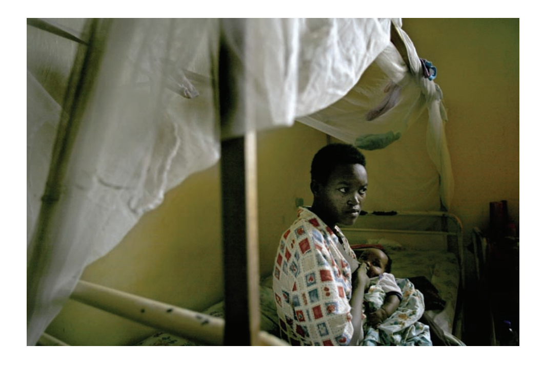
A young mother and her newborn baby, detained at Prince Louis Rwagasore Clinic following a caesarean section.

The introduction of free health care for women giving birth and children under five constitutes an important step towards improving maternal and infant health, and ending detention among patients of this vulnerable group.