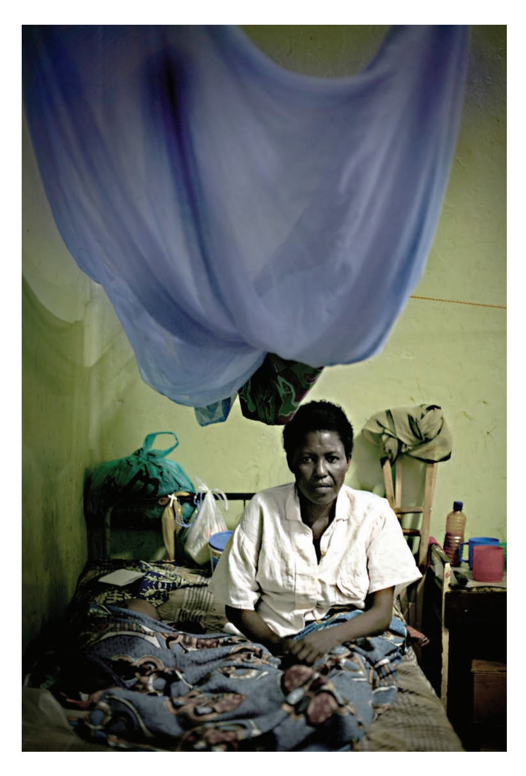
A patient detained at Prince Régent Charles Hospital.