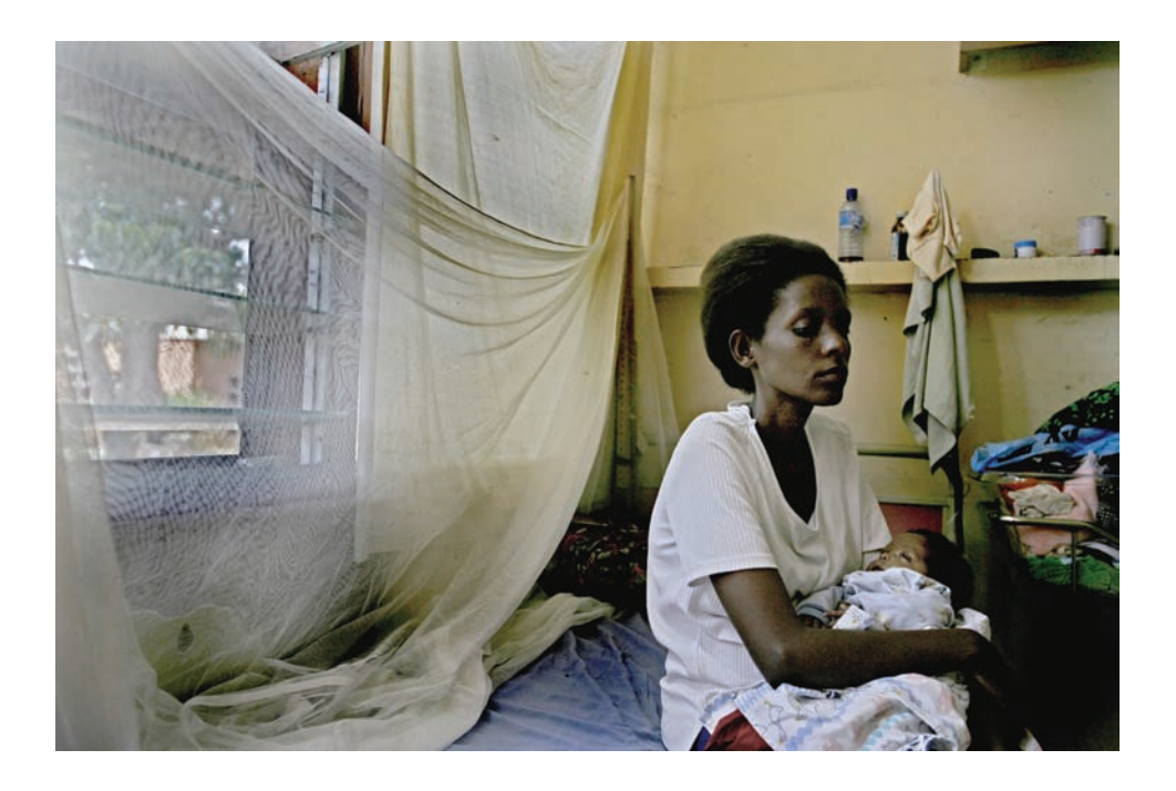
A young mother and her newborn baby, detained at Roi Khaled Hospital following a caesarean section.

I spoke with the director of the hospital and I told him that I couldn't pay. He said that I cannot leave the hospital, that I have no right to leave the hospital until I paid the bills.<sup>69</sup>