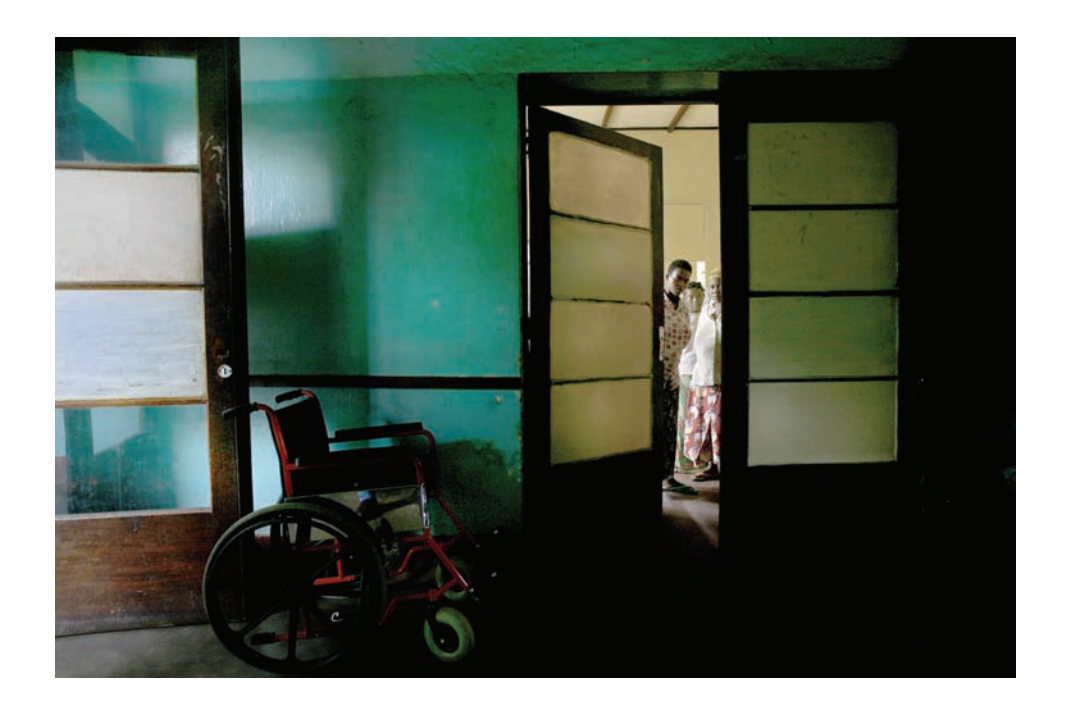
At Prince Louis Rwagasore Clinic, detainees are held in a separate room with a guard at the door. At the time of our visit, the room held about twenty people. The sanitary conditions in the room were deplorable: there was a filthy toilet and a shower, and they could not be used in private because they belonged to the room. One person who had been held for a month, said: "After I got the bill I was directly taken here and told 'Stay here. When you have money or there is a benefactor, you can leave."

According to those guarding the room, most detainees were women who had had birth complications. Many were held until the babies were able to hold up their heads, meaning two or three months. When patients left without paying, the guards sometimes followed them home.<sup>82</sup>