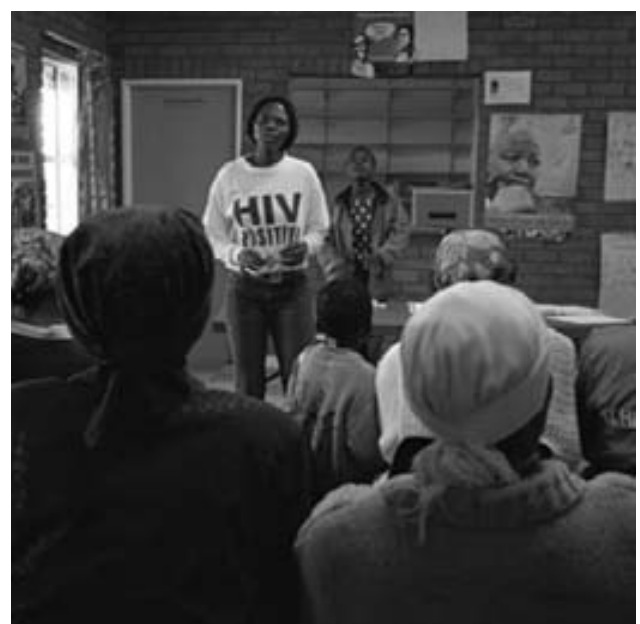
Lusikisiki, South Africa

Although overall supply of health care workers in South Africa is not an acute problem, unequal distribution between the private and public sectors and between urban and rural areas - due to low salaries and poor working conditions - combines with the overwhelming need for treatment to create a crisis.