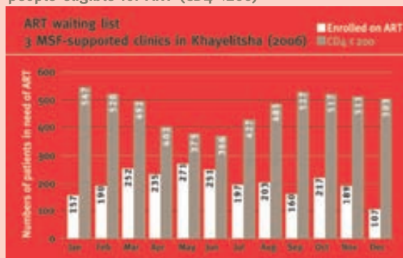
Number of people initiated on ART vs. number of people eligible for ART (CD4 <200)

But solutions to the staffing problem do not seem imminent. According to Western Cape authorities, 466 clinical nurse practitioners (the most skilled category of nurse) are needed for basic health services by 2010, but only 71 (15%) are currently employed. 14 The number of professional nurses must double from 340 currently employed to 689.