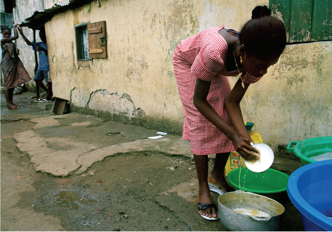
Domestic girl worker washes dishes for her host family before she goes to primary school in Conakry.

As mentioned, fetching water has particular hazards. Girls are often overburdened with the weight of heavy containers or buckets. For example, nine-year-old Rosalie Y. told us that she had to carry containers with 20 liters of water every day; she complained this is “too much.” 120 Others also complained that they had to carry 15 or 20 liters of water a day. The impact of heavy weight on children’s growth is known; it may lead to skeletal deformation of the back and neck and accelerate the deterioration of the joints. 121 In fact, the ILO specifically defines carrying heavy loads as a worst form of child labor. 122 Another problem is that water is often only available in the early morning hours, so that girls have to walk deserted paths in the night and are exposed to the