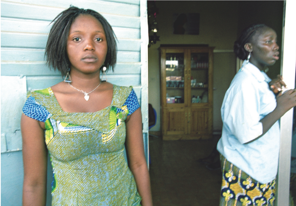
Eighteen-year-old former domestic worker.