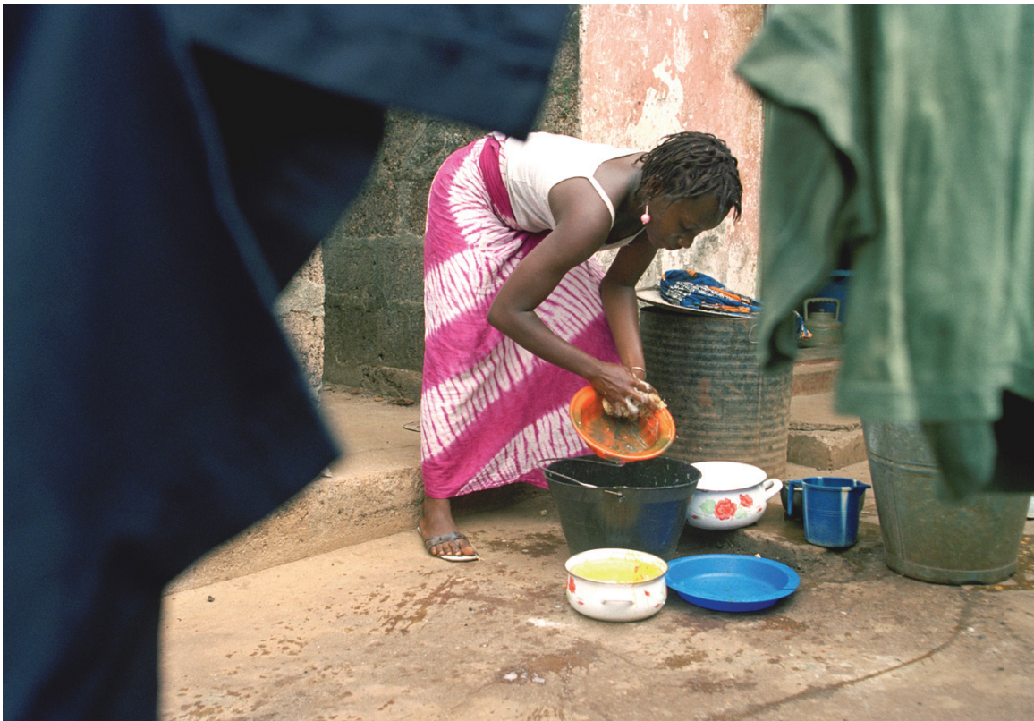
Girl domestic worker in Conakry.

I came two years ago. The tutrice is a teacher. My mother gave me to the woman. They are not part of the family. The woman's younger sister had come to Lola to find a domestic worker, and she took me back with her to Conakry. The mother of the lady [tutrice] is from Lola as well. My parents are farmers. I am not sure why my mom sent me here.... Sometimes my mum writes to me. My tutrice buys things and sends them to my parents. For example she sends shoes or clothes. She does that every month and explains that herself to me. She has never given me a salary. 61