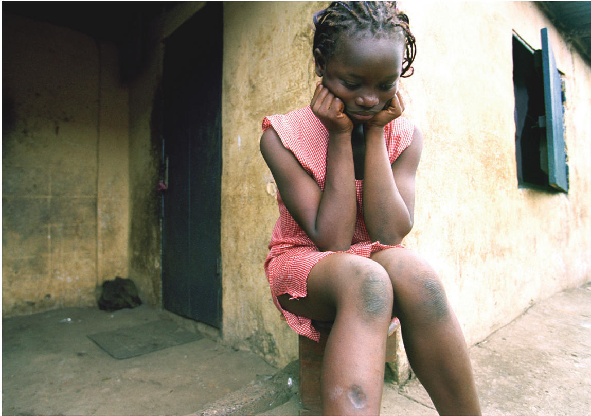
A Sierra Leonean girl who was sent as domestic worker to Conakry to escape the war in her home country. A local NGO helped her find a foster family and enrolled her in primary school.

beaten badly and my mother came and picked me up. I had injuries and my mother saw them. 158