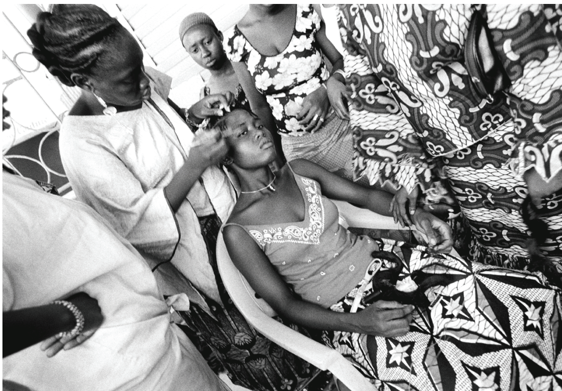
A former domestic worker having her hair braided by other former domestic workers learning to become hairdressers at a training centre run by a Guinean NGO, AGUIAS (Association Guinéennes des Assistantes Sociales).

Various agencies run programs on women's rights issues to strengthen the social position of women and girls and help to prevent violence against them. These programs are of great importance for girl domestic workers who are particularly vulnerable to abuse. For example, the Guinean National Coalition for women's rights and citizenship (Coalition nationale de Guinée pour les droits et la citoyenneté des femmes, CONAG-DCF) documents violence against women, assists women in prison, and carries out awareness-raising activities on early marriage and other girls' rights concerns. 258 In addition, several agencies have programs that provide rapid intervention services, social assistance and rehabilitation services for victims of sexual abuse, and medical treatment. AGUIAS has also recently opened a safe house for women and girls who are victims of sexual or physical abuse, and it has a hotline