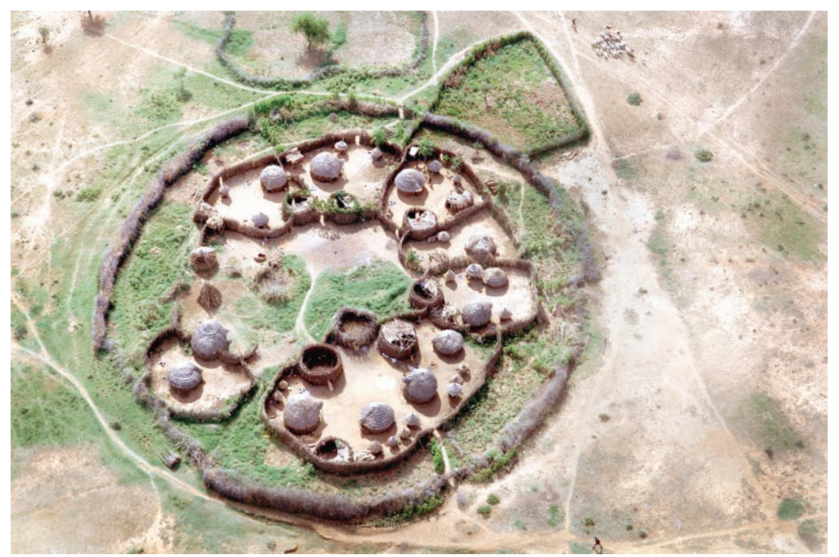
During a typical cordon and search operation, government soldiers surround a manyatta —a traditional homestead like this one (shown here from above)—in the early hours of the morning, detaining residents outside while their houses are searched for weapons.

Migration is a key element in this strategy, allowing for the movement of herds between pasture areas in response to environmental pressures. During the rainy season, herds are grazed near to permanent homesteads or manyattas , with cattle camps or kraals moving out to distant grazing lands during the dry season. Men, women, children, and the elderly are present at both manyattas and kraals , resulting in a "constant flow of people, information, and livestock."