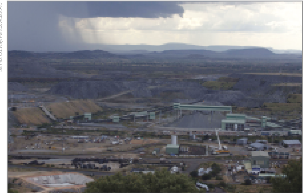
The PPL mine.