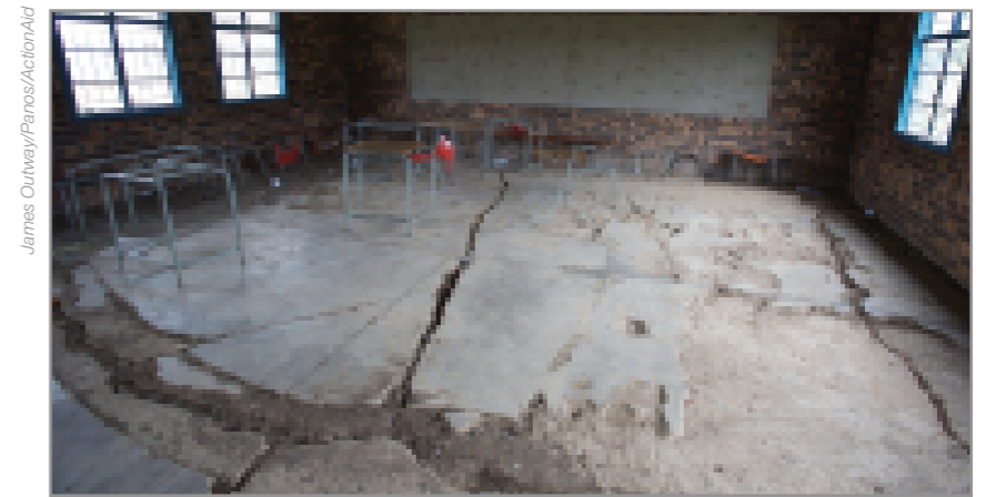
Marole secondary school in Maandagshoek.

and looking as if they could collapse at any moment. "People's lives are at risk here," Charles added.