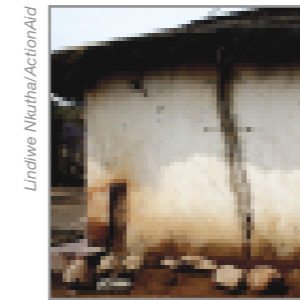
House with cracks. Ga-Molekane.

The average food bill for a family is now around R6,000 (£428) more each year