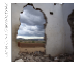
A demolished house near Ga-Puka.

The mine’s right to conduct operations on the Sandsloot farm derives from a mining right issued to it by the Department of Minerals and Energy. But the lease agreement allowing the company to occupy the farm, and indeed the relocation agreement to move the villagers from Ga-Pila to Sterkwater, have never been seen by the community. Villagers did not know by what right the company was able to occupy the Sandsloot farm, relocate the villagers and destroy much of the village. ActionAid’s information is that at the time of the relocation the community believed that Anglo Platinum had a right granted by the state to carry out mining operations in Ga-Pila village and that they had no choice other than to relocate (see box 5). 30