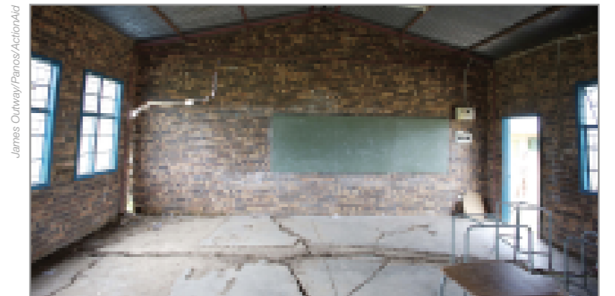
Marole secondary school in Maandagshoek.