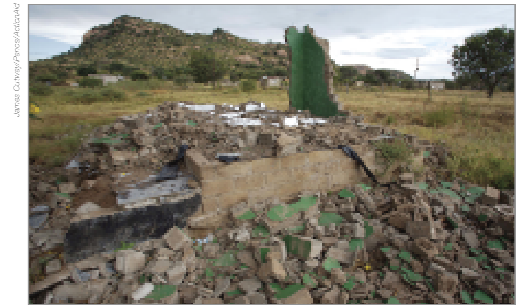
One of the demolished houses in Ga-Puka from where many people have been relocated. The mine wants to use the land as a dump.