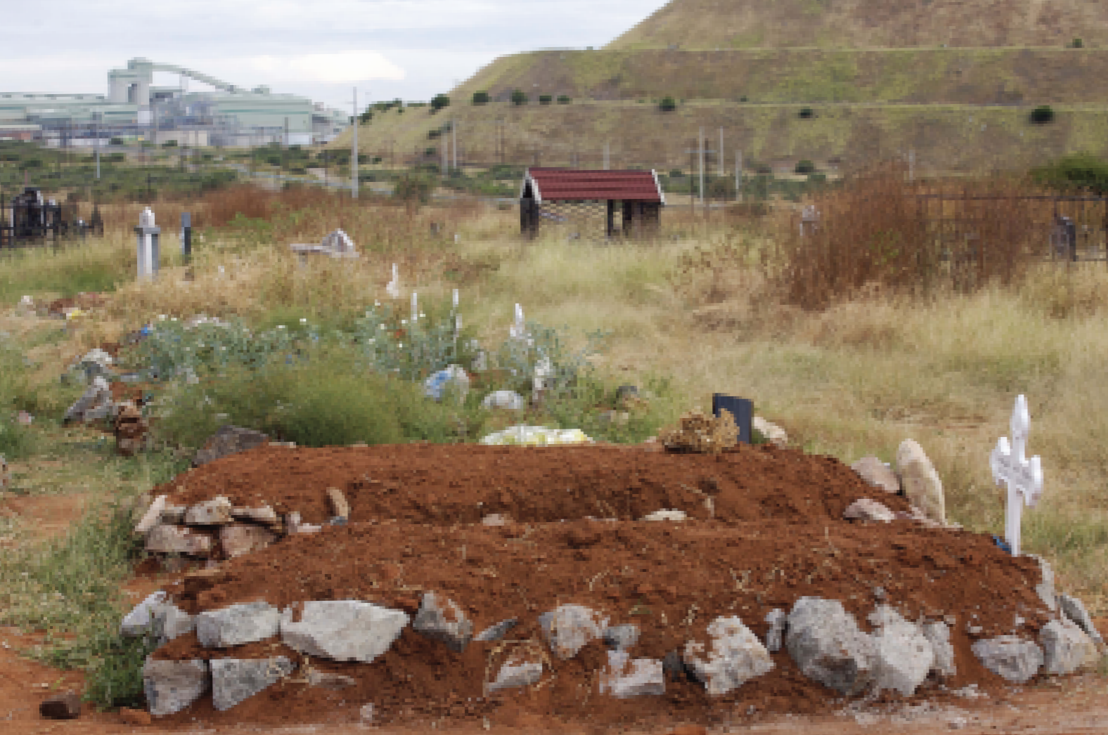
Graves have been relocated to make way for the mine at Ga-Pila village