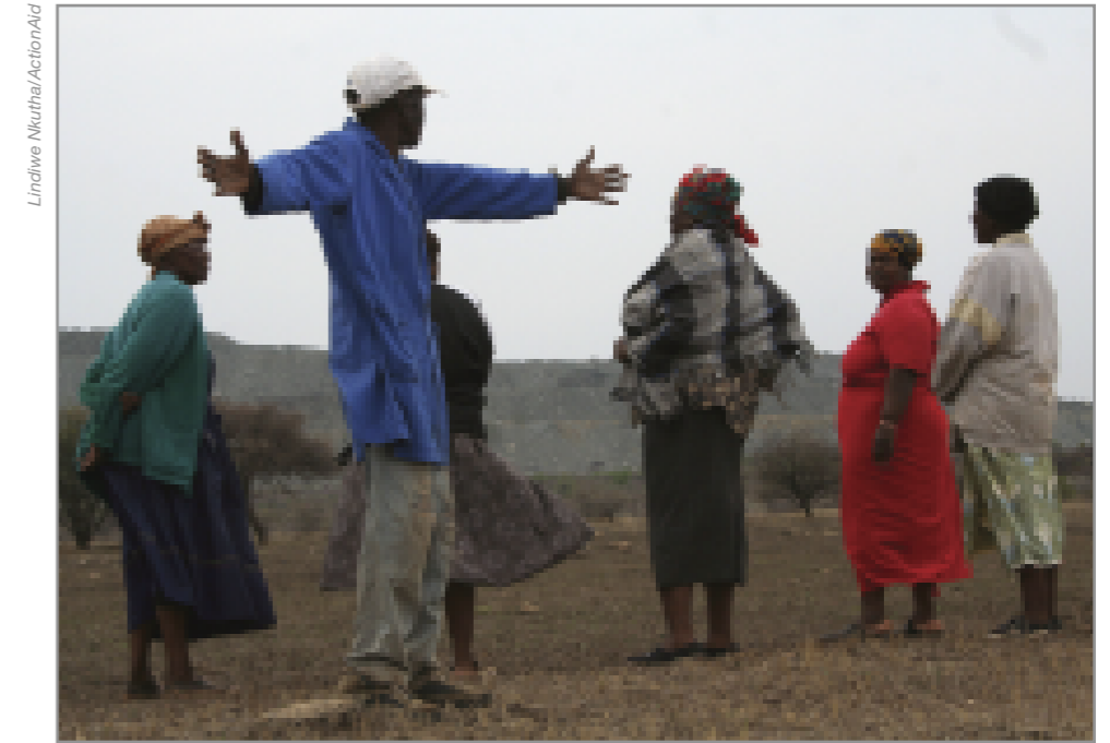
Ga-Pila residents looking at mining waste.

R5,000 per family compensation was a tiny sum