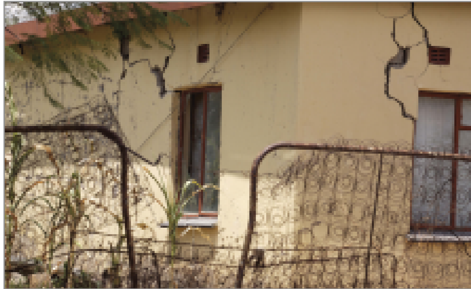
Cracks have appeared on some of the houses in Ga-Pila village.