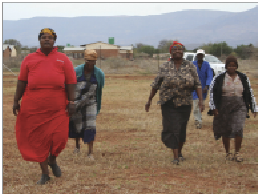
Women of the Limpopo without farmland.

Women and especially female-headed households, of which there are many in Limpopo, derive their independence from men from their ability to farm and often to earn an income from selling their surplus. Loss of land due to mining means loss of income and means of independence. In turn, this can directly affect the nutrition status of children, and thus children's education.