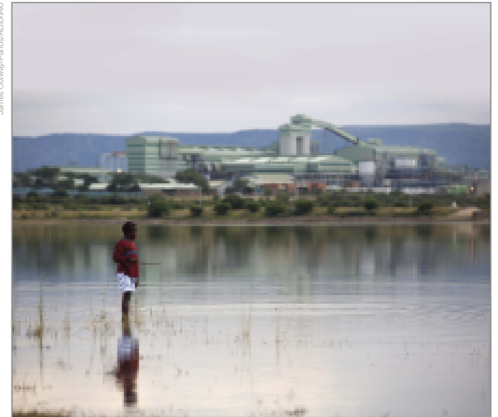
A boy fishes in Ga-Molekane village, near the PPL mine.