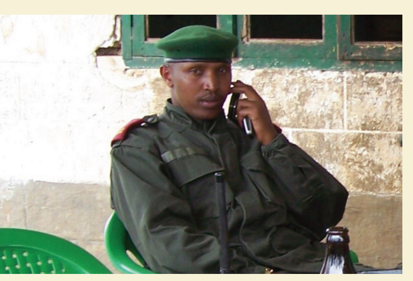
Bosco Ntaganda: Nkunda's chief of staff and indicted war criminal.

What happened next is a chilling example of what war means for civilians in eastern Congo. The CNDP ordered the town's population of roughly 30,000 to leave. However, as the population fled, many men were not allowed to cross roadblocks and were forced to return to Kiwanja. Then on November 5, in what is perceived as retaliation for its losses, the CNDP allegedly sought out and killed civilians, particularly young men who it accused of being members of or providing support to the Mai Mai militias. It remains unclear as to how many civilians were executed by the CNDP or caught in the cross-fire, and the CNDP officially denies deliberate attacks against civilians. When confronted by the Enough Project, one CNDP major stated, "Killing civilians is not in our vision." At least 50 civilians were killed on November 4 and 5, and perhaps scores more.