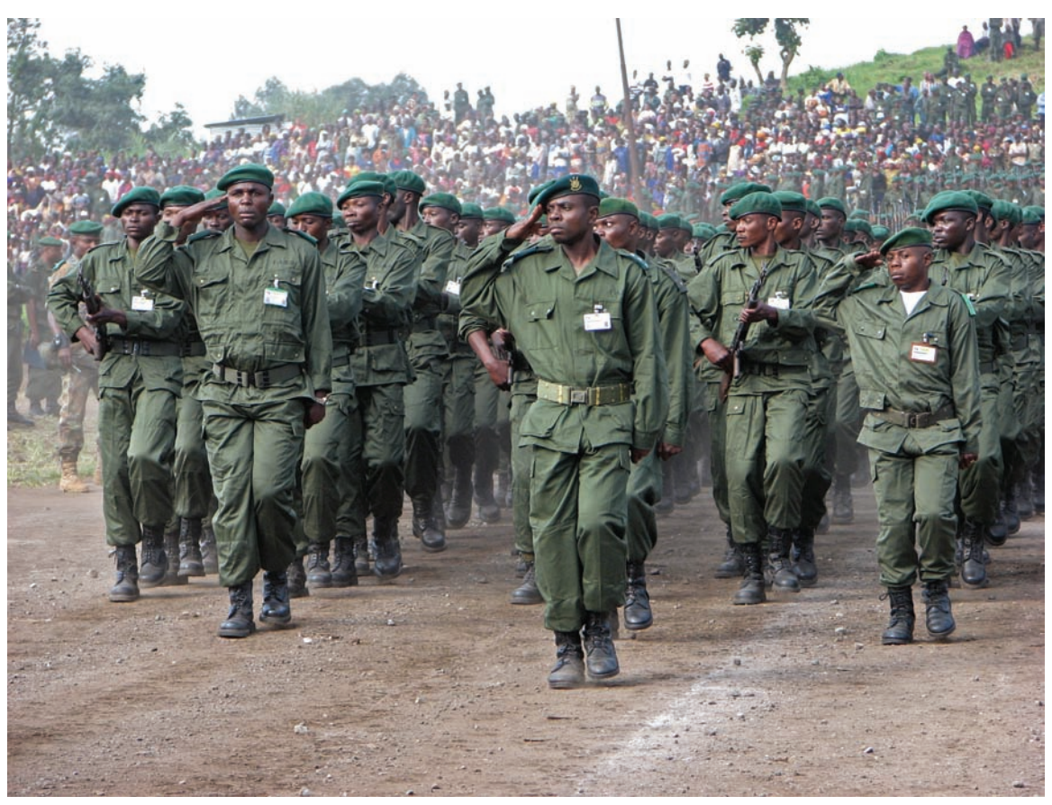
Soldiers of the then-newly integrated 14th Brigade of the FARDC at their unit's passing-out parade at the Rumangabo military base in North Kivu on September 15, 2006. Human Rights Watch does not intend or make any representation that the soldiers depicted in the above photo are responsible for the crimes discussed in this report.

of command. In the words of one disillusioned former 14<sup>th</sup> brigade member, Colonel Rugayi "put his own people in positions of power."<sup>49</sup>