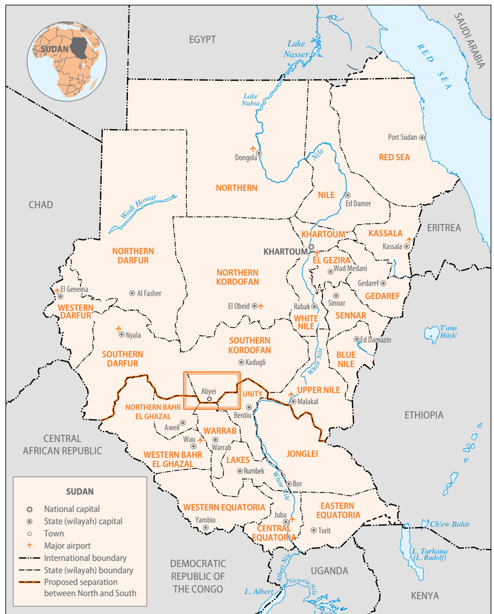
The boundaries and names shown and the designations used on this map do not imply official endorsement or acceptance by the United Nations.

See map on the following page for more detail on the highlighted box below.