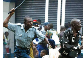
DIAMONDS AND CLUBS: The Militarized Control of Diamonds and Power in Zimbabwe

Zimbabwe’s mockery of the Kimberley Process should not be tolerated any longer. If the KP is to maintain any shred of credibility it must take bold and decisive action to defend its founding principles. The situation demands a more effective remedy than what has already been tried — one that has to start by also addressing the shortcomings and loopholes of the KP itself that have been identified in the decade since the KP was first negotiated. 53