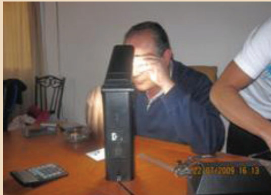
A Lebanese buyer inspecting Chiadzwa diamonds in Vila de Manica, Mozambique.

Instead he refers us to "Hussein", a 50-something Middle-Eastern man living in a newly built house removed from the main cluster of dealers. A new compact Hummer with Zimbabwean license plates is parked in the driveway. We are met by a burly bodyguard, and ushered toward a leather couch in his office.