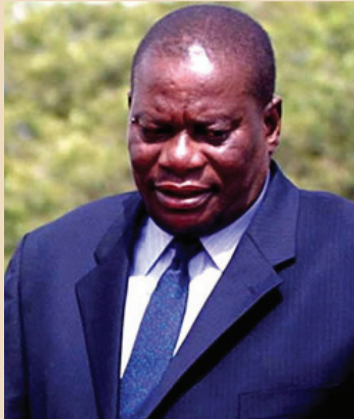
General Solomon Mujuru (Retd.)