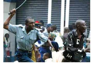
DIAMONDS AND CLUBS: The Militarized Control of Diamonds and Power in Zimbabwe

If the Kimberley Process is unable to come to grips with the challenges posed by Zimbabwe's blood diamonds, other bodies should fill the leadership void. Left unchecked, these diamonds are likely to become a source of growing social instability that could engulf the wider Southern African region. The United Nations Security Council should place an immediate embargo on Zimbabwean diamonds until such time as there is legitimate and competent governance of the country's diamond resources.