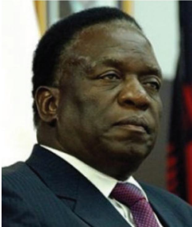
Emmerson Mnangagwa, Minister of Defence

But altruistic pretences were quickly shelved when it was discovered that Harare's intervention, like that of other countries, was motivated more by a desire to enrich itself on Congo's rich natural resources.