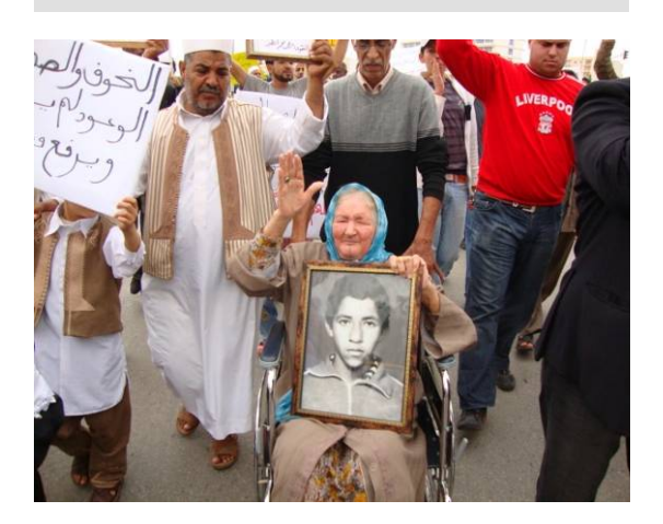
Families of victims of Abu Salim Prison killings protest in Benghazi.

However, public meetings and demonstrations are generally tolerated only when the participants