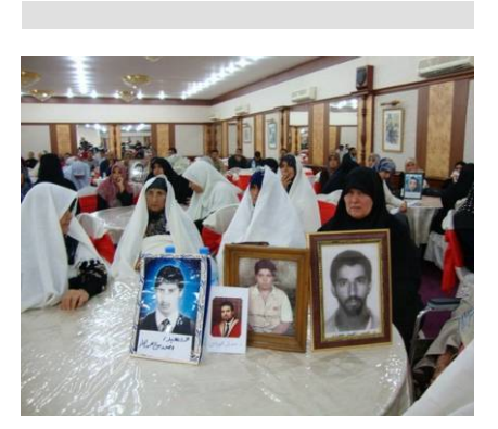
Families of victims of the Abu Salim Prison killings attend meeting organized by the GDF, November 2009

Far from responding to the families' legitimate demands, the Libyan authorities have sought to silence them and to limit the information available publicly about their struggle. Footage of these families holding protests, recounting violations suffered and listening to speeches by spokespersons is available on YouTube and a number of websites administered from abroad, including AI Manara and Libya AI MostakbaI . Unfortunately, these were not accessible to Libyans between January and end-March 2010, since the Libyan authorities blocked the websites.<sup>168</sup>