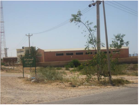
Misratah Detention Centre view from the inside [top] Mistratah Detention Centre, view from the outside [bottom]