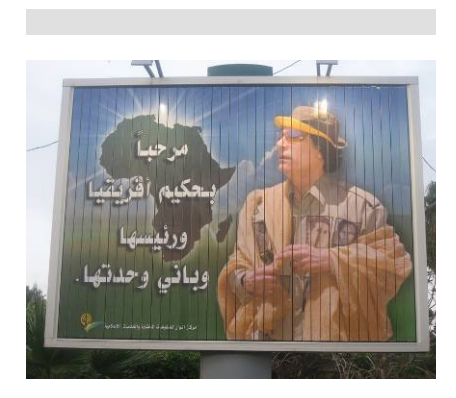
Poster of Libyan leader Mu'ammar al-Gaddafi in Tripoli

In November 2008, negotiations started with the EU over a Framework Agreement covering issues such as economic co-operation and migration policy. The negotiations had not concluded at the time of writing. According to statements by EU representatives, the next round of negotiations was scheduled for June 2010 with the view of signing the agreement by the end of 2010.<sup>45</sup> Individual members of the EU have also sought Libya's cooperation in preventing migrants from reaching European shores from Africa. During the visit of Italian Prime Minister Silvio Berlusconi to Libya in August 2008, Libya signed a Treaty of Friendship, Partnership and Cooperation with Italy addressing a range of issues, including bilateral efforts to combat "illegal migration". This treaty was preceded by two technical agreements on joint patrolling of the seas.<sup>46</sup>