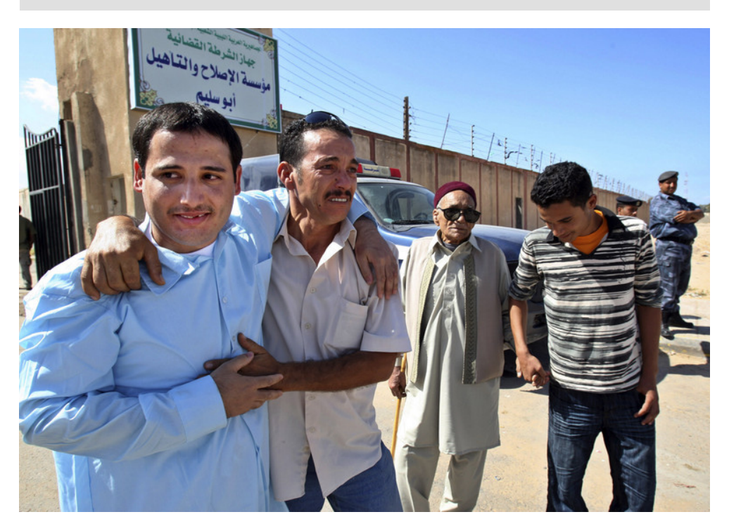
Releases of individuals suspected of involvement in terrorism-related activities from Abu Salim Prison in October, 2009.

In recent years, there have been a number of positive developments in the field of human rights. Since 2001 significant numbers of political prisoners have been released, many of whom had been detained arbitrarily. In 2001, nearly 300 prisoners, among them political prisoners, were released. In 2002, more than 60 political prisoners were released, including prisoners of conscience. In 2005, members of the Islamic Alliance Movement were released, some of whom had been held since 1998. The following year, 130 individuals were released including 85 members of the Muslim Brothers, many of them held since 1998.<sup>30</sup> In the past two years, the Libyan authorities have released at least 15 prisoners of conscience held for expressing views critical of the authorities or for seeking to organize public protests.