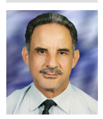
Jamal el-Haji

Fathi el-Jahmi's fate for daring to criticize the Libyan leader and call for democratization serves as a warning to all those wishing to peacefully urge reform.