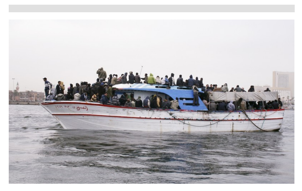
Individuals rescued at sea arrive at Tripoli, Libya, March 2009

Libyan authorities make little efforts to distinguish between individuals in need of international protection and other migrants, and they brush off concerns raised regarding the dire situation of some foreign nationals in Libya. Instead, they argue that Libya is caught between pressures from Europe to reduce the tide of migration and difficulties in controlling Libya's long and porous land borders.