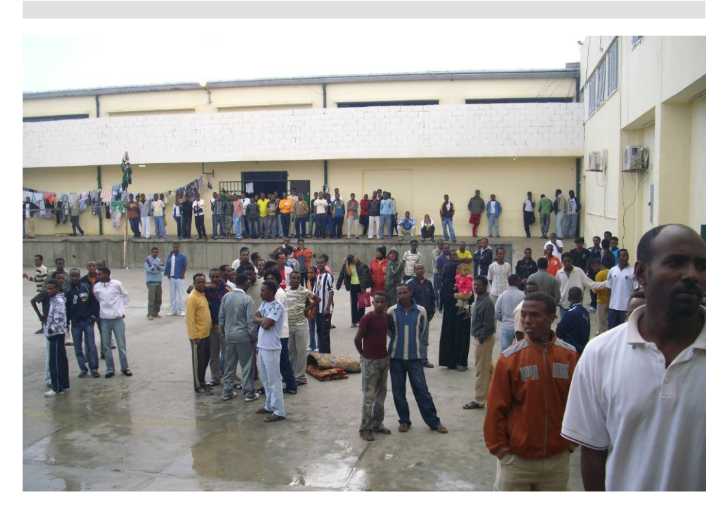
Misratah Detention Centre

Compared to other detention centres in Libya, Misratah is relatively open to external scrutiny. In addition to the UNHCR and its partner organization IOPCR, since 2007 Misratah has been visited by journalists, both Libyan and foreign, as well as priests who conduct religious services for the detainees.