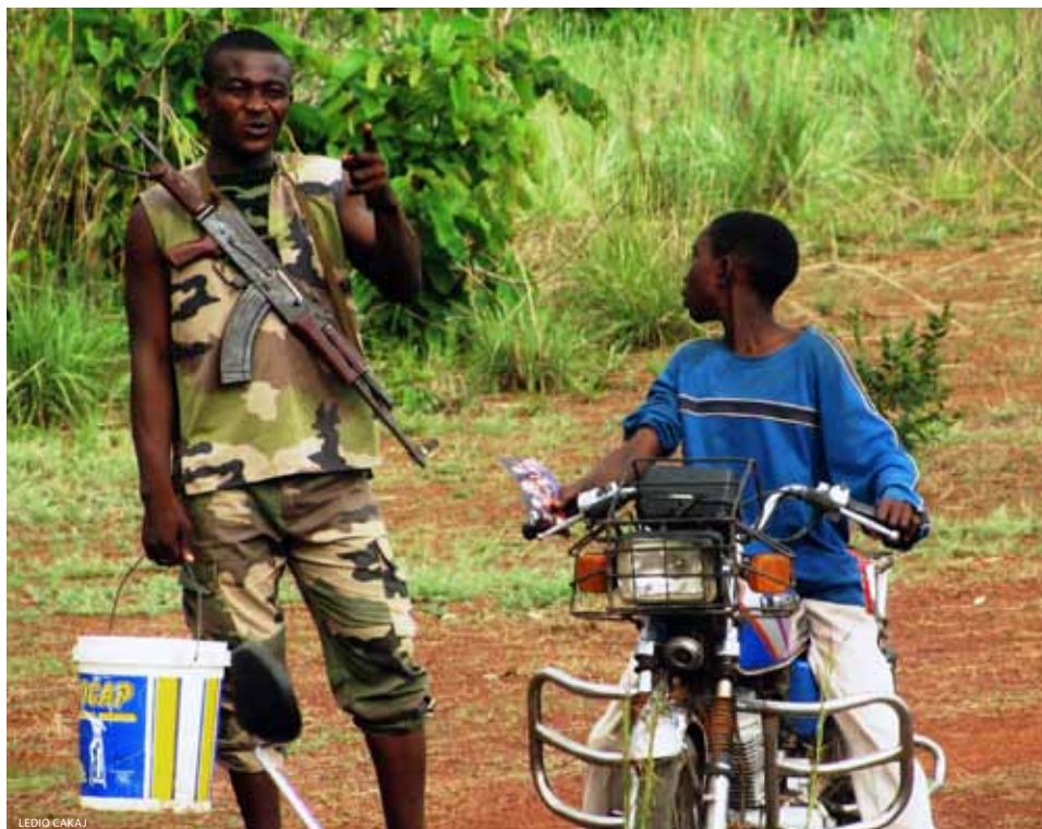
A CAR army soldier and a boy on a motorbike. The CAR armed forces are few in number in LRA-affected areas, and unable to protect civilians effectively.

The CAR armed forces are traditionally weak and often divided. The Forces of the Central African Republic, or FACA, numbers only around 5,000 personnel, although the number of soldiers on duty at any time is a fraction of that. These forces rarely stray from the capital, are paid infrequently, and have a miserable human rights record.