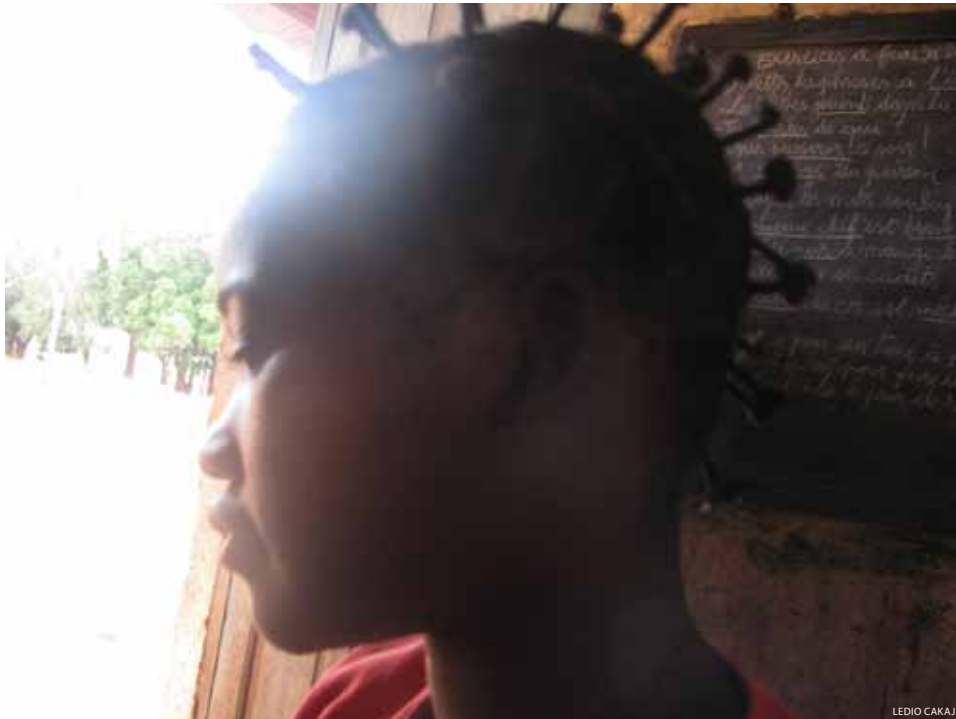
This girl was abducted by the LRA from Djemah in October 2009, but later escaped and returned home.

Kony’s group moved north toward Djemah. Located on the southern tip of a huge forested area called the Zemongo Reserve, Djemah is split in two by Ouara River, the neighborhood of Fouka in the north, and the rest of Djemah in the south. One team from