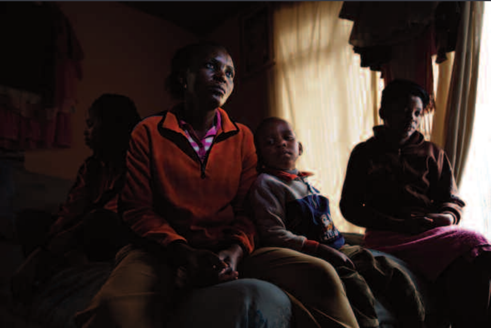
A Zimbabwean refugee sits with her children in South Africa. Police killed her husband, an MDC organizer, during a peaceful protest march in Zimbabwe in 2007.