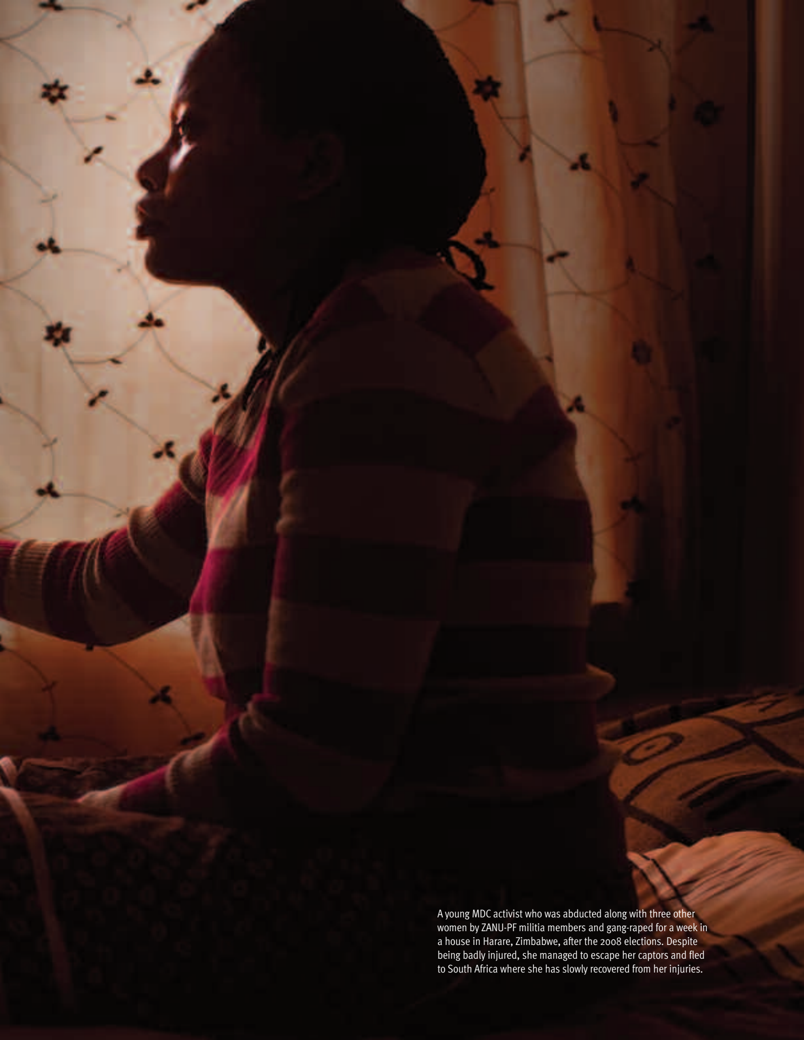
A young MDC activist who was abducted along with three other women by ZANU-PF militia members and gang-raped for a week in a house in Harare, Zimbabwe, after the 2008 elections. Despite being badly injured, she managed to escape her captors and fled to South Africa where she has slowly recovered from her injuries.