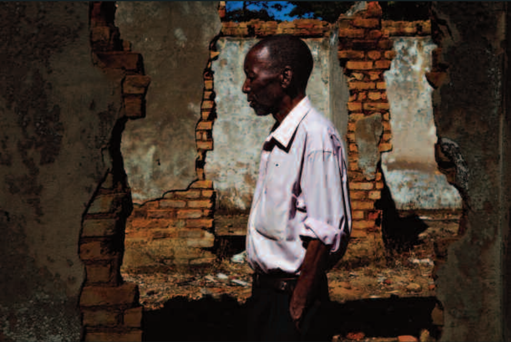
An elderly man stands in the ruins of his home in Zimbabwe, torched by ZANU-PF militias.