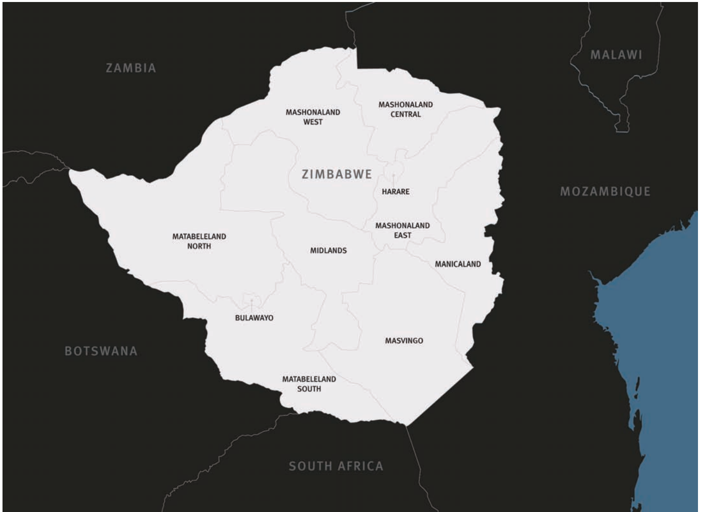
Map of Zimbabwe © 2011 Human Rights Watch