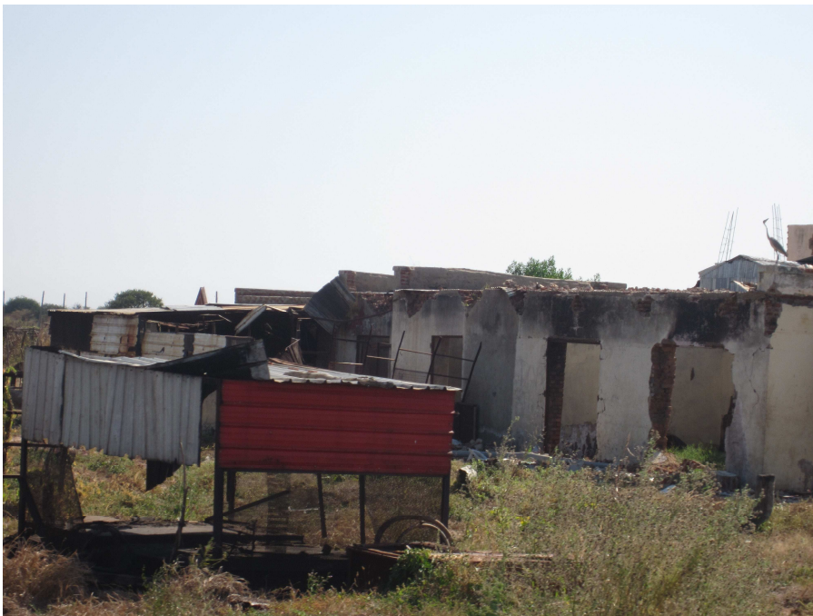
Looted and burned buildings in Abyei town, 26 November 2011.