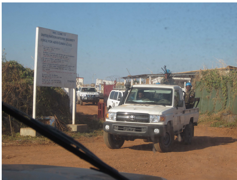
UNISFA peacekeepers in Abyei, 26 November 2011.

In November 2011 the UN Secretary-General expressed concern that “despite engagement with the Governments of the Sudan and South Sudan by UNISFA, neither party has provided maps of mine locations.” 19 In mid November the SPLA dispatched a demining team to show UNISFA its likely mined areas but, according to information provided to Amnesty International by UN personnel, the information they provided was very limited and mostly not sufficiently precise.