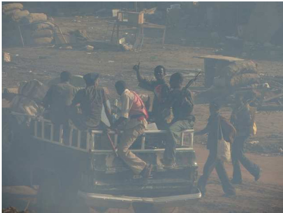
Armed militias in Abyei, 23 May 2011.

During and after the confrontations SAF and Misseriya militias killed civilians, looted and burned to the ground homes and properties.