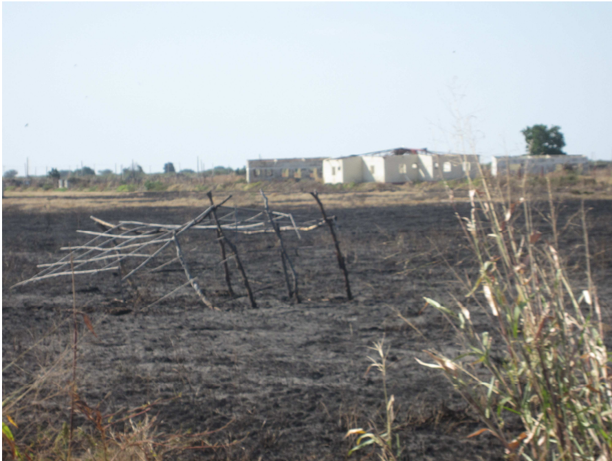
Tukuls burned down in Abyei town, 26 November 2011.