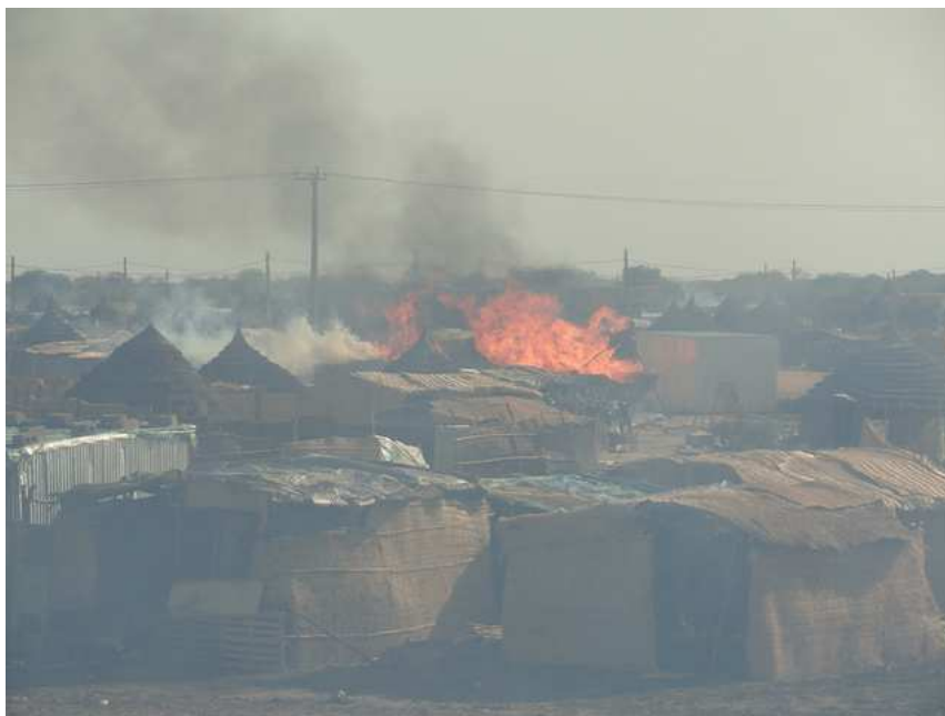
Homes burning in Abyei, 23 May 2011.

Armed confrontations spread involving SAF, Popular Defence Forces (PDF) 3 and SAF-backed armed militias from the nomad Arab Misseriya community on one side, and members of the SPLA and SSPS and some armed Dinka Ngok youths on the other side. The confrontations and attacks caused the flight en masse of the Dinka Ngok population. 4 At the same time the Government of Sudan unilaterally dissolved the Abyei Administration. 5