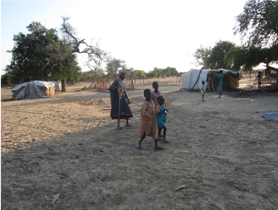
Displaced Abyei residents in Malual Achot camp, 23 November 2011.

More than six months after the May 2011 clashes the displaced Abyei residents are still living in dire conditions in hastily set-up camps or crowding in with relatives in host communities who have little or nothing to share. They are dependent on international humanitarian organizations for shelter, food, water and health care.