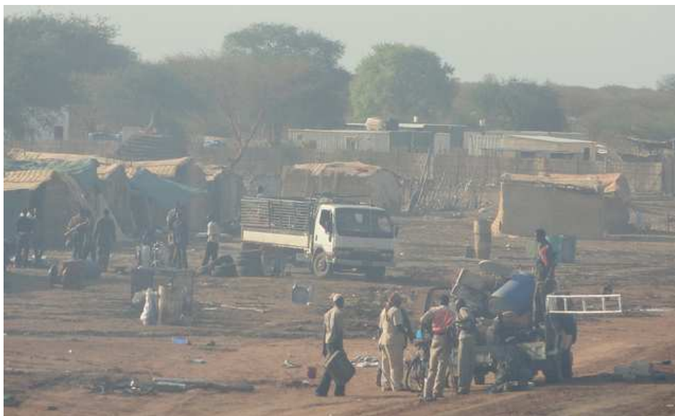
Looters in Abyei, 23 May 2011.

Former UNMIS staff told Amnesty International that on 21 May SAF overran Abyei town with T-55 tanks and multiple-rocket launchers and that five artillery shells landed in the UNMIS compound, injuring two Egyptian peacekeepers and destroying a UN vehicle. SAF looted the World Food Programme (WFP) warehouse, bringing in heavy trucks to remove two UN Development Programme (UNDP) generators and the food. UNMIS asked for the food to be returned but the SAF commander said he had instructions to distribute the food to Misseriya leaders.