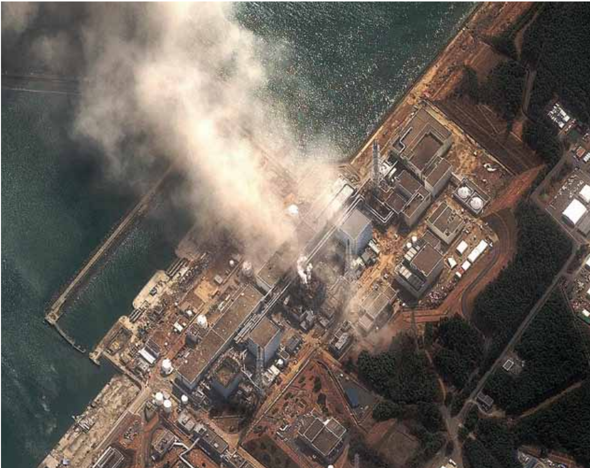
Image A satellite image shows damage at the Fukushima nuclear power plant. The damage was triggered by the offshore earthquake that occurred on 11 March 2011.

For example, even when the problems, weaknesses and scandals of TEPCO came to the surface, regulators never enforced sufficiently strong measures to avoid the same things from happening again and again. On occasions when regulators finally requested certain modifications, they allowed many years to go by before these were implemented. This is exactly what proved to be fatal in Japan in 2011.