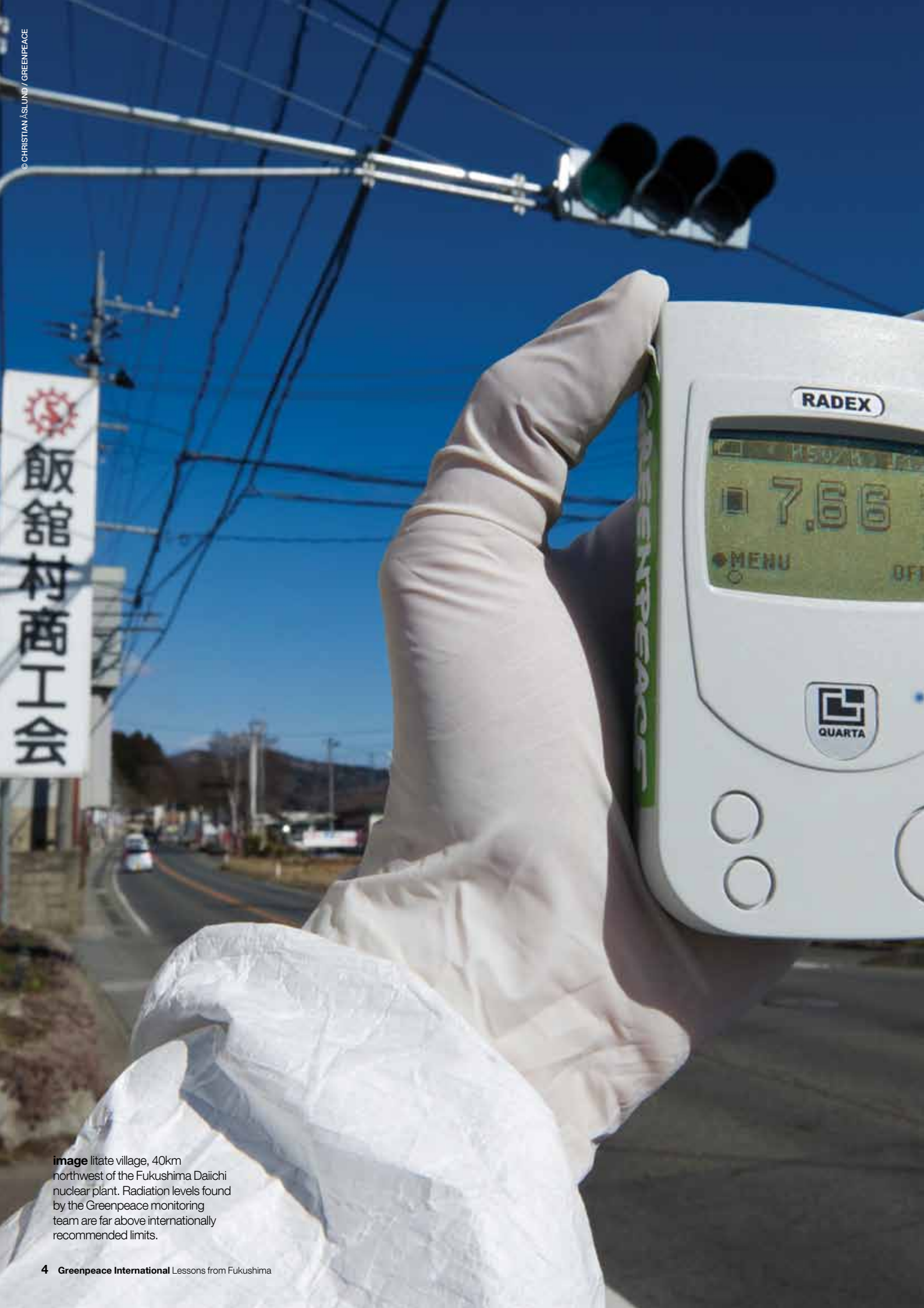
image Iitate village, 40km northwest of the Fukushima Daiichi nuclear plant. Radiation levels found by the Greenpeace monitoring team are far above internationally recommended limits.