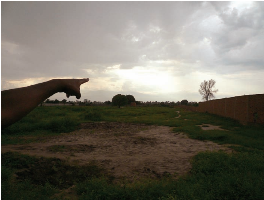
Landscape near Gihanga, Bubanza province, pointing towards the Rukoko forest where armed groups are believed to be based.