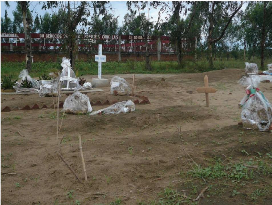
Graves of victims of the September 18, 2011 Gatumba attack in the foreground, and memorial to the victims of the 2004 Gatumba attack in the background.