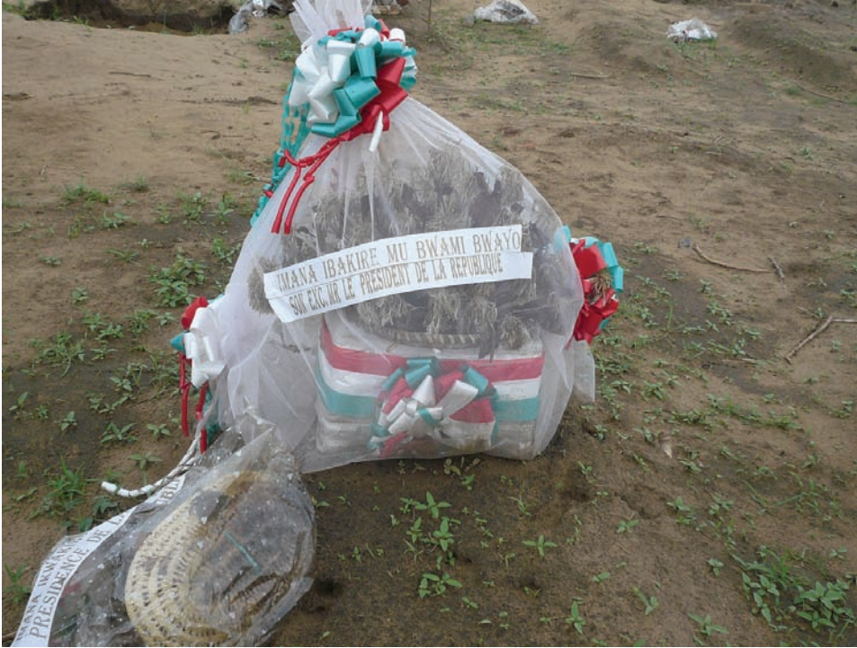
Flowers from President Nkurunziza at the graves of victims of the September 18, 2011 Gatumba attack.