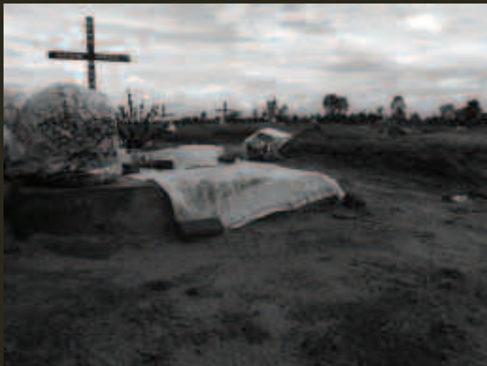
Graves of victims of the September 18, 2011 Gatumba attack.

Human Rights Watch calls on the Burundian government to take prompt measures to ensure that those responsible for political killings are brought to justice – whatever their political affiliation or status – and to prevent further killings, including by its own security forces and supporters. Leaders of opposition parties and groups should also take immediate action to dissuade their members from attacking opponents and state publicly that involvement in such activities is incompatible with membership of the party or group. Foreign governments and United Nations bodies should maintain pressure on all sides to prevent further killings and call on them to hold their supporters to account.