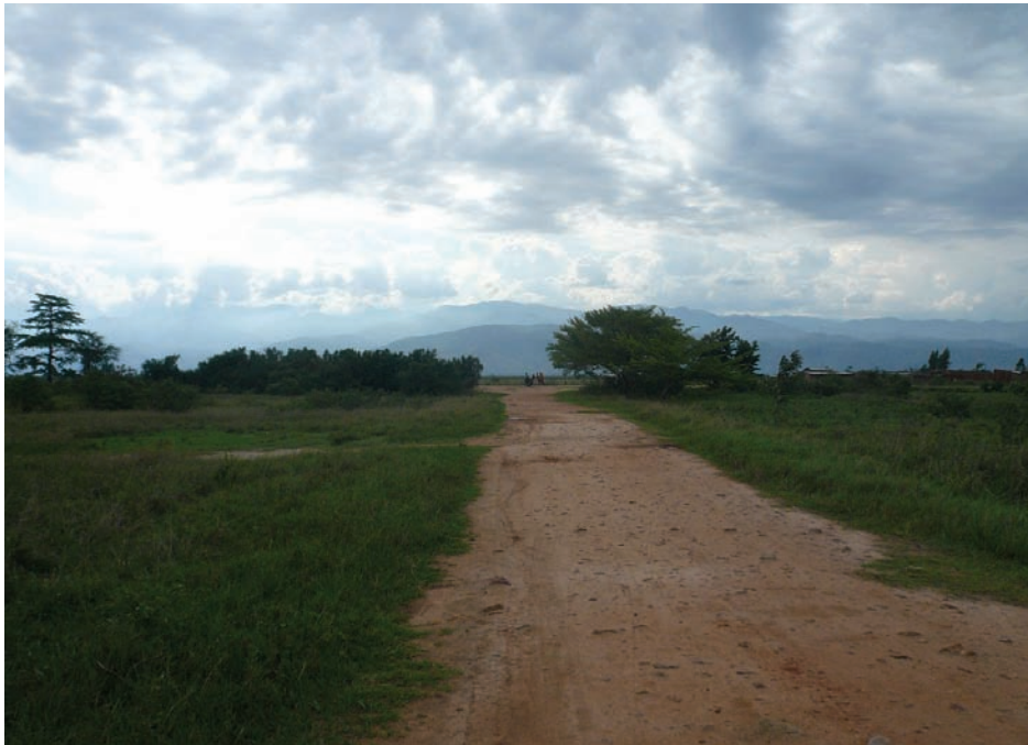
Road near Gatumba, with the mountains of Congo in the distance.

commander of the Mobile Rapid Intervention Group ( Groupement mobile d'intervention rapide , GMIR). 171 In court, Nzarabu and some of his co-defendants cited not only Ndirakobuca and Uwamahoro, but other senior figures, including the SNR official known as Kazungu, 172 as allegedly involved in events preceding the attack. 173 A resident of Gatumba told Human Rights Watch that Uwamahoro was at the scene soon after the attack and claimed to have talked to him there. 174 The presence of these officials in Gatumba on September 2011 does not in itself constitute evidence of involvement in the attack, nor in the events that led up to it.