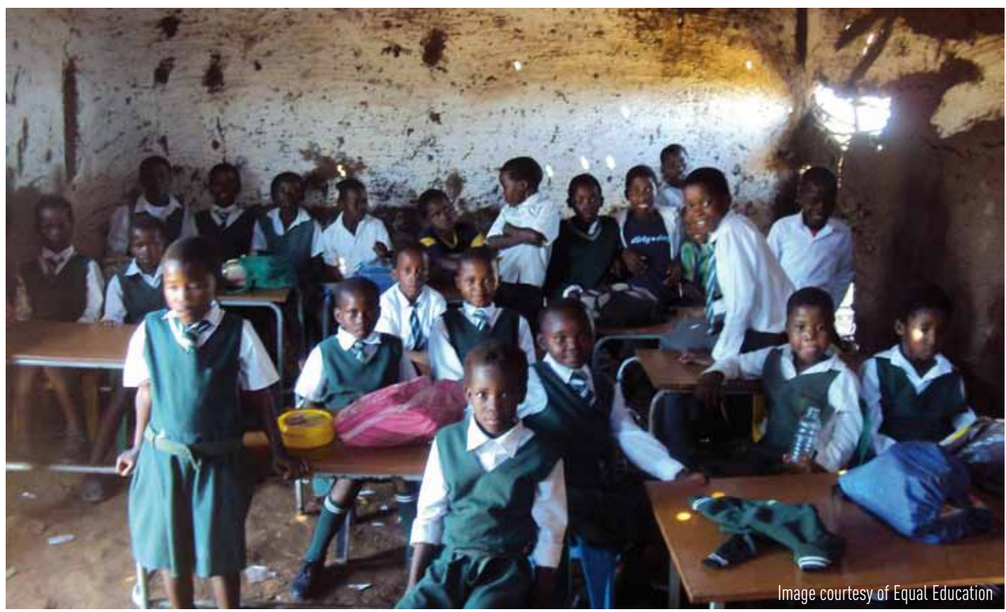
BROKEN - a dilapidated school in a rural area. The new partnership aims to distribute schoolbags to each school-going child.