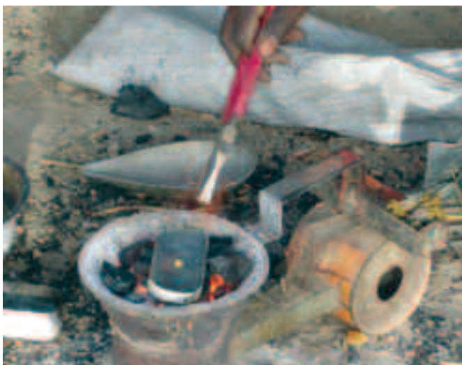
A woman holds liquid mercury, used to extract gold, in her bare hand at Baroya, Kéniéba circle. The mercury binds to any gold present, creating a gold-mercury amalgam. A local trader burns a mercury-gold amalgam. The mercury vaporizes during the process. Mercury vapors are highly toxic.

artisanal mining, politically, financially, and with technical expertise. There is the need to convene a national roundtable on hazardous child labor in artisanal mining in Mali, to bring together all relevant actors—government, civil society, UN, donors, experts, and business—and create momentum for concerted action.