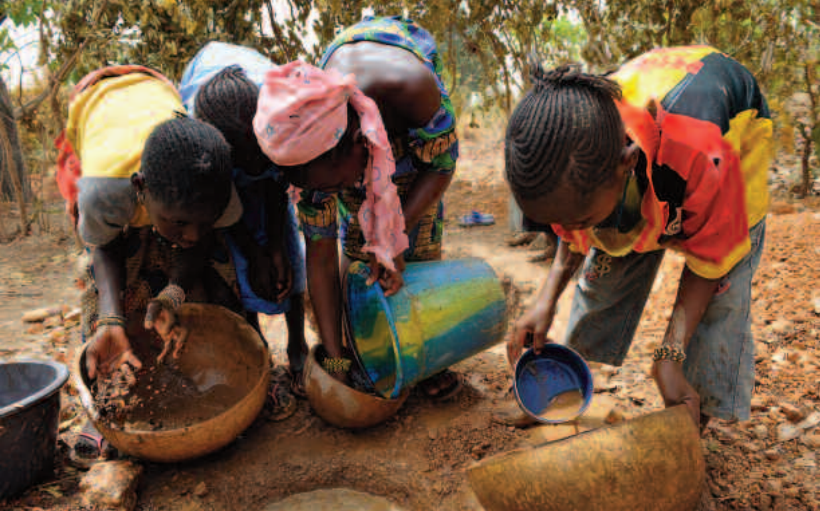
Children and a woman pan for gold at an artisanal gold mine, Kéniéba circle, Mali.