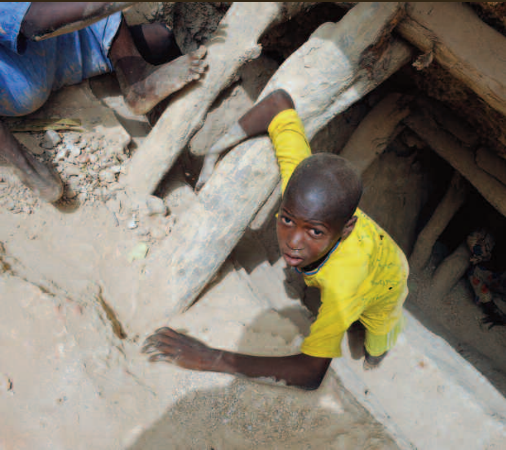
A boy climbs out of a shaft at an artisanal gold mine, Kéniéba circle, Mali.