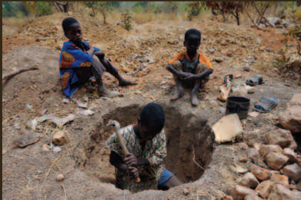
A boy digs a shaft at an artisanal gold mine, Kéniéba circle, Mali.