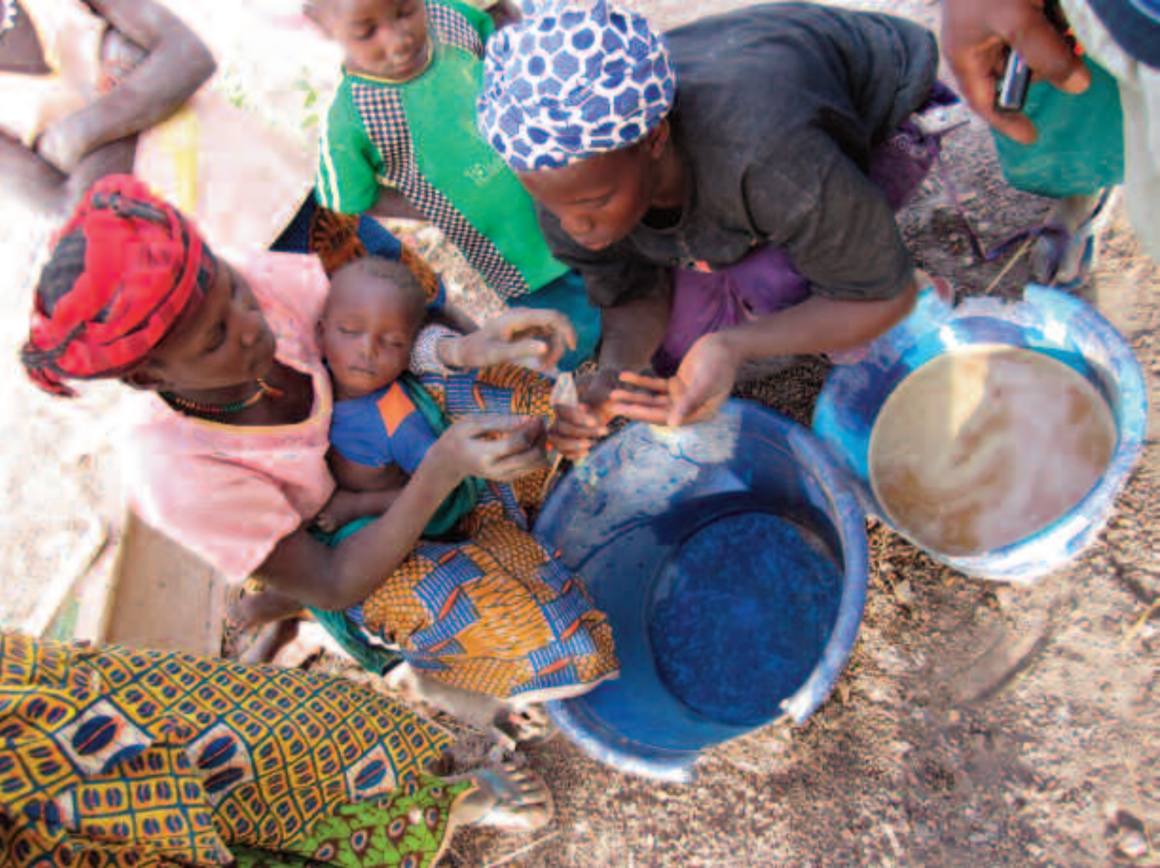
Women work with mercury in the presence of small children at Baroya mine, Kéniéba circle. Miners habitually handle mercury in the course of gold processing.