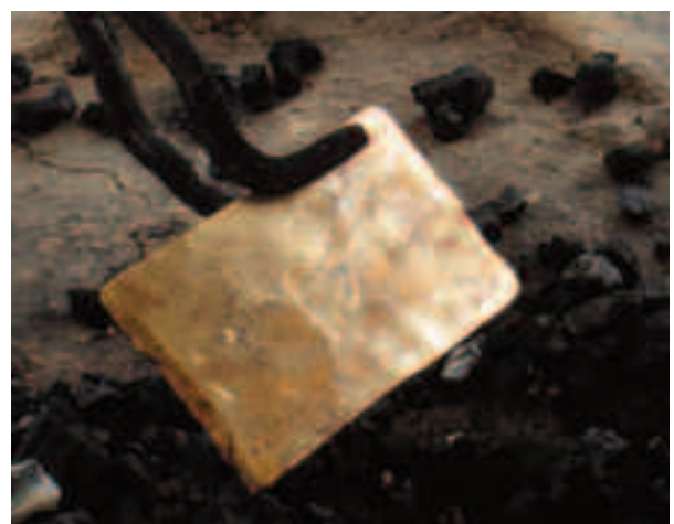
A bar of gold melted at a trading house in Bamako.

At the regional level, the Economic Community of West African States (ECOWAS) should ensure that the future ECOWAS Mining Code prohibits child labor in artisanal mining, including the use of mercury, and mandates governments to take steps to reduce the use of mercury. At the international level, the future global treaty on mercury should oblige governments to take measures that end the practice of child laborers working with mercury. The ILO should build on its past efforts to end child labor in artisanal mining by reviving its “Minors out of Mining” initiative.