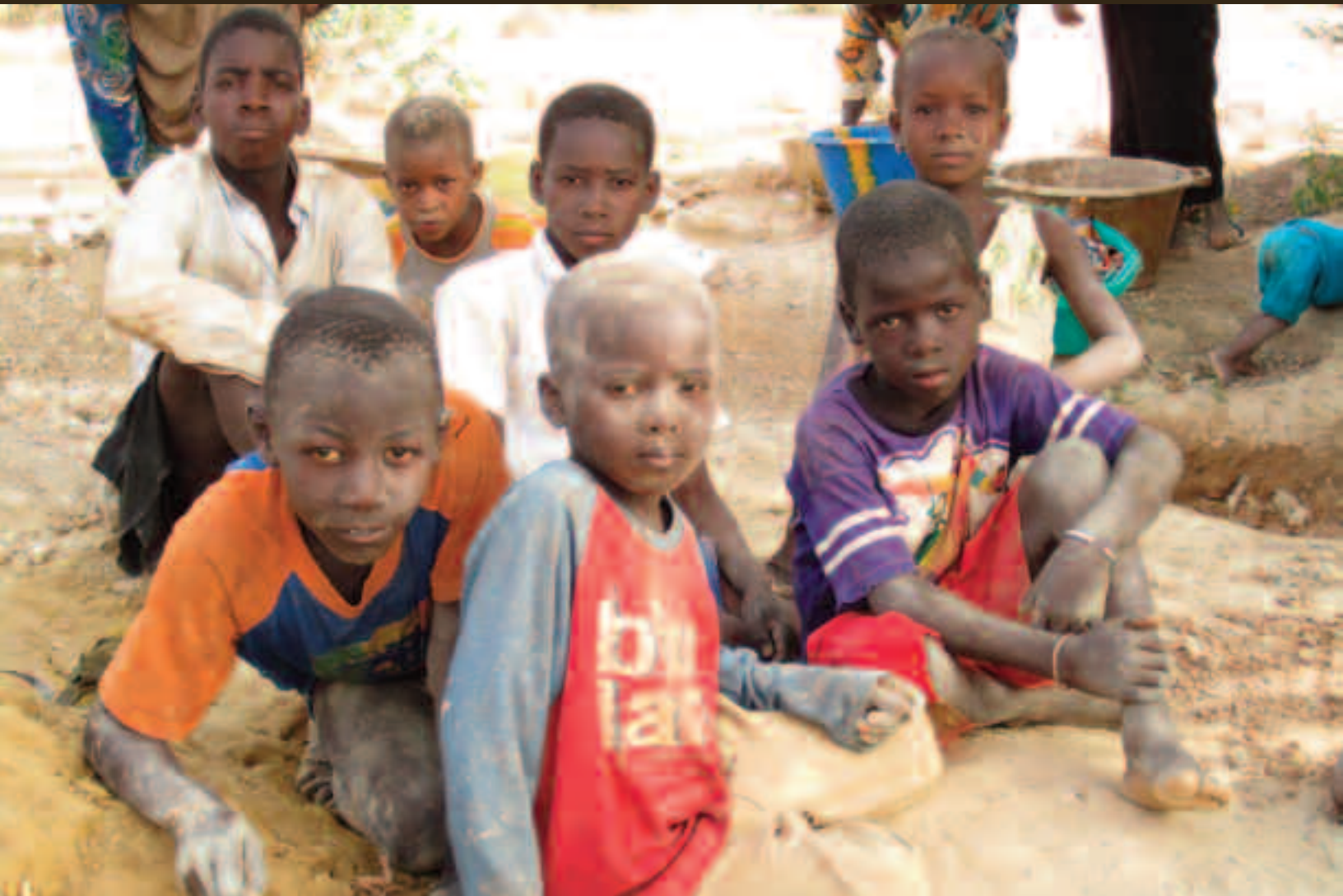
A group of boys working at Tabakoto mine, in Kéniéba circle. Young boys frequently dig holes or pull up the ore with buckets.