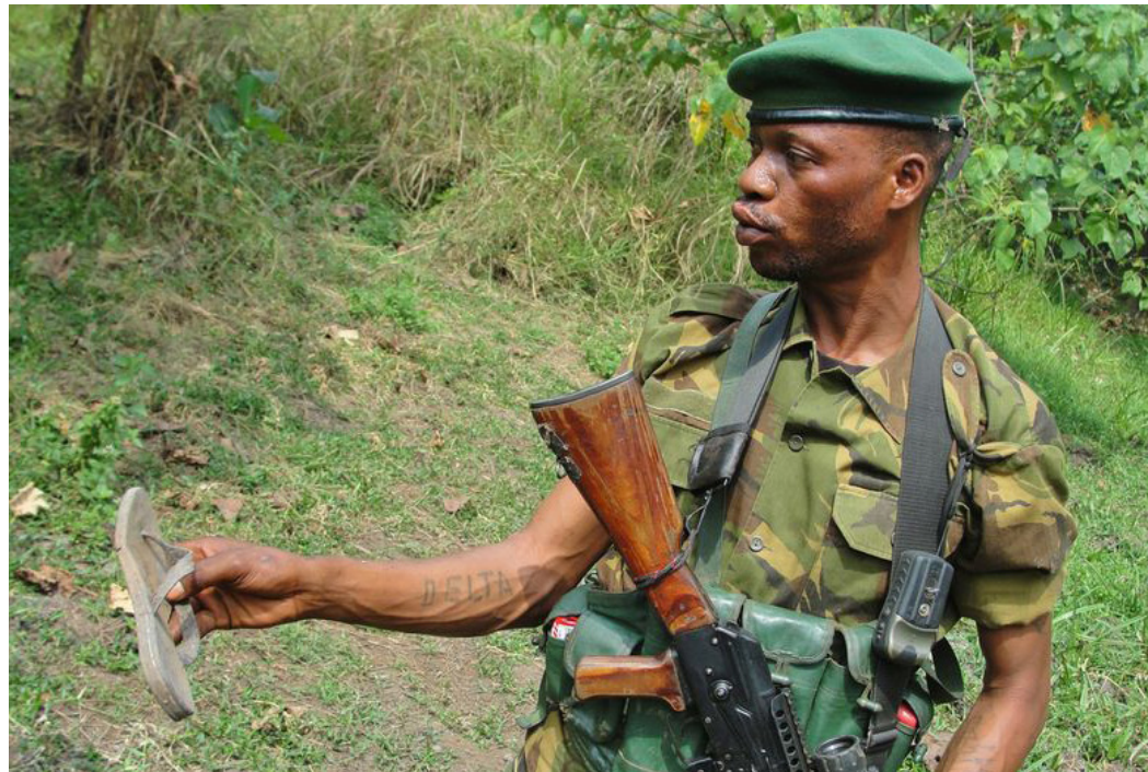
A Garamba ranger discovers footwear once worn by a female captive at an LRA campsite in a heavily wooded ravine fed by a spring.

Garamba park rangers suspect that members of the armed forces of DRC, South Sudan, Sudan, and Uganda are poaching elephants. Criminal gangs, long a part of the poaching business, continue to kill elephants in Garamba and elsewhere in Africa. Most troubling is the way in which revenues from poaching are enabling some armed groups to finance their atrocities. There is evidence, for example, that Somalia's al Shabab terrorist group is poaching elephants in Kenya to fund its domestic and international terrorist activities. 67