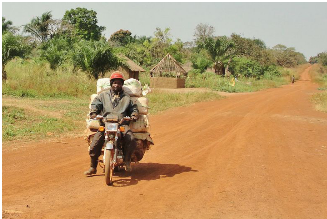
Motorcyclist carrying goods to market on the road from Nagero to Dungu, DRC. The LRA ambushes bicyclists and motorcyclists carrying trade goods on this road about twice a month.

The LRA established a semi-permanent presence in the Garamba area starting in 2005. 42 The precise number of LRA fighters currently there is not known. Recently escaped abductees report that the LRA establishes camps in Garamba for up to three months and that it operates in three main groups. These eyewitnesses estimate that the LRA presence in the Garamba area totals 70 to 100 armed fighters accompanied by 150 to 200 women, children, and recent abductees who are often used as porters. 43 Rangers report that this estimate appears to be consistent with their own encounters with LRA groups and their discoveries of LRA campsites. 44 In 2010 former LRA fighters reported to the Enough Project that Kony regarded the Garamba area as important enough to maintain a consistent presence. 45