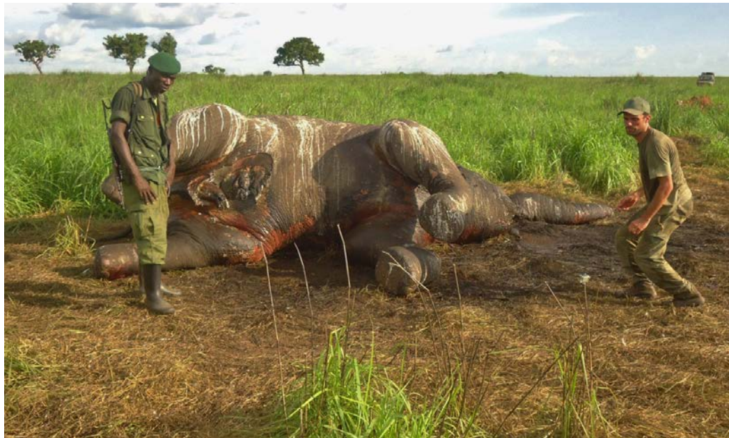
Garamba staff examine the carcass of a poached elephant in May 2012.

The Council also calls on the United Nations and AU to jointly investigate the LRA's logistical networks and possible sources of illicit financing, including alleged involvement in elephant poaching and related illicit smuggling. 23