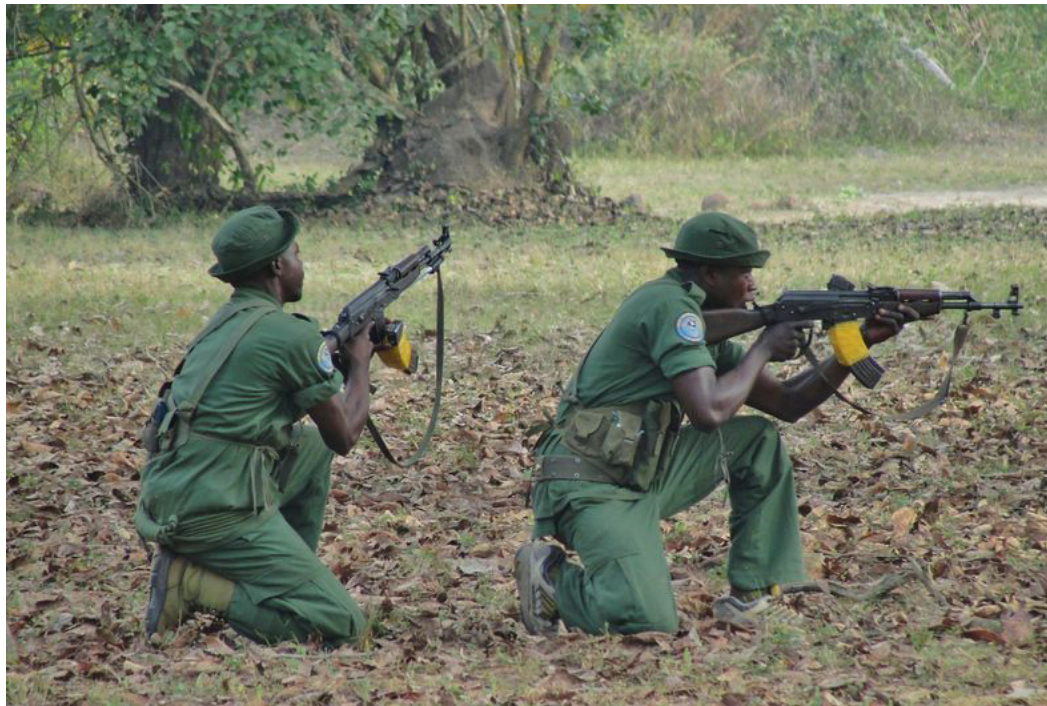
Garamba National Park rangers train to engage the LRA and other poachers in January 2013.

In addition, increased capacity to gather and share reports from the ground, combined with geospatial information, could improve ongoing efforts to predict the LRA's likely future movements and behaviors.