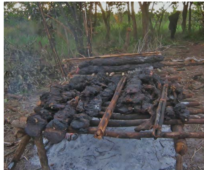
Rangers discovered bush meat smoking on a rack at an LRA campsite in Garamba.

Militias, members of armed forces, bandits, and criminal gangs are engaged in this bloody trade. 64 A recent U.N. report on elephant poaching explains that, “Environmental crime is particularly attractive to these groups when compared with other forms of criminal activity because of its high profit margin coupled with a low probability of being caught and convicted due to the fact that transnational law-enforcement in this sector is virtually non-existent.” 65 This accelerating trend of poaching, together with habitat loss and human-elephant conflict, threatens wild elephants with local extinction in some parts of Africa within 50 years, according to the World Wildlife Fund. 66