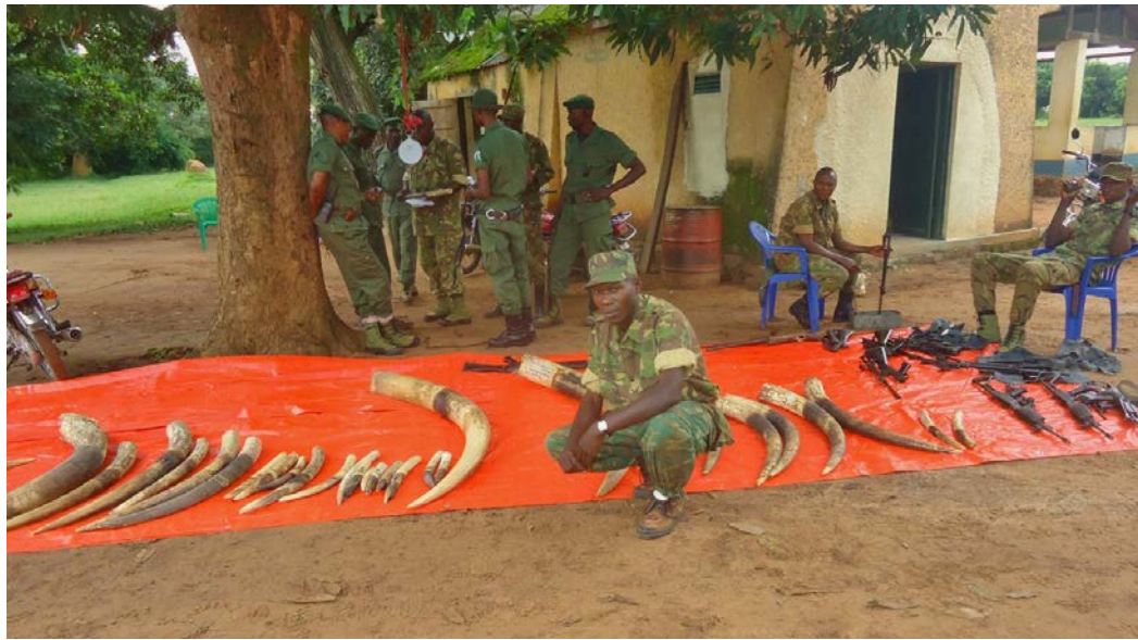
Rangers display ivory tusks recovered in Garamba.