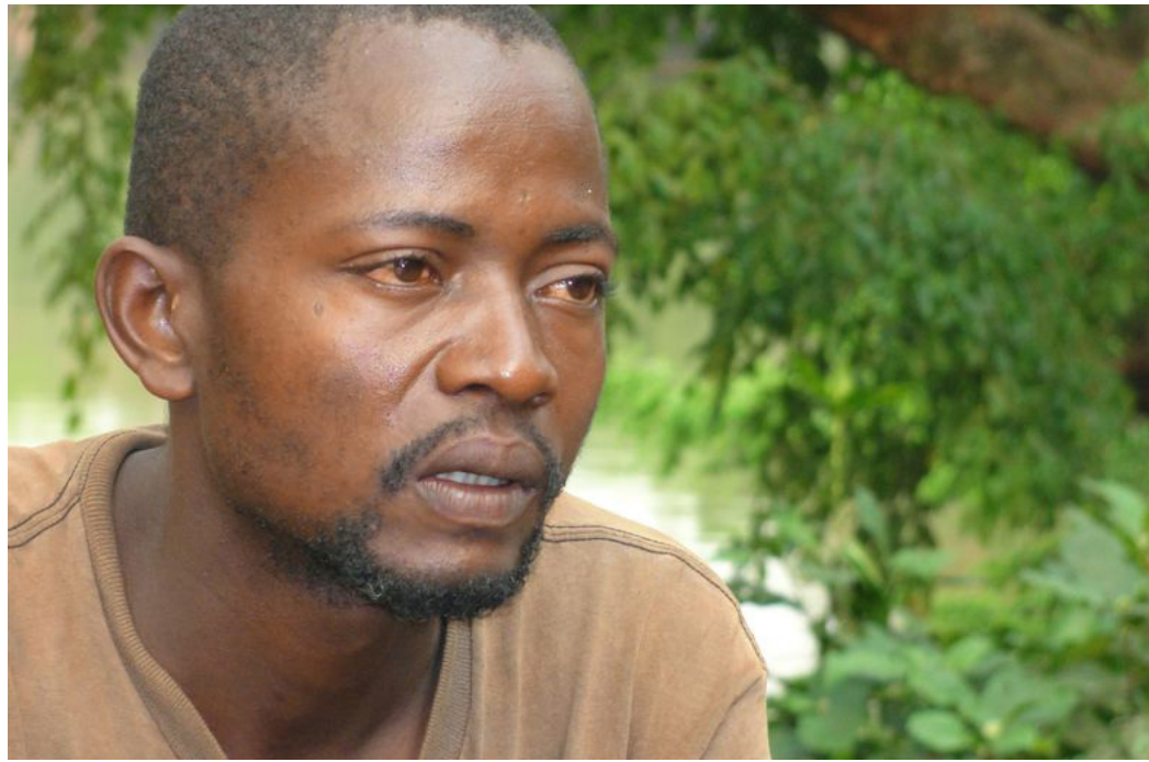
A man who recently escaped the Lord's Resistance Army after a year of captivity reports that fighters shoot elephants and cut out their tusks before bringing in captives to strip the meat.

We were also shooting elephants. The LRA fighters would kill the elephants and cut off the tusks. Then the prisoners were brought to the elephant carcasses to strip off the meat and carry it back to the main camp. During the one year that I was a prisoner of the LRA, I took part in carrying meat from six elephants. 35