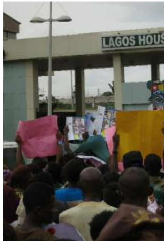
Forcibly evicted people of Badia East peacefully protesting against the forced eviction at the Lagos State Governor's office in Ikeja on 25 February 2013. The protesters stood outside for nearly five hours requesting to meet the Governor, but he did not appear.