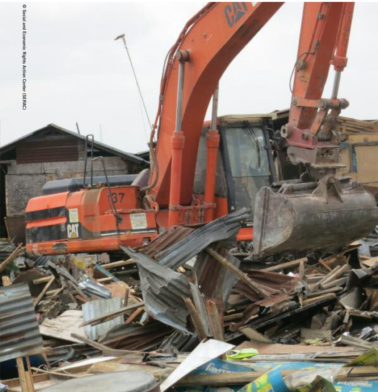
A bulldozer demolishing homes in Badia East. On 23 February 2013 at least 266 structures were demolished by the Lagos state government. There was no genuine consultation and reasonable notice before the demolition.