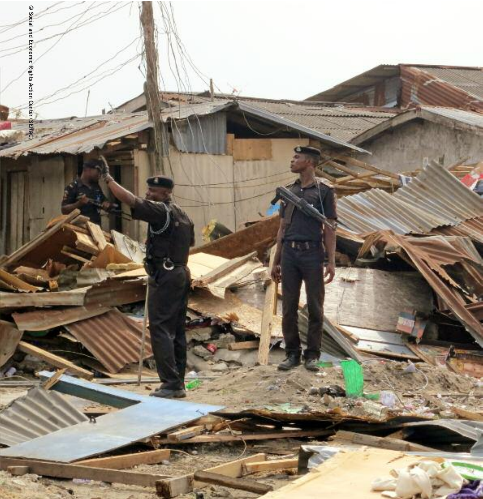
Armed police officers supervising the forced eviction in Badia East. Affected people said the police threatened to shoot them if they did not move out of their homes.