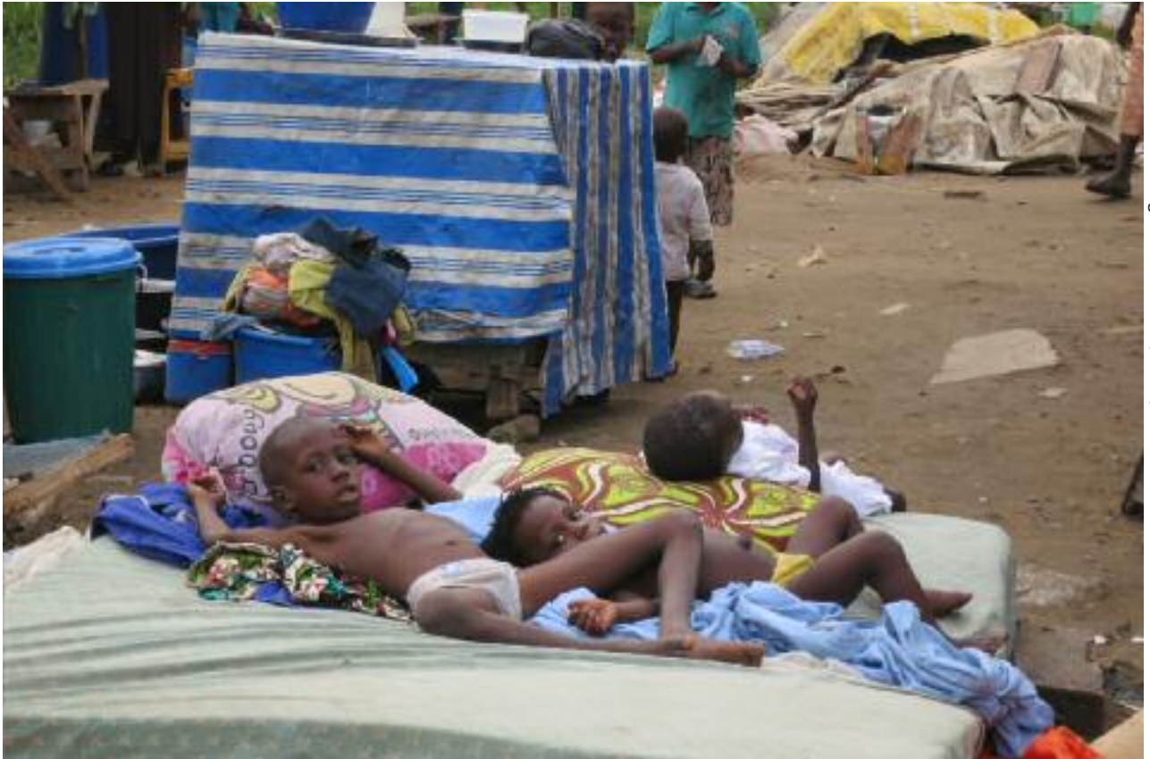
© Social and Economic Rights Action Center (SERAC)

appropriate and proportional to the gravity of the violation and the circumstances of each case, such as: loss of life or limb; physical or mental harm; lost opportunities, including employment, education and social benefits; material damages and loss of earnings, including loss of earning potential; moral damage; and costs required for legal or expert assistance, medicine and medical services, and psychological and social services.” 119