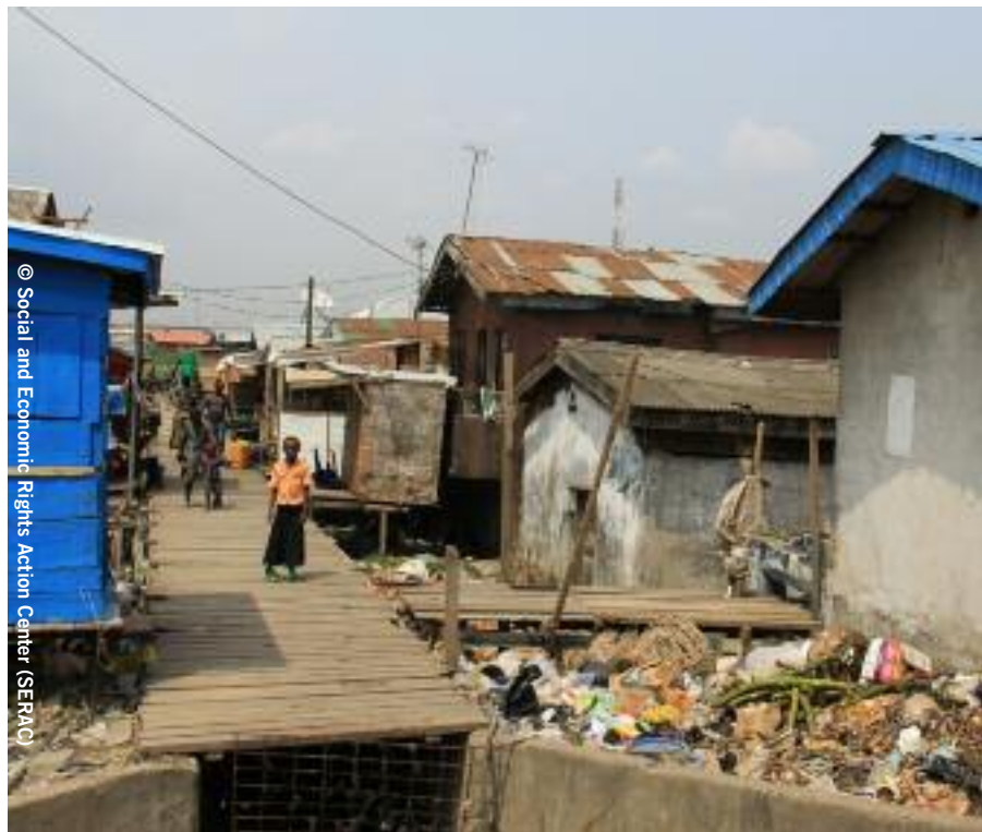
A section of the Badia East community before the forced eviction of 23 February 2013.

According to the database, at least 266 structures 130 were destroyed: 170 in Ajeromi and 96 in Oke Ilu-Eri. Some 2,237 households lost their homes and businesses. Of these, 247 households belong to landlords and the remaining 1,990 are tenant households. It is estimated that household sizes ranged between four and eight people. At a minimum, therefore, even going by the lower estimate of household sizes, at least 8,948 people were forcibly evicted.