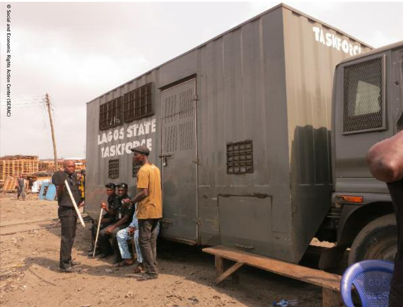
A "Black Maria" belonging to the Lagos State Environmental and Special Offences Enforcement Unit (Task Force), with police officers guarding it, parked on site during the demolition in Badia East. At least three residents were detained inside the vehicle for over six hours.