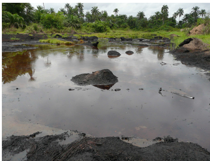
The impact of a 2006 oil spill near Ikarama, taken on 31 March 2008

Shell also stated that the 2006 spill had been certified by the government as such. Although Amnesty International confronted Shell with the photograph seen here the company has never explained how the site could be classified as cleaned up. This lack of clean up was of particular concern given its proximity to homes and to children playing. No efforts had been made to secure the site or prevent accidents.