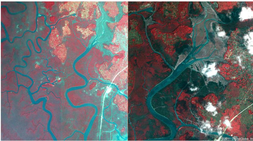
Satellite images of Bodo and the intertidal zone (top right) and adjacent waterways, Nigeria, taken on 4 December 2006 (left) and 26 January 2009 (right), © 2011 DigitalGlobe, Inc, produced by the American Association for the Advancement of Science (AAAS).

A similar false-colour satellite image was taken on 26 January 2009 and contrasted with the 2006 image. It shows how large swathes of vegetation near Bodo's riverbanks have turned from bright red to black, the latter colour indicating plant death. A third image was taken on 8 January 2011. The areas with dead vegetation still appear black, with little visible recovery.