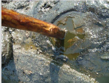
Photograph of the spill point at Bodo, © CEHRD

As the JIV was proceeding people took photographs of the affected area of the pipe (see below). Amnesty International shared the photographs with Accufacts, who also saw evidence of corrosion. Accufacts stated: "This is apparently due to external corrosion. Notice the layered loss of metal on the outside of the pipe around the "stick" from pipe wall loss (thinning) due to external corrosion. It is a very familiar pattern that we have seen many times on other pipelines." 72