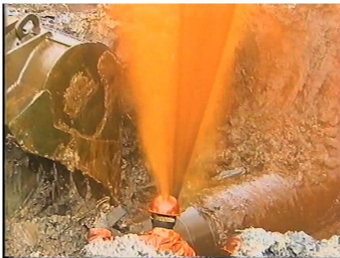
Oil gushing from the pipeline at Bodo on 7 November 2008, the day of the oil spill investigation

Despite the statement by Shell above, three separate sources record 28 August as the start date (the testimony of those living at Bodo, the NOSDRA database and the State Ministry of Environment’s hand-written records); there is no evidence whatever that it began on 5 October, which Shell’s email, quoted above, acknowledges when it says “information about the spill reached us on October 5. ”