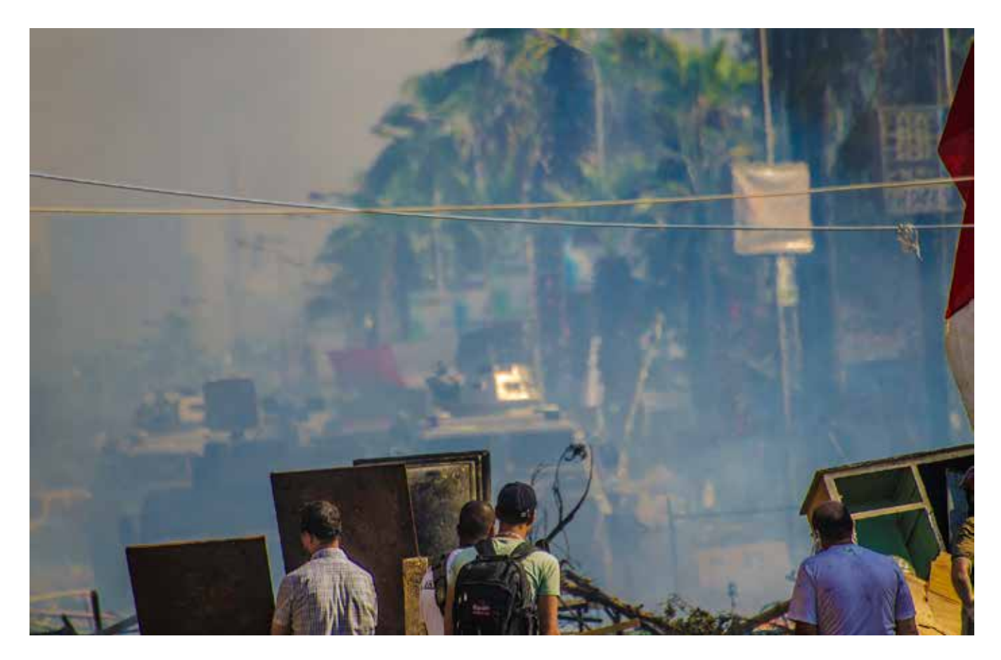
Armed personnel carriers (APCs) operated by the Egyptian police approach protesters assembled behind makeshift fences in Rab'a al-Adawiya Square in eastern Cairo on August 14, 2013.

protest encampment, where demonstrators, including women and children, had been camped out for over 45 days, and opened fire on the protesters, killing at least 817 and likely more than 1,000.