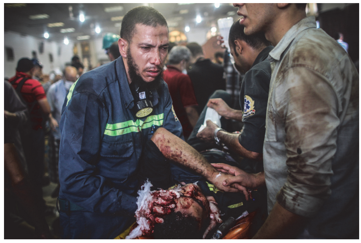
An injured ambulance worker surrounded by colleagues in the Rab'a field hospital on August 14, 2013 after getting shot while trying to reach injured protesters during the dispersal in Rab'a square. He died of his injuries, according to witnesses.

By around 8:30-9 a.m., security forces had arrived near the Traffic Directorate building on Nasr Street and teargas, birdshot, and live fire began to reach the field hospital, just meters away. Doctors instructed volunteers and the injured to move away from windows, as pellets and bullets came through. A volunteer pharmacy student, who helped doctors on the day of the dispersal, told Human Rights Watch: