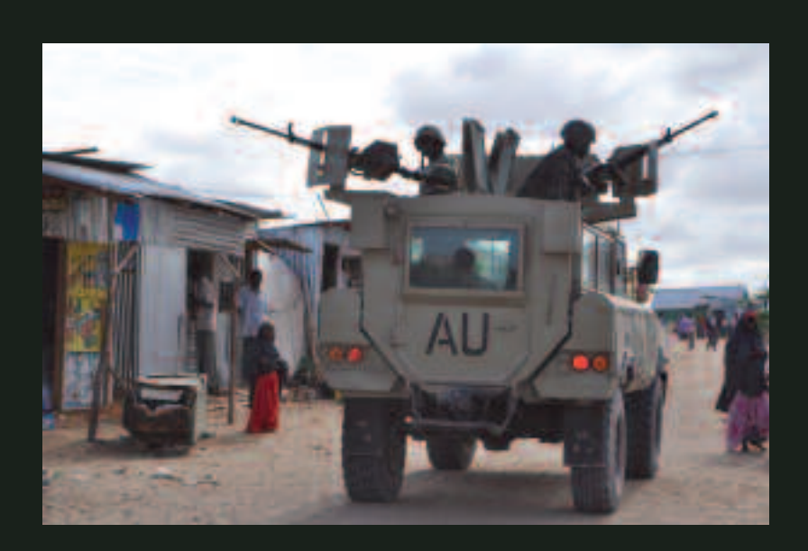
AMISOM troops patrolling the Zona-K camp for displaced people in Mogadishu's Hodan district in June 2012.

Human Rights Watch urges troop-contributing countries to appropriately punish perpetrators and ensure survivors are adequately supported. It calls on the AU and AMISOM to foster an organizational culture of "zero tolerance" of unlawful activities on their bases. International donors should closely monitor AMISOM and take action when AMISOM forces are committing sexual exploitation and abuse and when the relevant authorities have failed to take the necessary corrective measures.