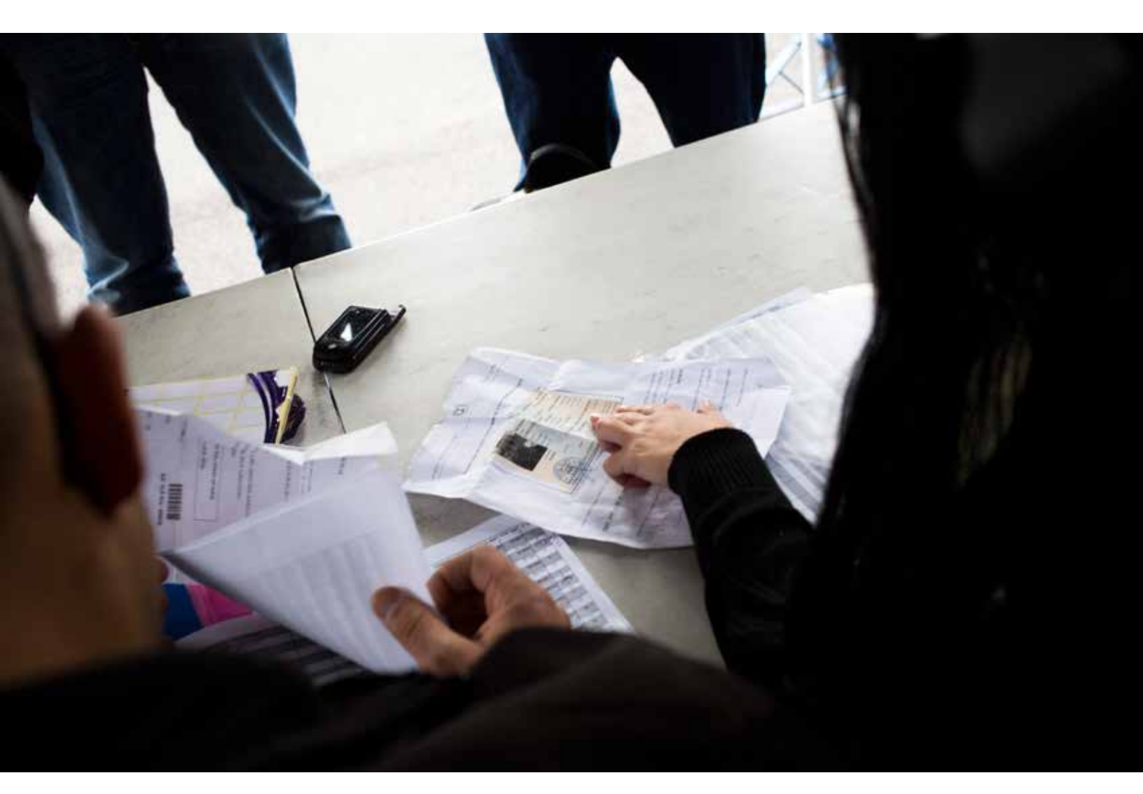
Israeli immigration police in Tel Aviv check the identity documents of "infiltrators" ordered to report to the Holot "Residency Center" in Israel's Negev desert, January 26, 2014. Israeli law allows the authorities to arrest and detain anyone failing to report.

The fate of Eritreans returning from Israel is unknown, although Human Rights Watch has documented how the Eritrean authorities abuse some Eritreans returning from other countries. Seven Sudanese returning from Israel told Human Rights Watch they were detained and interrogated in Sudan's capital, Khartoum, with three held for long periods during which time one was tortured, a second was put in solitary confinement, and a third was charged with treason for visiting Israel. Others were released after short periods.