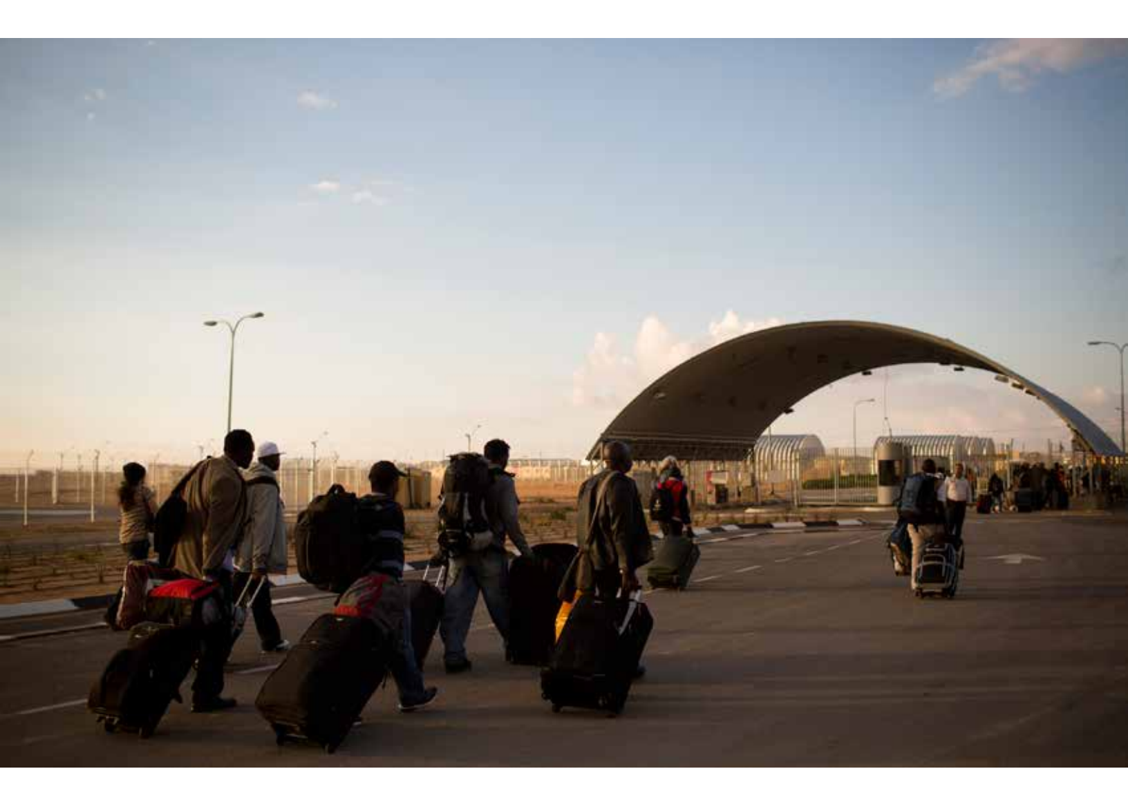
Eritreans and Sudanese report to the Holot "Residency Center" in Israel's Negev desert on February 17, 2014. Holot is a detention center in all but name, with "residents" required to sign in three times daily, and be there by night, while the nearest town is 65 kilometers away.

By 2012, Israel had deported about 2,300 Sub-Saharan African nationals back to their home countries, including to South Sudan which became independent in July 2011, after it had decided they no longer risked harm there. But it was still faced with the question of how to treat the approximately 37,000 Eritreans and 14,000 Sudanese seeking sanctuary in Israel who had managed to cross from Egypt before Israel's new fence had all but sealed off its border with Egypt in December 2012.