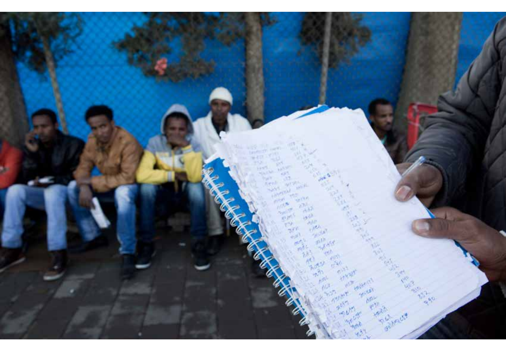
Sub-Saharan African nationals wait outside Israeli Interior Ministry offices in Tel Aviv on March 13, 2014 to renew their "conditional release permits." Any Eritrean or Sudanese who entered Israel before May 31, 2011 can have their permit cancelled and be summoned to report to the Holot "Residency Center" in Israel's Negev desert where they face indefinite detention.

Fairly reviewing tens of thousands of individual asylum claims in line with international refugee law standards would run up huge bills, take years, and, in any case, lead to the likely conclusion that all Sudanese and most Eritreans in Israel have valid refugee claims.