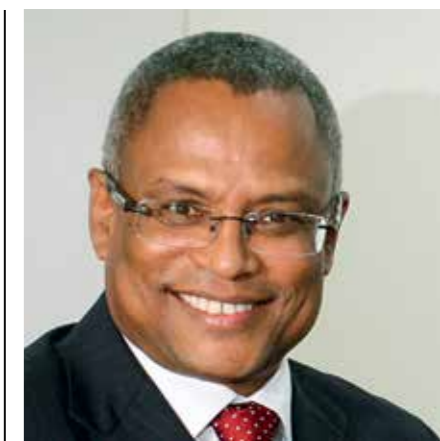
José Maria Neves

Macky Sall a également été Premier Ministre de la République du Sénégal du 21 Avril 2004 au 19 juin 2007 et Président de l'Assemblée nationale de Juin 2007 à Septembre 2008. En Décembre de la même année, il crée son parti politique l'Alliance pour la République (APR-Yakaar). Il est élu Président de la République du Sénégal en Mars 2012 avant de prêter serment le 02 avril 2012 devant le Conseil Constitutionnel.