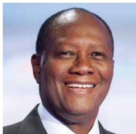
H.E. Alassane Ouattara