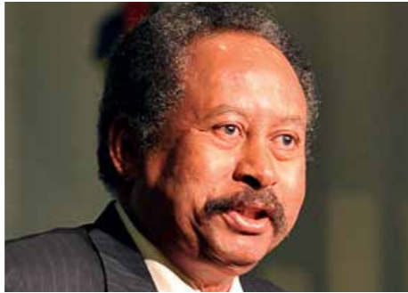
Dr. Abdalla Hamdok Deputy Executive Secretary, Economic Commission for Africa

Mr. Sidibé was appointed Executive Director of UNAIDS and Under-Secretary-General of the United Nations in 2009. Mr Sidibé previously worked as Country Director for Terre des Hommes, and oversaw programmes across 10 francophone African countries as country representative for UNICEF. Michel Sidibé holds two post-Master's Diplomas – in Social Planning and Demography and Development and Political Economy – from the University of Blaise Pascal, Clermont-Ferrand, France, and a Master's degree in Economics.