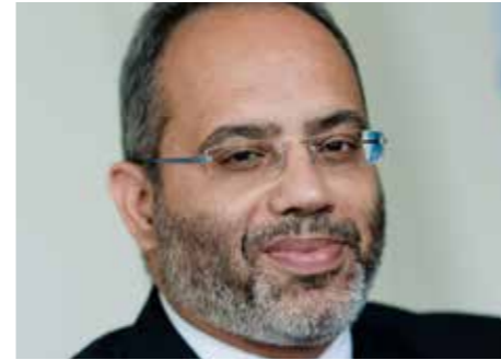
Dr. Carlos Lopes United Nations Under Secretary-General and Executive Secretary, Economic Commission for Africa

Dr. Lopes is the Executive Secretary of the Economic Commission for Africa at the level of UN Under Secretary-General. He has more than 24 years of senior leadership experience at the United Nations that includes serving as Executive Director of the United Nations Institute for Training and Research, Director of the UN System Staff College, Director for Political Affairs in the Executive Office of the Secretary-General, all at the level of Assistant Secretary-General; and UN Resident Coordinator in Zimbabwe and Brazil.