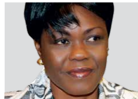
H.E. Ms. Kaba Nialé Minister to the Prime Minister in charge of Economy and Finance, Côte-d'Ivoire

H.E. Ms Kaba Nialé is the first woman in an Ivorian Government, as Minister to the Prime Minister in charge of Economy and Finance, Ms. Nialé Kaba holds a Master of Economics degree, with a specialty in Public Economics, obtained from the University of Abidjan in 1985. A Statistician and Economist Engineer, she obtained a postgraduate diploma (DEA) in International Economics at the CESD of Sorbonne University and is a graduate of the IMF Institute in Economic Policy Management.