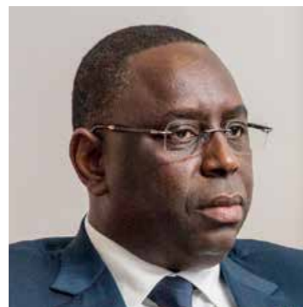
H.E. Macky Sall

Alassane Ouattara est né le 1er Janvier 1942, à Dimbokro (dans le centre de la Côte d'Ivoire). Il est économiste de profession et débute sa carrière en Avril 1968 au Fonds Monétaire International (FMI), où il restera jusqu'en 1973. En novembre 1984 il retourne au FMI pour occuper la fonction de Directeur Afrique avant de devenir Conseiller du Directeur General en 1987. De 1973 à 1984, Ouattara a également occupé plusieurs postes au sein de la Banque centrale des États de l'Afrique de l'Ouest (BCEAO) dont ceux de Charge de mission à Paris (1973-1975); Conseiller spécial du Gouverneur et Directeur de Recherche (Février 1975-Décembre 1982) et Vice-Gouverneur (Janvier 1993-Octobre 1984). Il prête serment comme Gouverneur de la BCEAO en Décembre 1988. En 1990, il est nommé Président du Comité Interministériel de Coordination du Programme de Stabilisation et de Relance Economique avant de devenir Premier Ministre de Côte d'Ivoire, poste qu'il occupera jusqu'en 1993. Entre 1994 et 1999 il assume les fonctions de Directeur General Adjoint du FMI. Ouattara fait son retour sur la scène politique Ivoirienne en 1999 et est élu Président du Rassemblement des Républicains (RDR), son parti politique. Il devient Président de la République de Côte d'Ivoire en 2011.