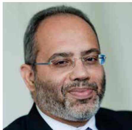
Dr. Carlos Lopes Executive Secretary of ECA

Dr Carlos Lopes Secrétaire exécutif, CEA