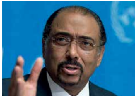
Mr. Michel Sidibé Executive Director, UNAIDS and Under Secretary-General of the United Nations

Led by the Global Fund to Fight AIDS, Tuberculosis and Malaria, in collaboration with African strategic partners