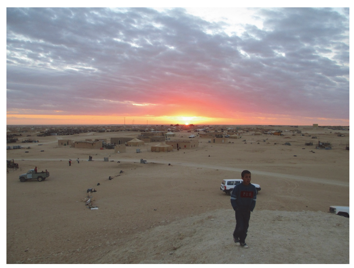
Sunset over Smara camp, the largest of five camps where Sahrawi refugees have lived since 1976.

King Hassan II of Morocco argued that Spanish colonization had interrupted Moroccan rule, which should resume once Spain left. Before Spain carried out the referendum, Morocco asked the UN General Assembly to refer the question to the International Court of Justice.