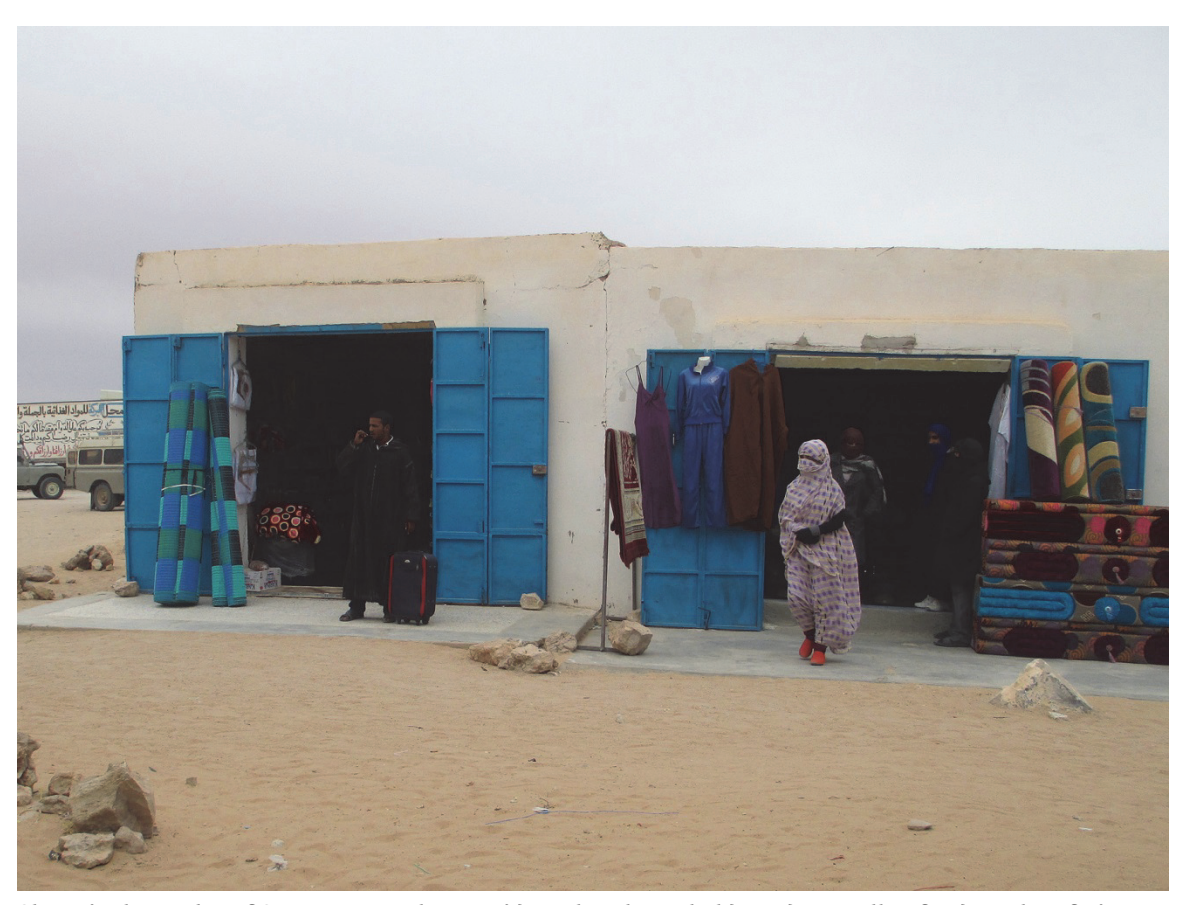
Shops in the market of Smara camp, where residents buy household goods as well as foods such as fruits, vegetables, and meat, which are not typically included in UN food aid.

important to refugees' ability to maintain basic nutrition and living standards. Trade and animal husbandry provide income, household goods, and meat, milk, vegetables, and fruits, which are not typically included in international food aid. <sup>59</sup> Livestock herders in the Tindouf area bring their animals to graze in the less arid lands in Polisario-controlled Western Sahara. Traders visit Tindouf and Mauritania to buy food and household goods. Fuel traders transport Algerian gasoline to Polisario-controlled Western Sahara and Mauritania for sale.