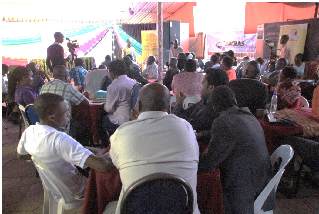
A public meeting in Harare on 13 February 2015 to commemorate World Radio Day.

Interview with community activist in Kariba, 6 September 2014