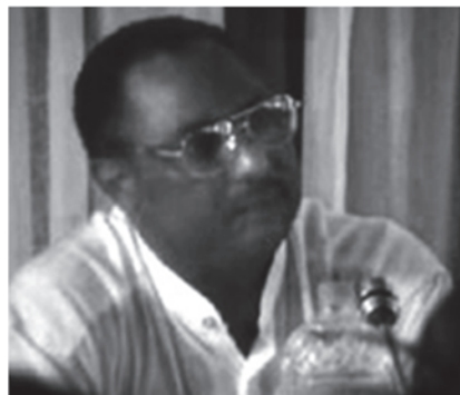
Deyda Hydara, a Gambian journalist and an outspoken critic of the Jammeh administration, was 58 when he was killed on December 16, 2004.

Since Jammeh came to power in 1994, state security forces and paramilitary groups such as the Jungulers have extrajudicially executed dozens of people. Many others were forcibly disappeared and are presumed dead. Most of those killed or “disappeared” were critics of the government, opposition activists or those suspected of supporting the overthrow of Jammeh’s government. No one has been brought to account for these abuses.