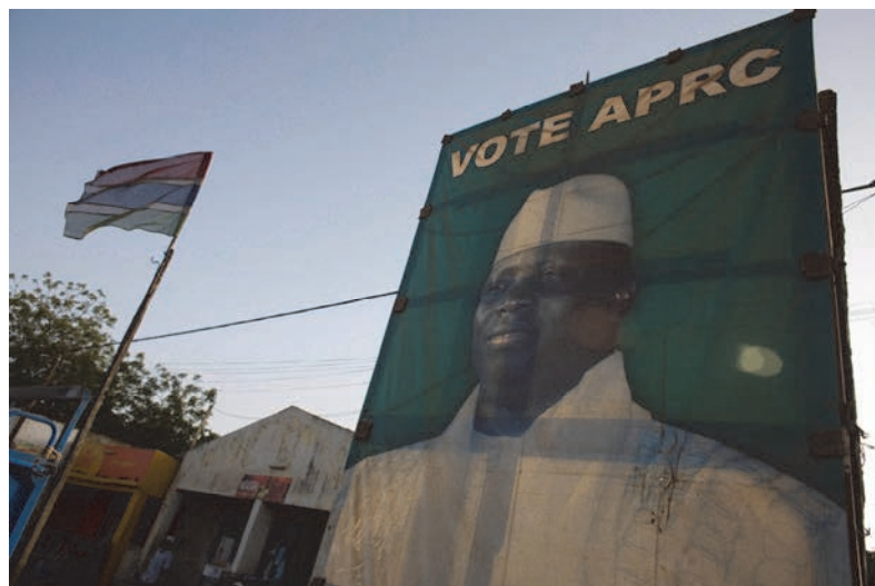
A billboard, with the image of President Yahya Jammeh, urging people to vote for Gambia's ruling party, the Alliance for Patriotic Reorientation and Construction (APRC), in Serekunda, a town west of the capital, Banjul.

Despite nurturing the pretense of democratic governance, Jammeh has, over the last two decades, consolidated power in the executive