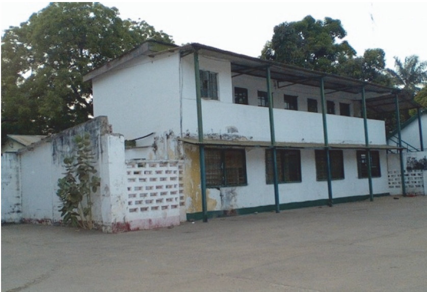
The National Intelligence Agency headquarters in Banjul.

In most cases of torture documented by Human Rights Watch, the abuse took place in the NIA headquarters in Banjul, Mile 2 prison's maximum security wing or an unofficial detention center and often in the presence of senior NIA officials. Even when a different security service was responsible for an initial arrest and detention, torture was almost always carried out by the Jungulers and to a lesser extent by NIA officials.