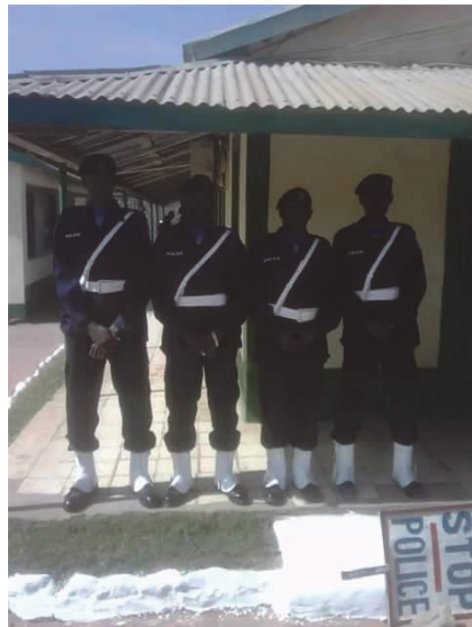
Members of the Police Intervention Unit (PIU), an armed unit of the Gambian Police Force. The PIU has been implicated in abuses including use of excessive force at public demonstrations.

Together, they are responsible for engendering a state of fear upheld by campaigns of intimidation, arrests, detention, disappearances, torture, and extrajudicial killings. Several former members of intelligence and the military told Human Rights Watch that they believe the reporting and command structures as prescribed by Gambian law are no longer relevant to the actual operations of these groups, thus hindering accountability and promoting widespread fear and impunity for the abuses committed by their agents.