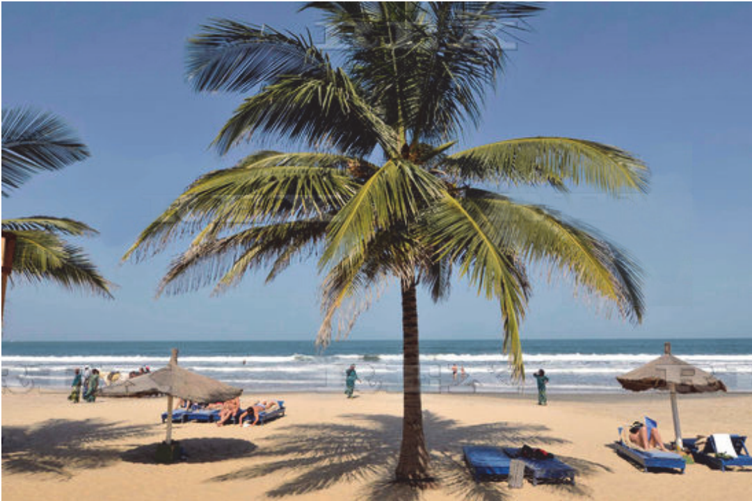
Gambia is known for its beautiful beaches, such as this one south of Banjul.

The Republic of The Gambia is the smallest country on continental Africa, with a population of roughly 1.9 million, 1 and a land mass about the size of Jamaica 2 . Save for a western seaport, the country is surrounded by Senegal and is known abroad for its beaches, wildlife, and lively culture that attract tourists largely from Europe.