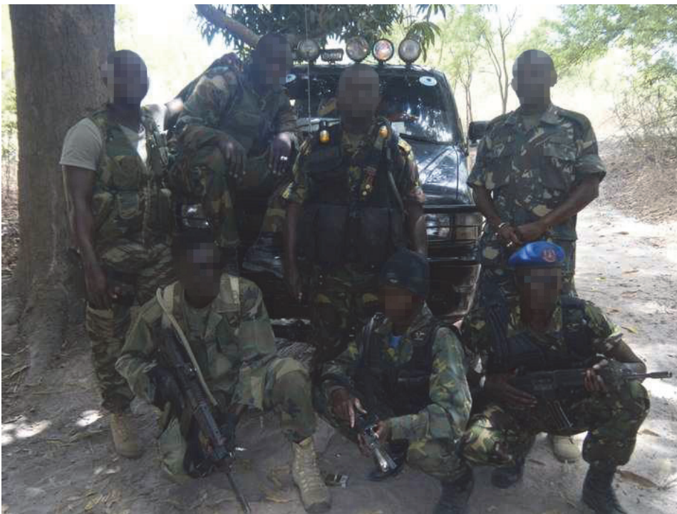
Members of the paramilitary group known as the Junglers, The Junglers have been implicated in serious human rights violations, including torture, enforced disappearances, and killings.

There is also at least one unofficial paramilitary group, known as the “Junglers,” that former members and other government insiders believed reports directly to the executive and operates outside the structure of law enforcement agencies.