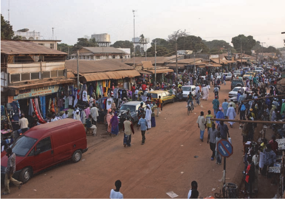
People shop at a market in Serekunda, west of Banjul.

care. 14 Vaccination rates have also increased which have in turn reduced mortality as a result of preventable diseases. 15 In 2007, President Jammeh, who has since said he can “cure Ebola,” started an herbal treatment program claiming to cure people living with HIV and AIDS. 16 However, anti-retroviral drugs are available to people living with HIV in Gambia and 86 percent of people with “advanced HIV infections” had access to ARV treatment in 2013.