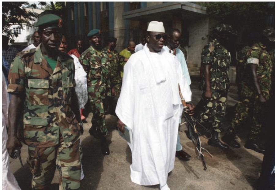
Gambian President Yahya Jammeh, surrounded by the presidential guard, leaves a central Banjul polling station after casting his vote for president in the 2006 elections.

The way the Junglers operate is a commando team that works with Yahya Jammeh directly without intermediary. Jammeh formed that team only for his own interests; it is not in the interests of the Gambia. When he wants to torture you, he uses the Junglers team to torture you. Or if he wants to arrest you secretly, he uses this Junglers team. Or when he wants to kill you without anyone finding out, they will just kill you and throw you [away]. 27