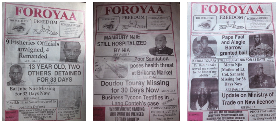
Foroyaa (meaning “freedom” in local Mandinka language), a print and online newspaper based in Banjul, reports alleged arbitrary detentions and enforced disappearances.

NIA can arrest anybody. They have officers in the army; they have people in every sector of the Gambian life. So, you cannot know the strength. They cover the country. You cannot know them. They could be your own sister...They are responsible for anything. They can arrest and torture. They have been given the power to arrest, detain, torture, anything, anytime... to arrest, even detain incommunicado. 40