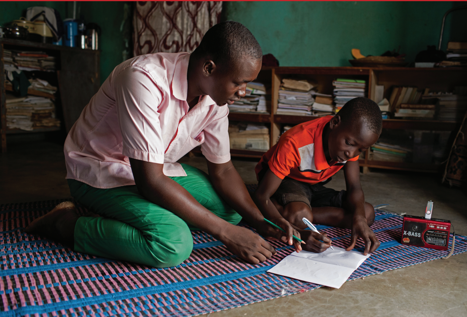
In June 2019, a facilitator assists a student with a radio school lesson in Dori, Burkina Faso. Armed groups had attacked and destroyed the student's school while the student was in class.