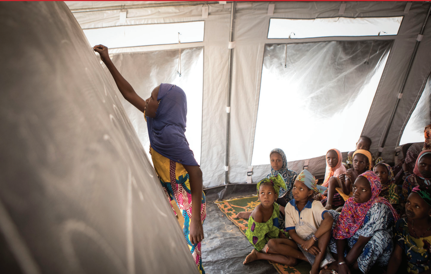
A student writes on the blackboard of a temporary learning space in a camp for internally displaced people in Mopti, Mali, in April 2019.