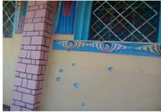
Figure 2 Saint Michael's Church

Residents deplored the perceived inaction of members and authorities of ENDF who were in the city during the attack on November 28, which they say has worsened the extent of the damage. Residents and church officials say however that a month after the November 28 attack, on December 23, an attempt by Eritrean soldiers to enter Aksum TSION Church to loot it was foiled by the combined efforts of members of ENDF and residents.