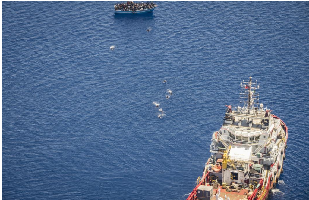
Refugees and migrants attempt to reach safety by swimming in the direction of the merchant ship Vos Triton on 14 June 2021.