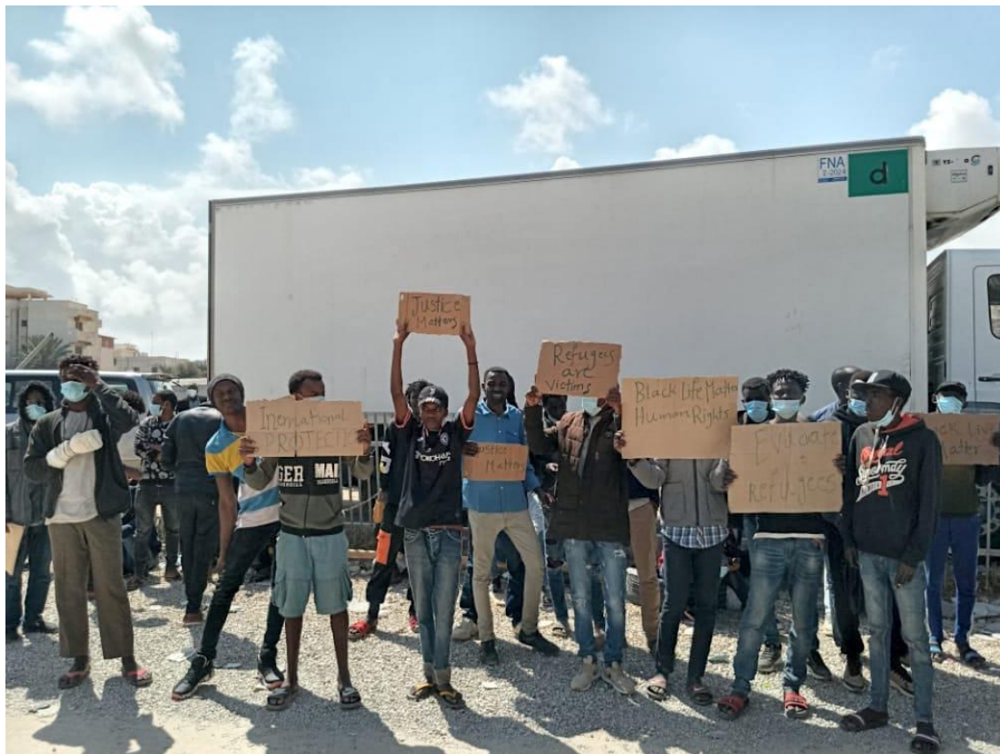
Refugees protest outside UNHCR's office in Tripoli, Libya, in April 2021, requesting protection, support and information about the status of their cases