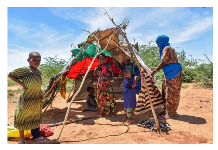
A new family arrives in Dagahaley and sets up a makeshift tent which will be their new shelter

Camp experience is gendered, with women encountering additional challenges. Many women respondents in Dagahaley noted that they were subjected to early marriages, frequently suffered gender-based violence and experienced discrimination when seeking employment. They noted that most jobs in the camp were held by men and the few who were engaged as volunteers confided that they underwent torture and harassment in their jobs. While some of these practices may be widespread irrespective of whether women live in camps or outside, what aggravated their condition, according to many, was that most men in the camps had little to occupy themselves with and felt helpless. This meant they off loaded their frustration on to women, often by being violent. At the same time, women also ended up doing all the hard work of managing the household, looking for firewood and caring for children.