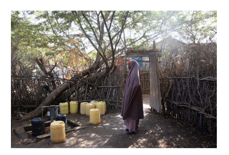
Asher collects water from a community tap. She belongs to a generation whose parents fled Kenya from Somalia.