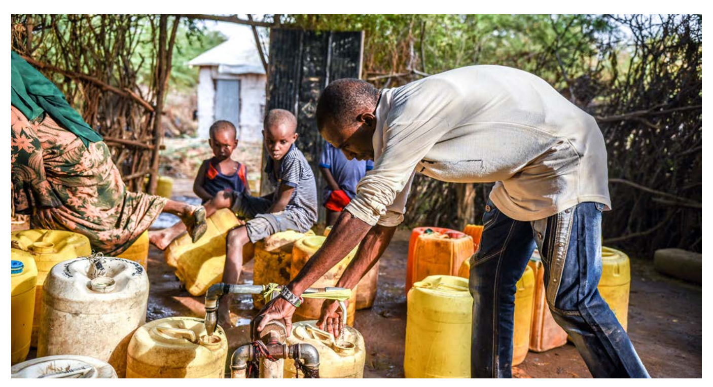
Refugees collect water at a water point in the camp