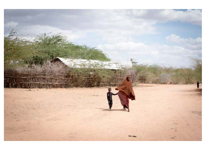
A child and a women in a thorough fare in Dagahaley camp. Dagaheley is in the arid north-eastern part of Kenya, where scorching mid-day heat can often become unbearable.

tal admissions declined in 2020 owing to movement restrictions and fear of COVID-19. MSF staff conduct at least 700 lifesaving surgeries on average per year in Dagahaley, including caesarean sections. In 2020, MSF also assisted almost 2,956 deliveries all through the year.