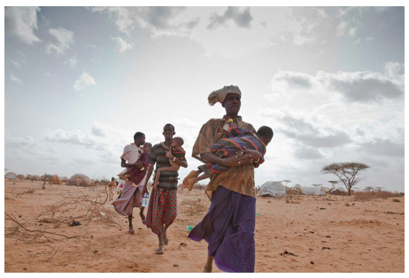
Somali refugees in Dadaab refugee camp carry their sick and malnourished children to a new feeding center run by MSF at the outskirts of the sprawling refugee camp.

The year 2021 marks the 70th anniversary of the 1951 Refugee Convention. To mark this key milestone, the UN High Commissioner for Refugees, Filippo Grandi, has emphasised that the "Convention is clear as to the rights of refugees and remains applicable in the context of contemporary and unprecedented challenges", and has appealed to governments "to uphold the key principles of refugee protection as laid out in the Convention" <sup>27</sup>. Besides explicitly prohibiting refoulement, the Convention encourages hosting states to provide refugees with wage-earning employment and social security as well as to facilitate their free movement within their territory.