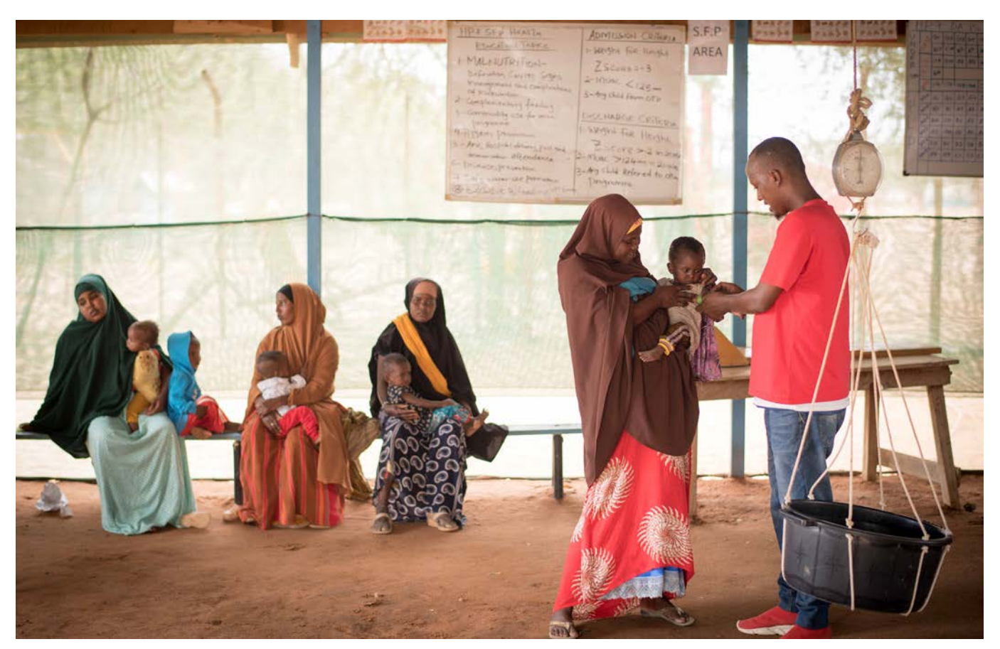
An MSF health worker measures the upper-mid-arm circumference of a child in a health post run by MSF in Dagahaley refugee camp.

place, refugees instead see their decades of encampment as the cost they have already borne to earn a life where they can move, work and live freely, in safety and dignity.