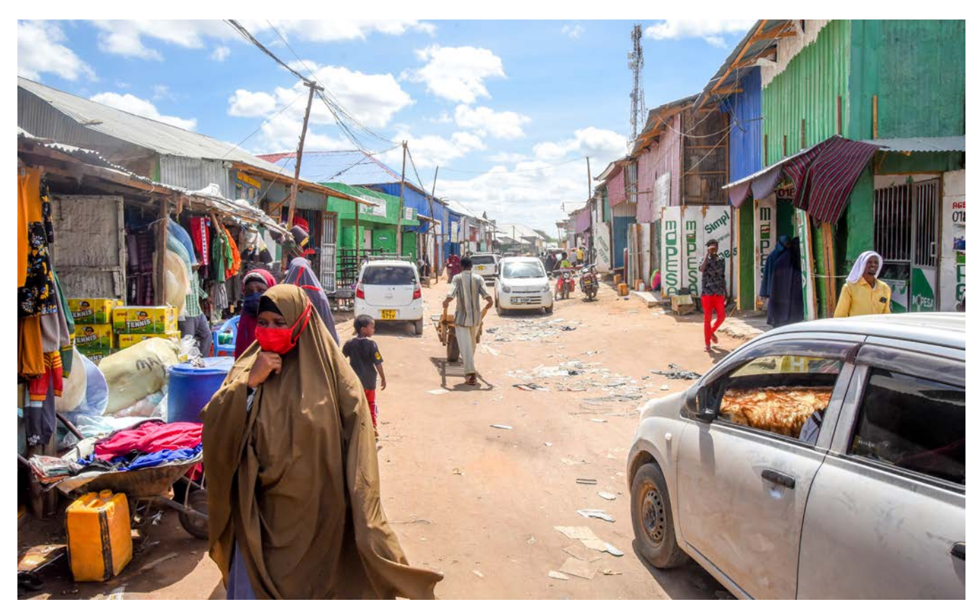
Refugees and host communities trade wares in this market in Dagahaley camp.

Given the poor record of resettling refugees living in long-term displacement, especially from the Africa region, UN-HCR should mobilise states to pledge increased resettlement slots during the High Levels Official Meeting. The meeting will be held in December 2021 to take stock of progress made in achieving the objectives of the Global Compact on Refugees. Next year, the UN Secretary General and UNHCR should bring together a critical mass of states to organize a solidarity conference for refugees in Kenya who risk no longer having access to protection following the camp closure.