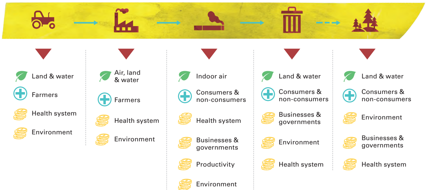
FIG 1. IMPACT OF TOBACCO LIFE CYCLE ON HEALTH, ENVIRONMENT AND ECONOMICS

Fig. 1 summarizes the impact of each of the five stages of the tobacco production and consumption life cycle (farming/cultivation, production, consumption, disposal and “residual” tobacco waste that remains in the environment) on our health, environments and economies. The figure illustrates how every stage of the tobacco life cycle impacts several different factors, contributing to long-lasting and persistent adverse effects (1–4).